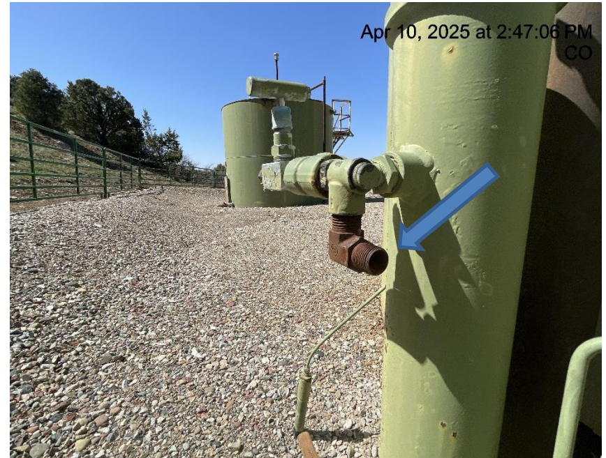
Photo # 622 PRV vent line does not comply with CECMC pressure safety device rules or general safety rules