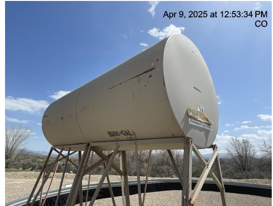
Photo # 9667 Operator emergency # on methanol tank disconnected & not in service (additionally labeling with operator name is peeling & starting to become illegible)