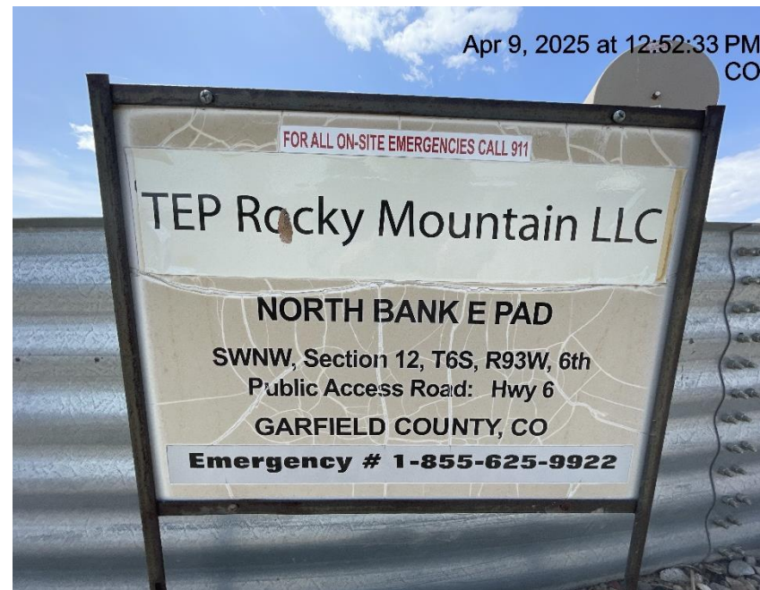
Photo # 9669 Operator emergency # on sign is disconnected & not in service