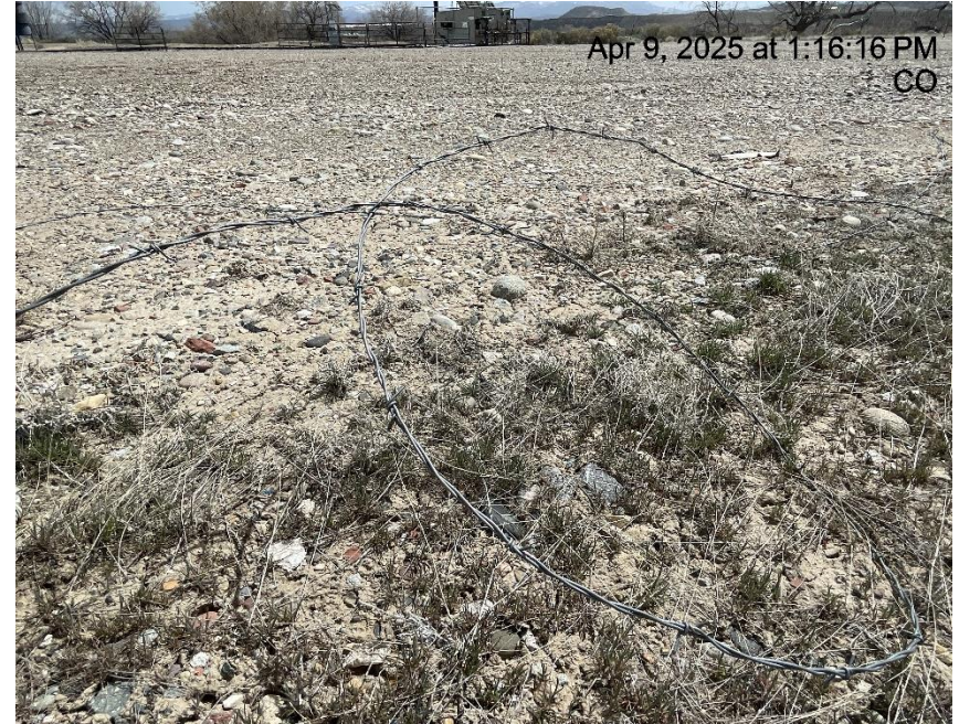
Photo # 9661 Barbed wire fence needs maintenance/wildlife hazard & trip hazard