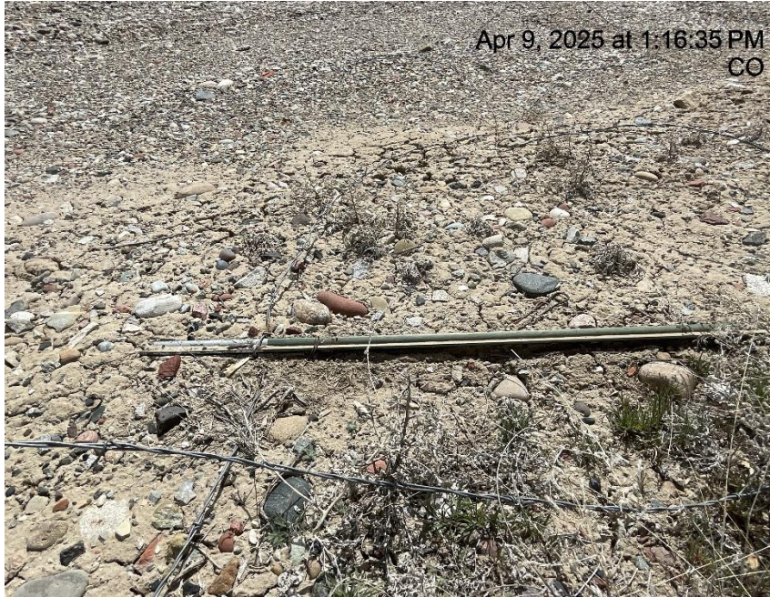
Photo # 9658 Barbed wire fence needs maintenance/wildlife hazard & trip hazard