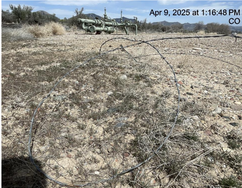
Photo # 9660 Barbed wire fence needs maintenance/wildlife hazard & trip hazard