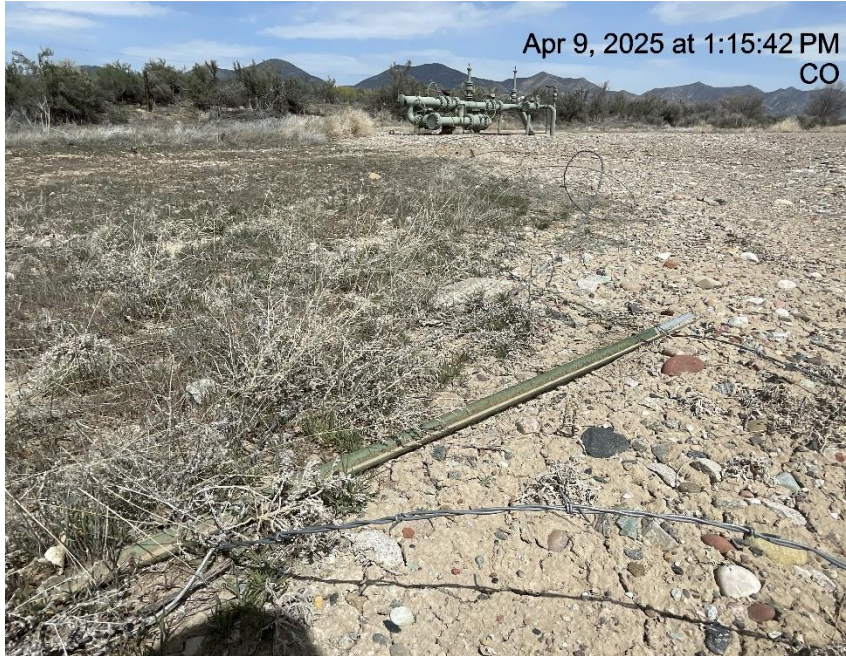
Photo # 9656 Barbed wire fence needs maintenance/wildlife hazard & trip hazard