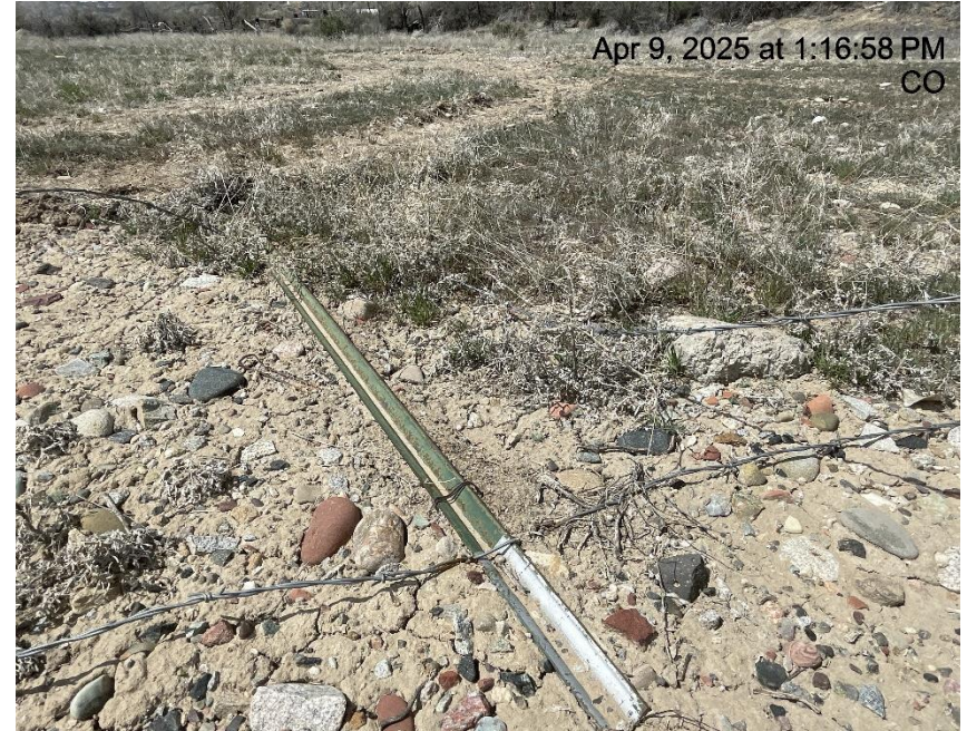
Photo # 9659 Barbed wire fence needs maintenance/wildlife hazard & trip hazard