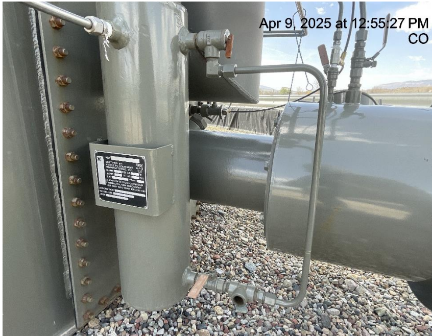
Photo # 9670 PRV vent line does not comply with CECMC pressure safety device rules or general safety rules