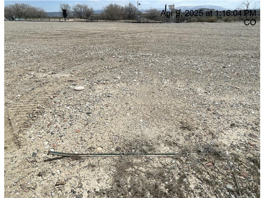
Photo # 9657 Barbed wire fence needs maintenance/wildlife hazard & trip hazard