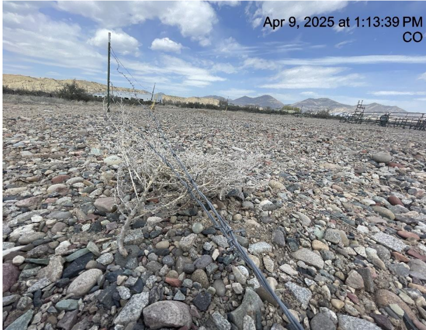
Photo # 9664 Barbed wire fence needs maintenance/wildlife hazard & trip hazard