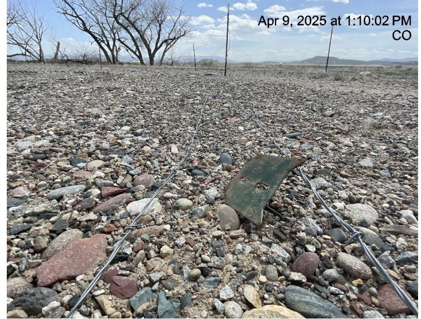
Photo # 9663 Barbed wire fence needs maintenance/wildlife hazard & trip hazard