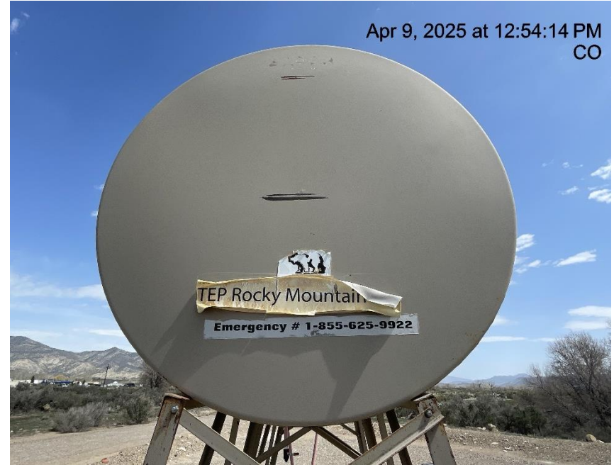
Photo # 9665 Operator emergency # on methanol tank disconnected & not in service (additionally labeling with operator name is peeling & starting to become illegible)