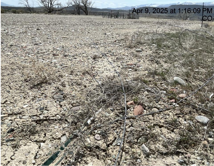
Photo # 9662 Barbed wire fence needs maintenance/wildlife hazard & trip hazard