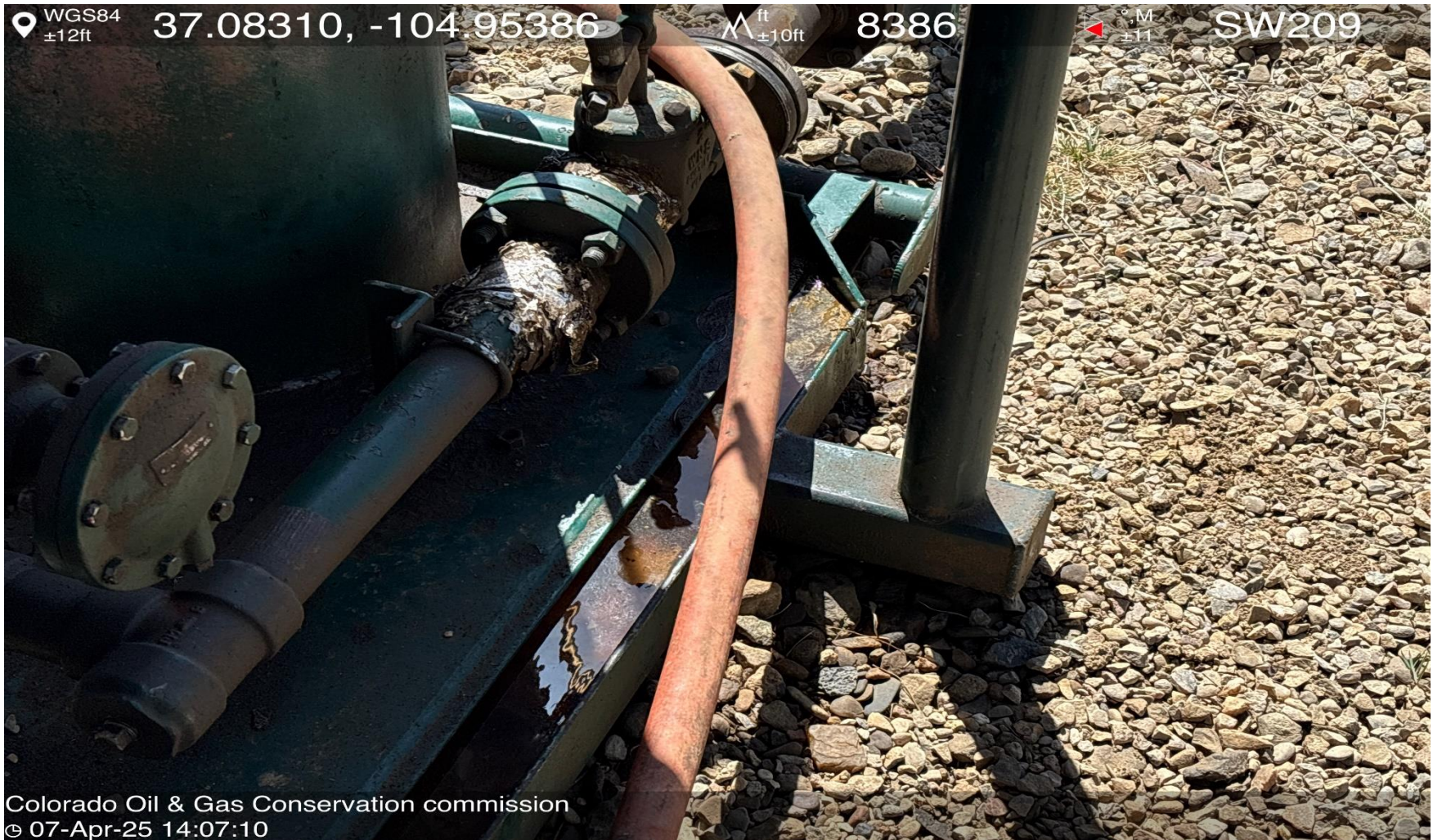
PHOTO 6: OILY WASTE IS COMPRESSOR SKID. DRAIN OILY WASTE REPAIR ALL LEAKS AND REMOVE OR TREAT IMPACTED SOIL PER RULE 1002..(2).D & 1002.f.(2)B, Comply with general provisions of the oil and gas act for wildlife protection AND SB-181. CA DATE 4/9/2025.