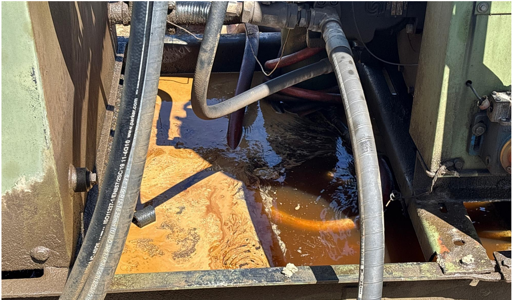
PHOTO 5: OILY WASTE IS PRIME MOVER ENGINE SKID. DRAIN OILY WASTE REPAIR ALL LEAKS AND REMOVE OR TREAT IMPACTED SOIL PER RULE 1002..(2).D & 1002.f.(2)B, Comply with general provisions of the oil and gas act for wildlife protection AND SB-181. CA DATE 4/9/2025.