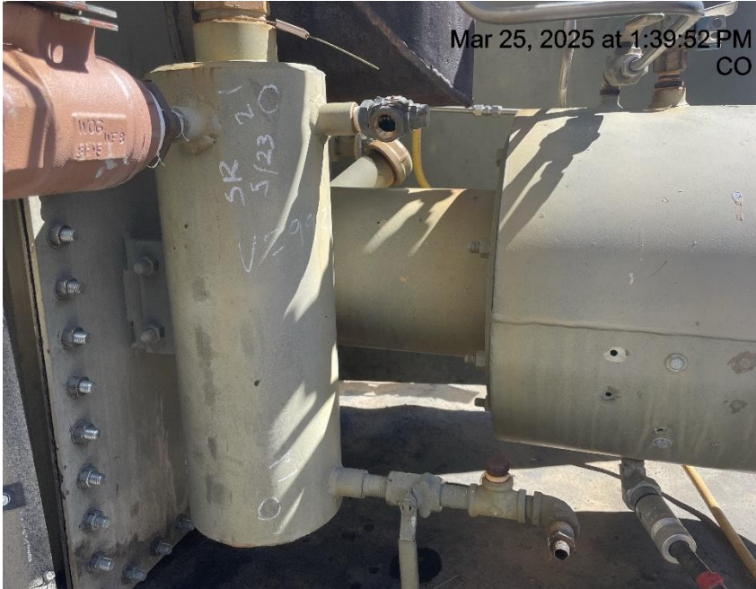
Photo # 7348 PRV vent line on tank burner does not comply with CECMC pressure safety device rules or general safety rules.