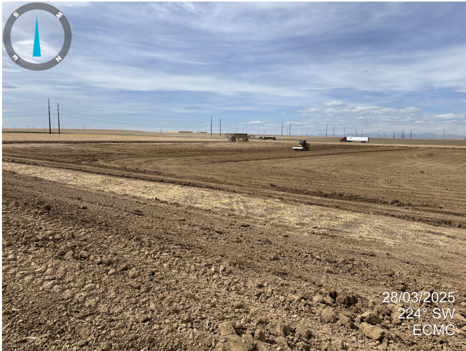
Photo 13. Looking southwest across location from the topsoil stockpile. At time of inspection it appears that topsoil had been salvaged from pad and the pad was being graded.