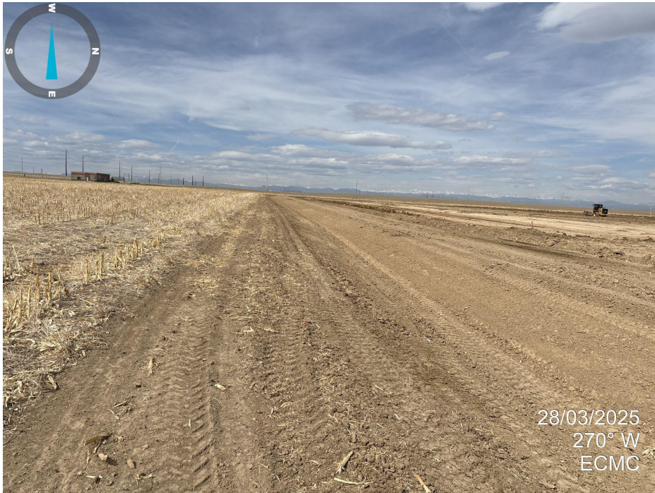
Photo 15. Looking west down south side perimeter ditch.