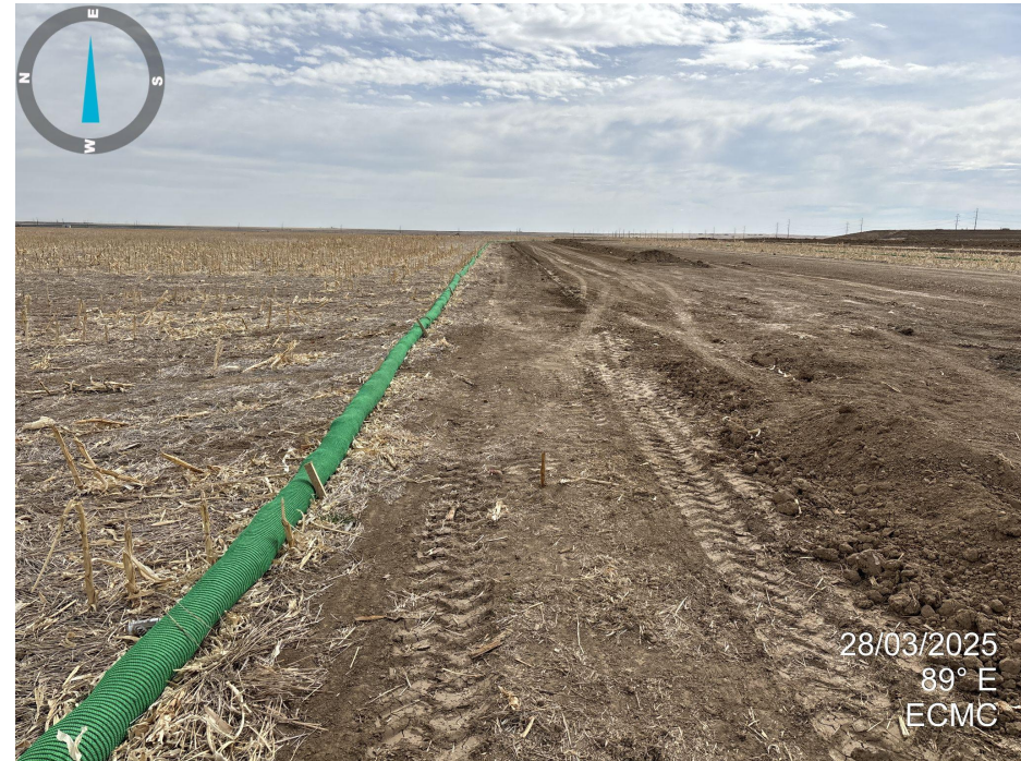
Photo 6. Filtrex installed on both sides of access road and around portion of the outer limits of disturbance of location. Access road appears to be graded with a ditch present on the southern side.