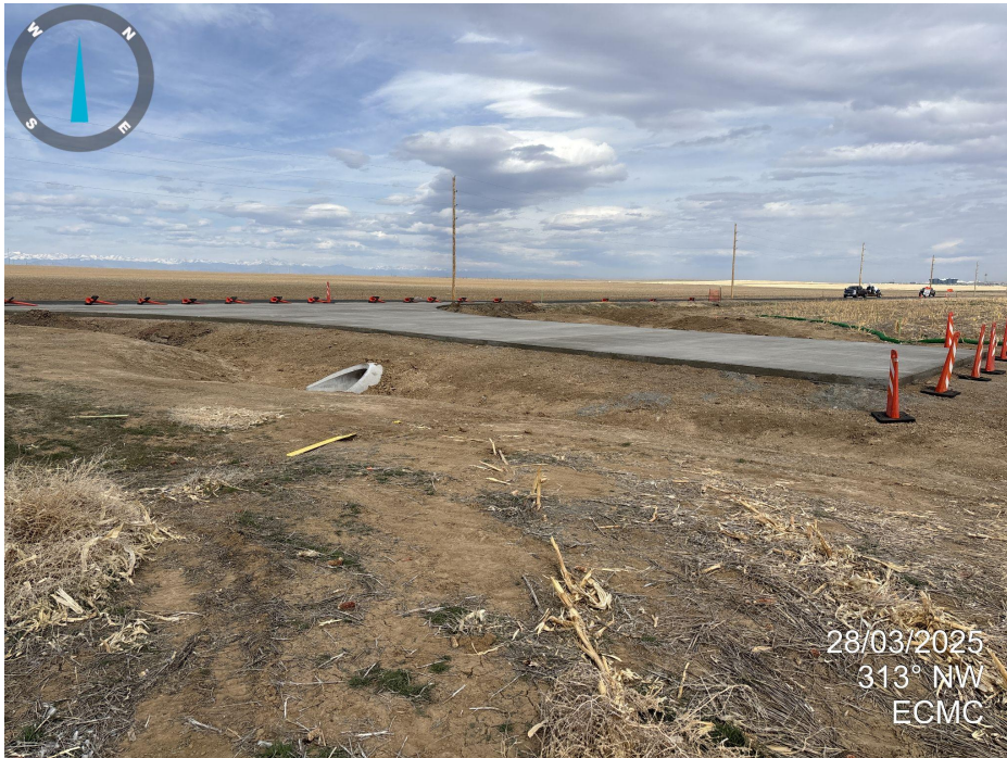
Photo 1. Concrete apron and culvert installed at access road entrance. Cones are in place at time of inspection blocking road.