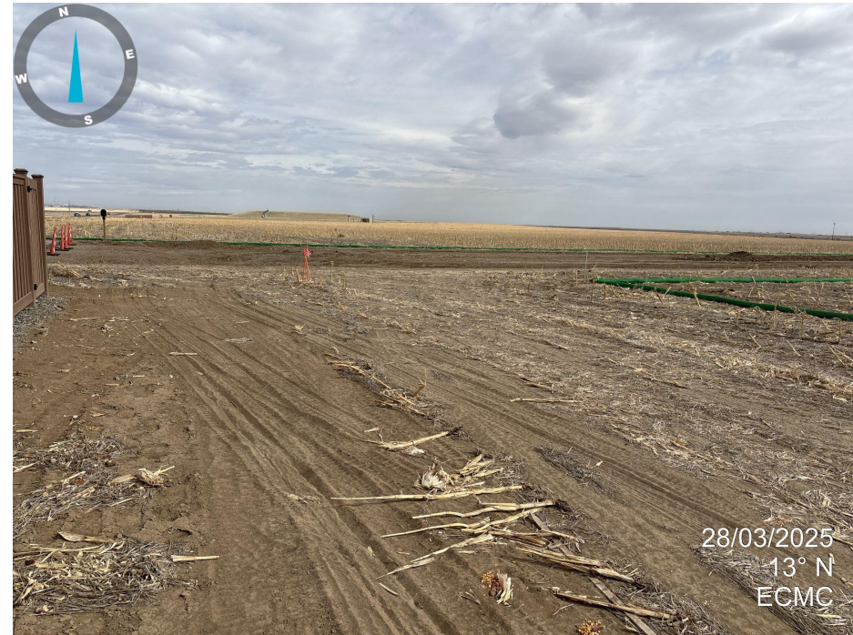
Photo 4. Looking north down southern unapproved access road. See photo 3 comments. Reference photo 19.