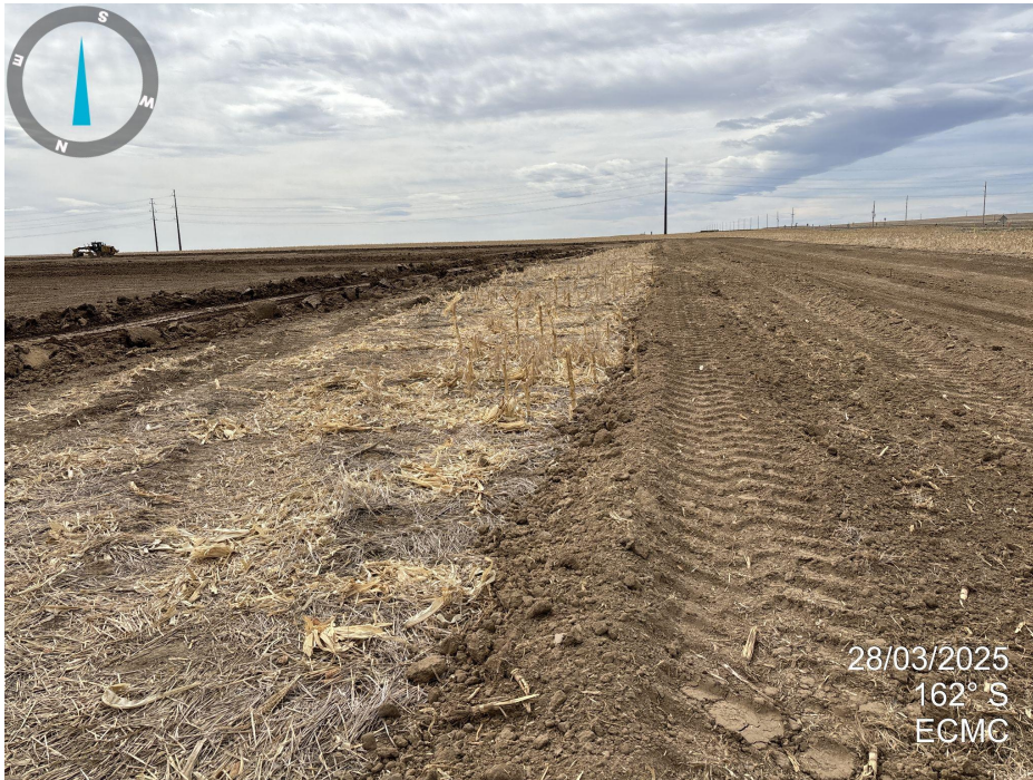
Photo 17. Looking south down the west side of location. Perimeter ditch has been constructed. Topsoil remains in the area between the perimeter ditch and pad edge.