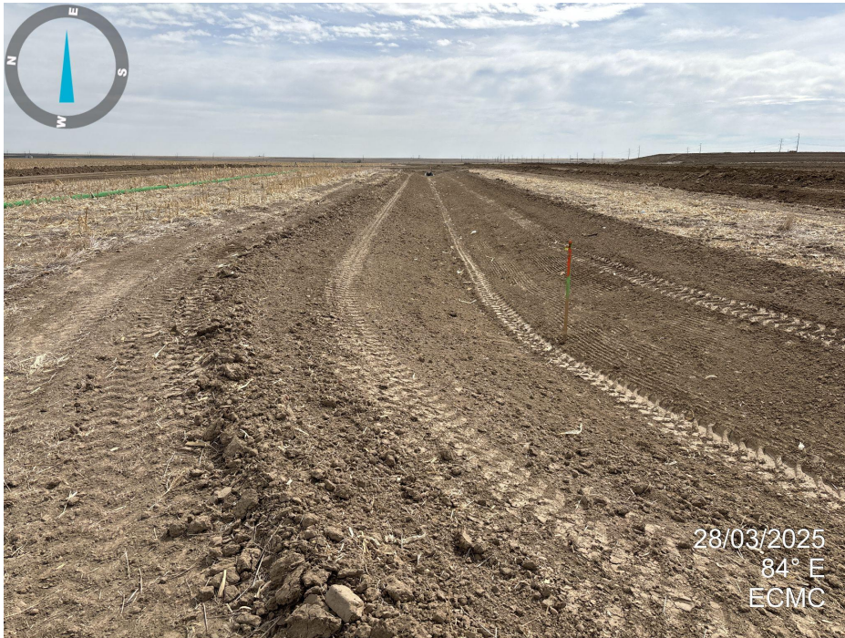
Photo 7. Looking east down the northern pad perimeter ditch. Ditch appears to have been compacted and tracked.