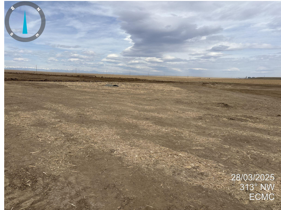
Photo 12. Picture taken in the northeast corner looking northwest near the retention basin. Topsoil does not appear to have been salvaged in this area and it appears that there is vehicle traffic in this area. Reference photo 19.