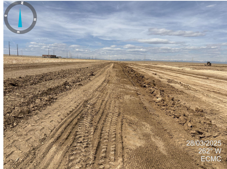
Photo 16. Looking west down the area between perimeter ditch and pad. It appears approximately 11 inches of topsoil was salvaged.