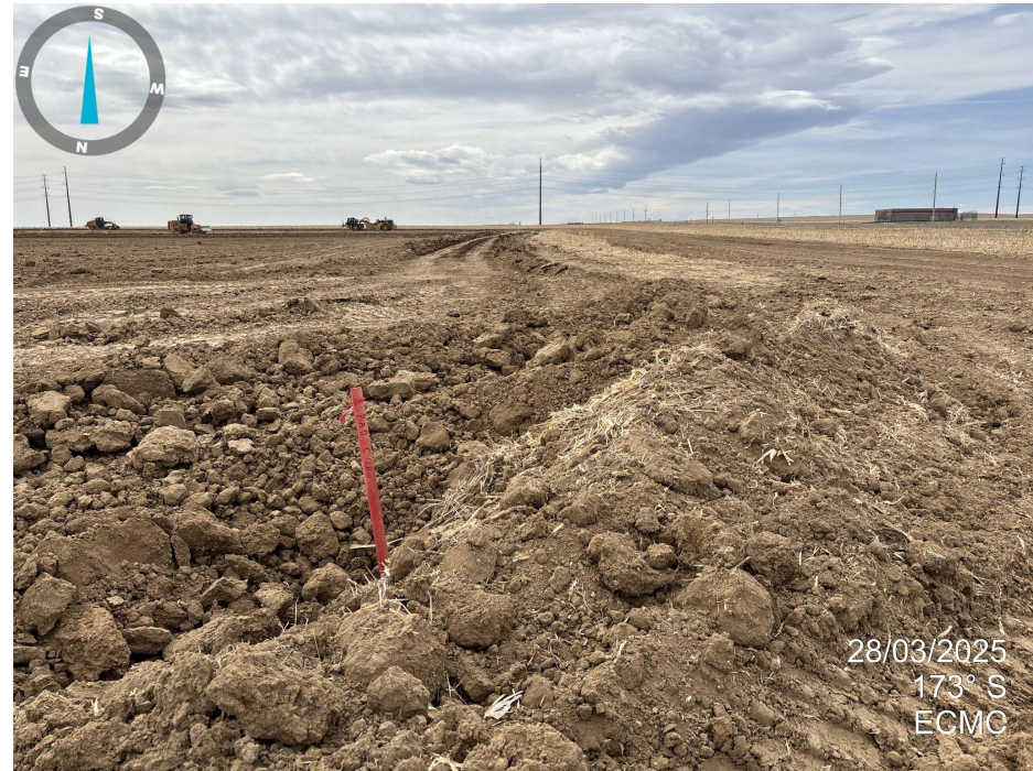
Photo 18. Looking south along the west side of pad.