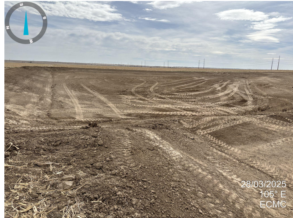
Photo 8. Retention pond located in the northeast corner.