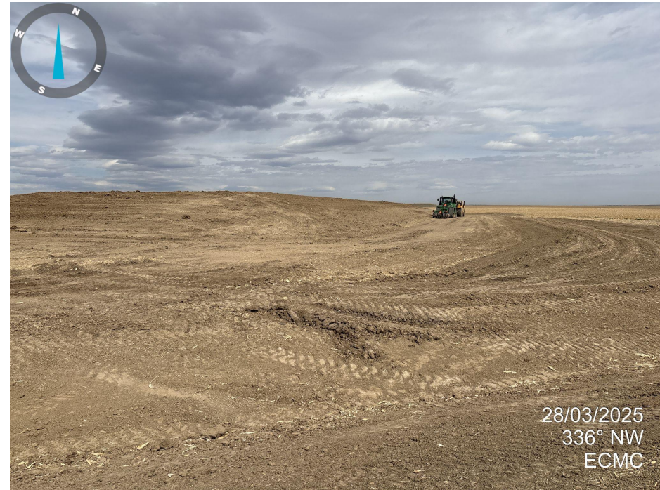
Photo 14. Looking north down east side of location. Illustrating topsoil stockpile.