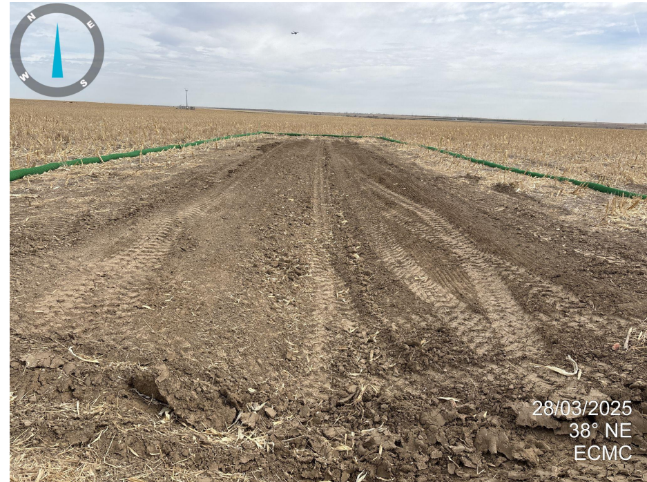
Photo 10. Looking northeast away from location. Perimeter ditch/ outflow.