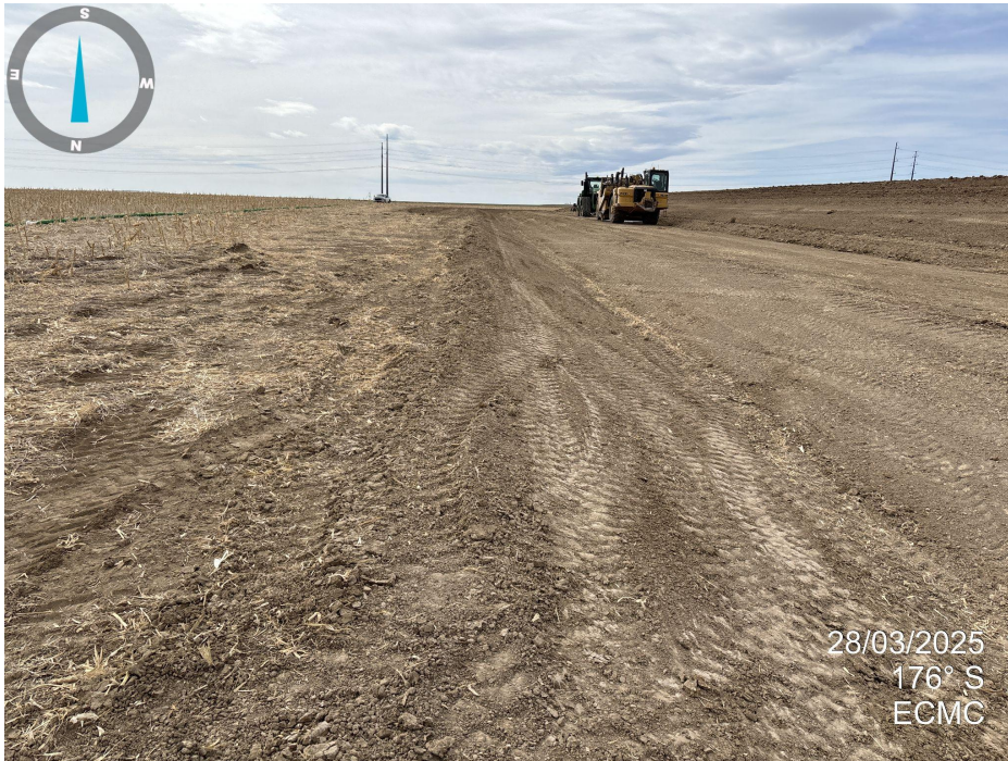
Photo 11. Looking south along the east side of location. The ditch is along the perimeter of disturbance area to the east of the topsoil stockpile. The area between the ditch and topsoil stockpile does not indicate topsoil was salvaged in the topsoil plan. Reference photo 19.