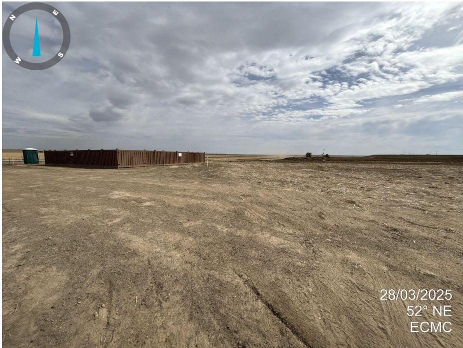
Photo 3. Looking north east from secondary entrance. Topsoil was not salvaged in this area. It appears vehicles have been driving/ parking on the topsoil in this area. Reference photo 19.