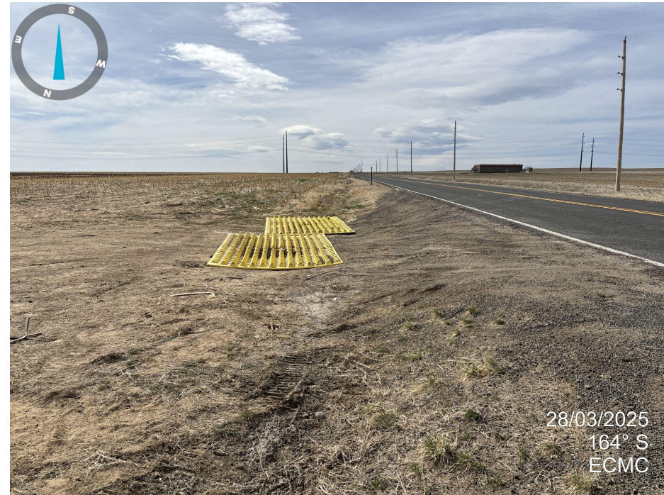
Photo 2. Secondary entrance located south of approved access road. Vehicle tracking BMP present. Reference photo 19.