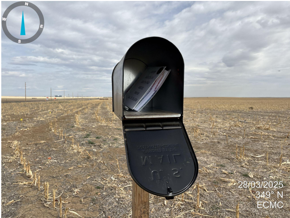
Photo 5. Form 2A is present on location.