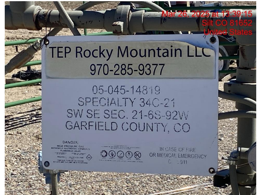
Illegible Wellhead Sign – Photo #07696