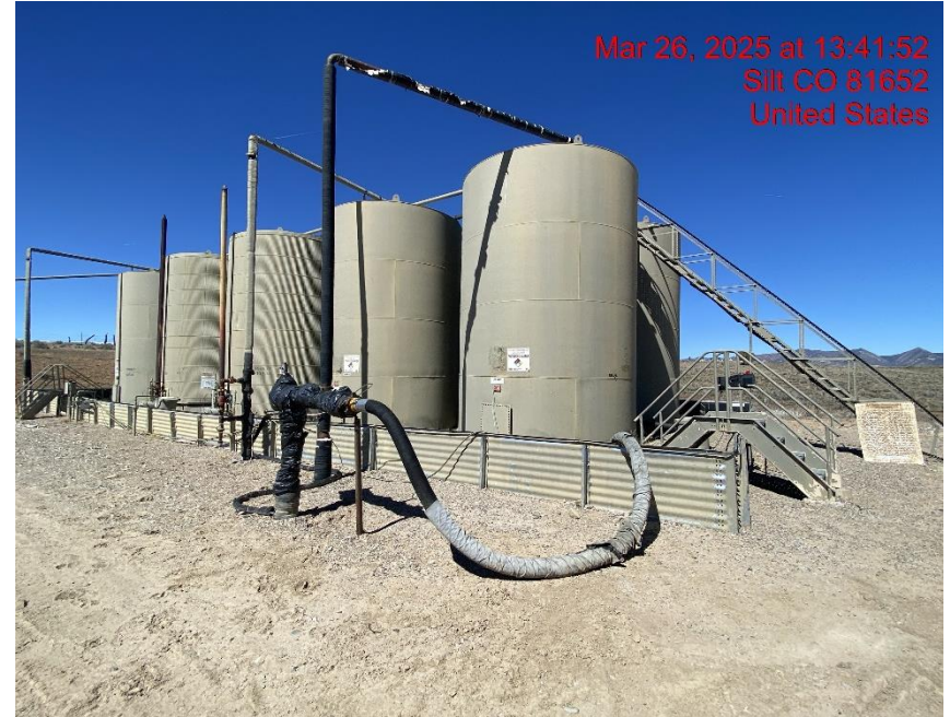
Location – Photo #07701