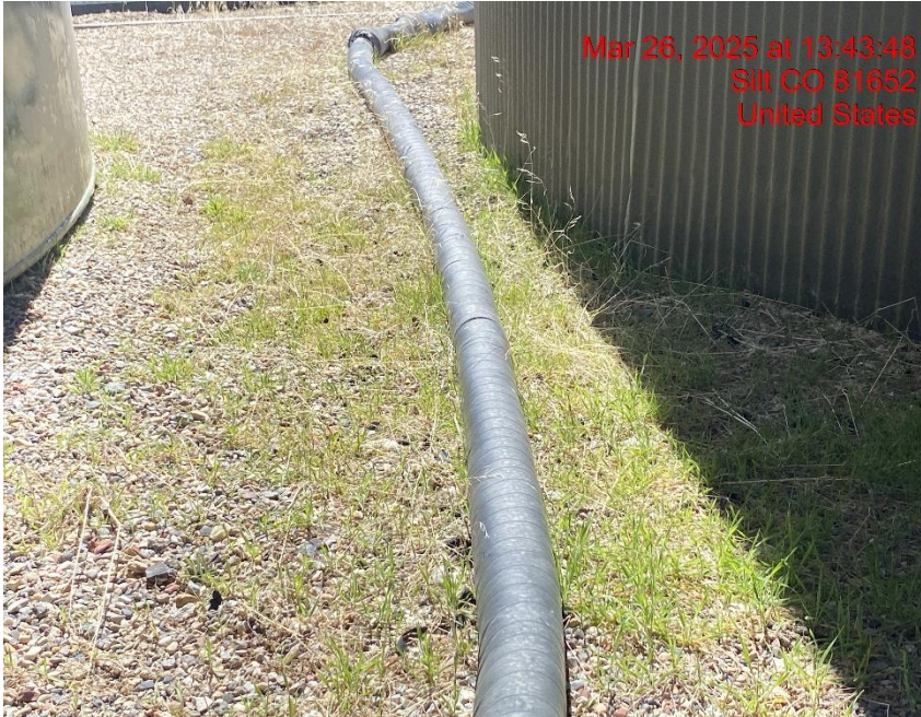
Weeds – Photo #07713