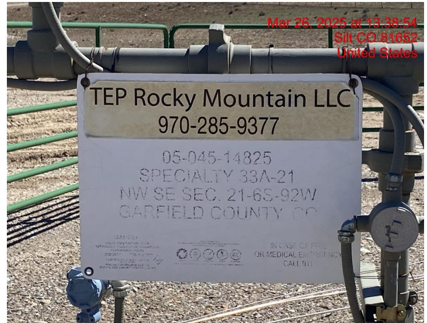
Illegible Wellhead Sign – Photo #07694