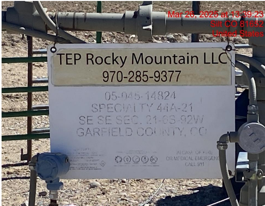
Illegible Wellhead Sign – Photo #07697