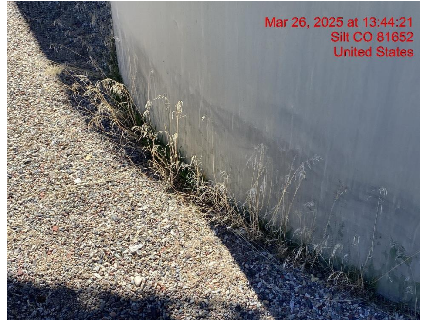
Weeds – Photo #07714