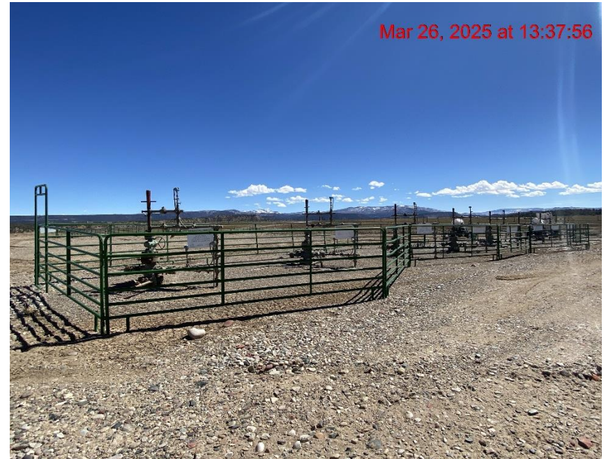
Location – Photo #07694