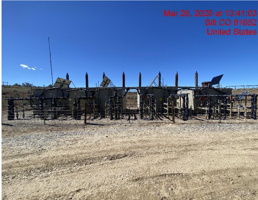
Location – Photo #07699