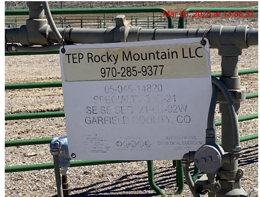
Illegible Wellhead Sign – Photo #07692