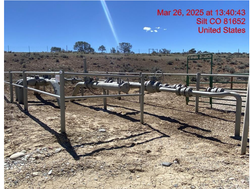
Location – Photo #07698