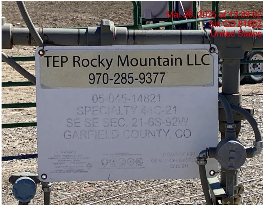
Illegible Wellhead Sign – Photo #07695