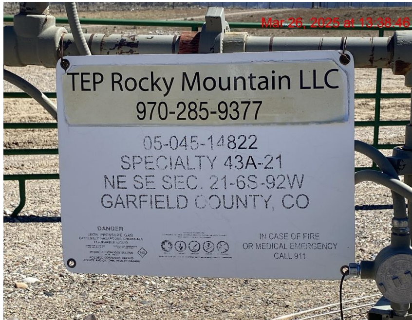
Illegible Wellhead Sign – Photo #07693