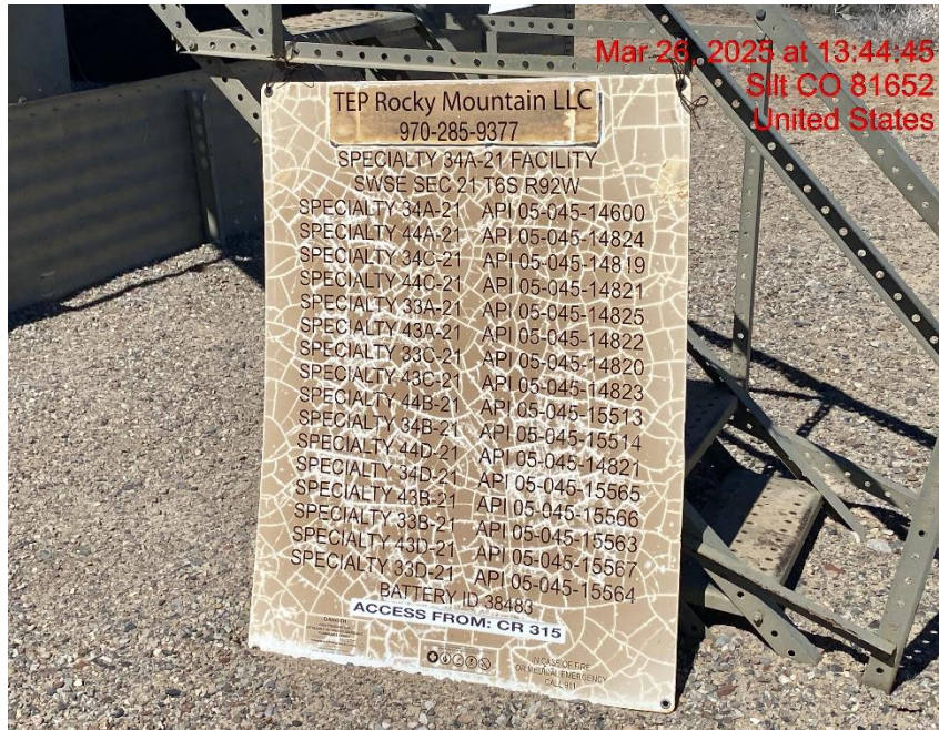
Illegible Battery Sign – Photo #07715