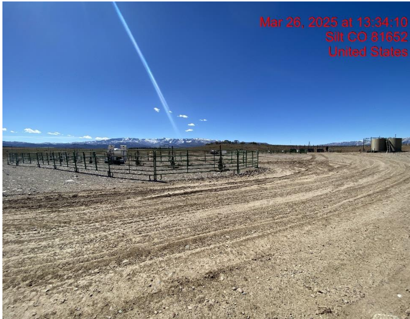
Location Overview – Photo #07684