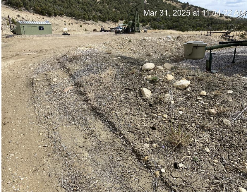
Location from West entrance