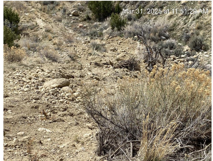
Tank berm washed out?