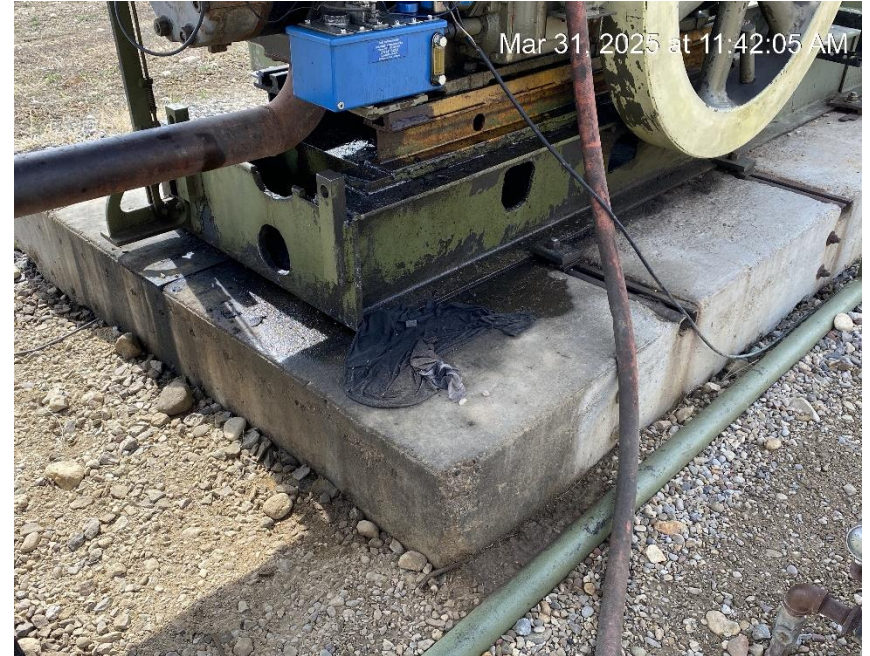
Oily waste and staining