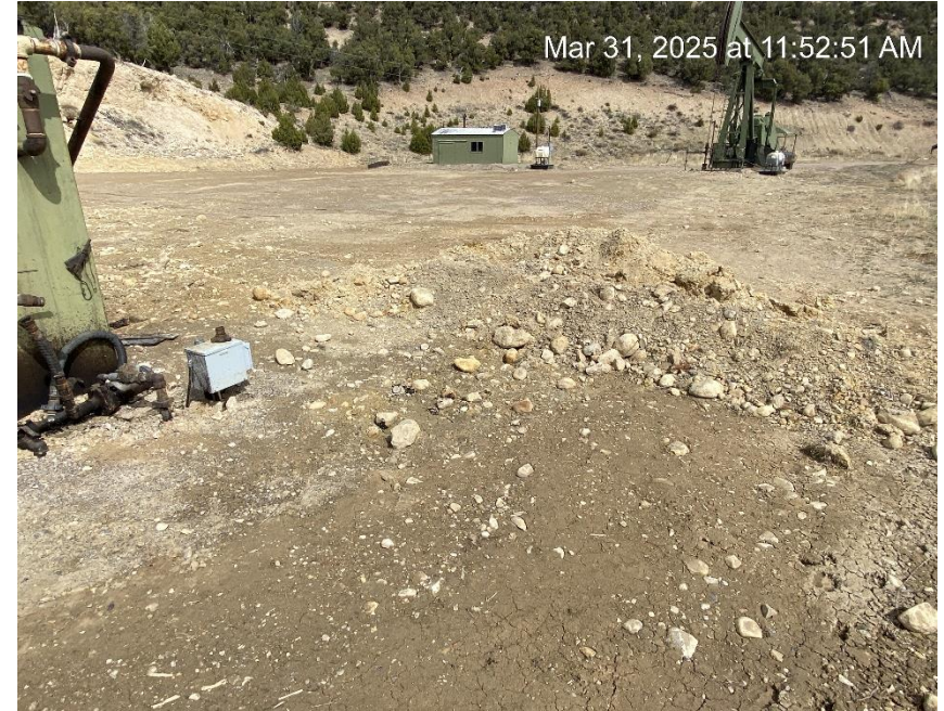
Location from South corner