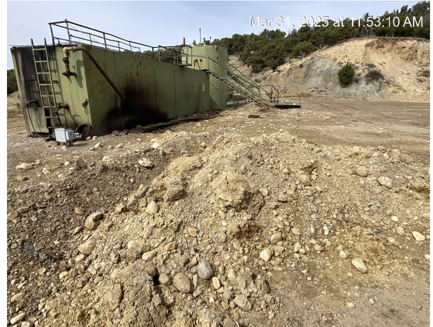
Incomplete tank berm