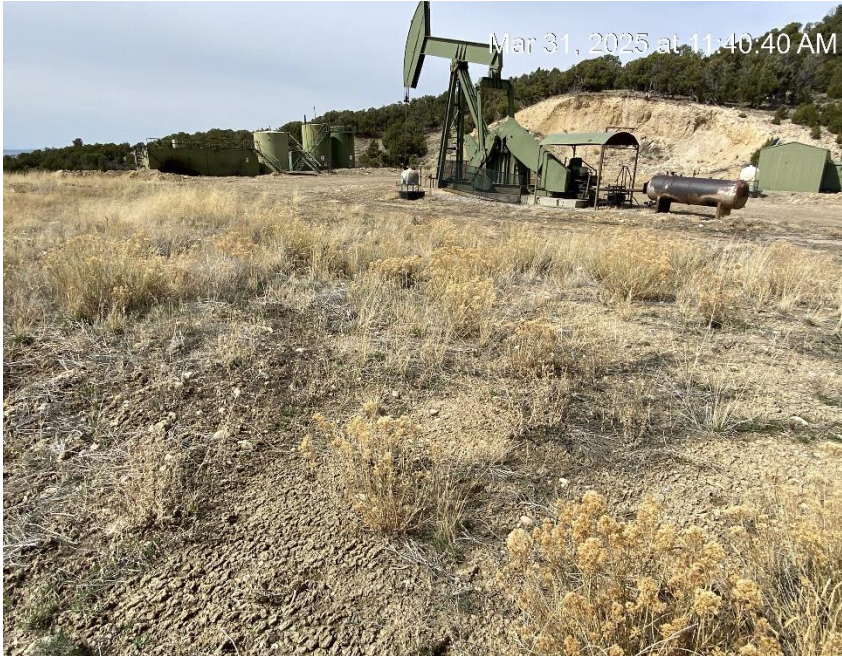
Location from East corner