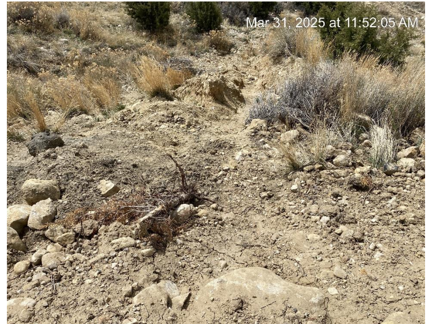
Evidence of tank berm failure?