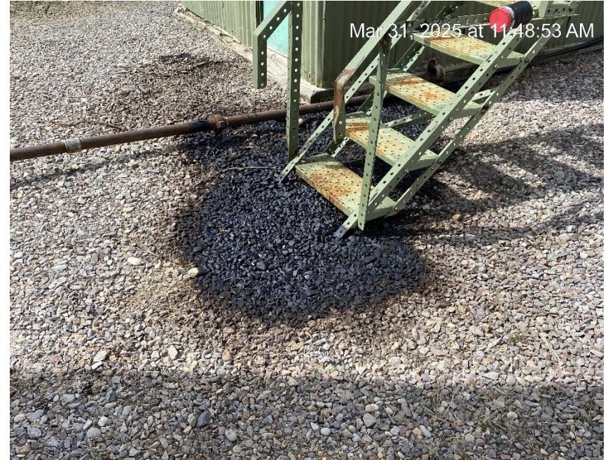
Oily waste and staining