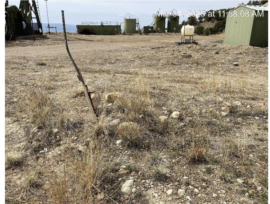
Location from North corner