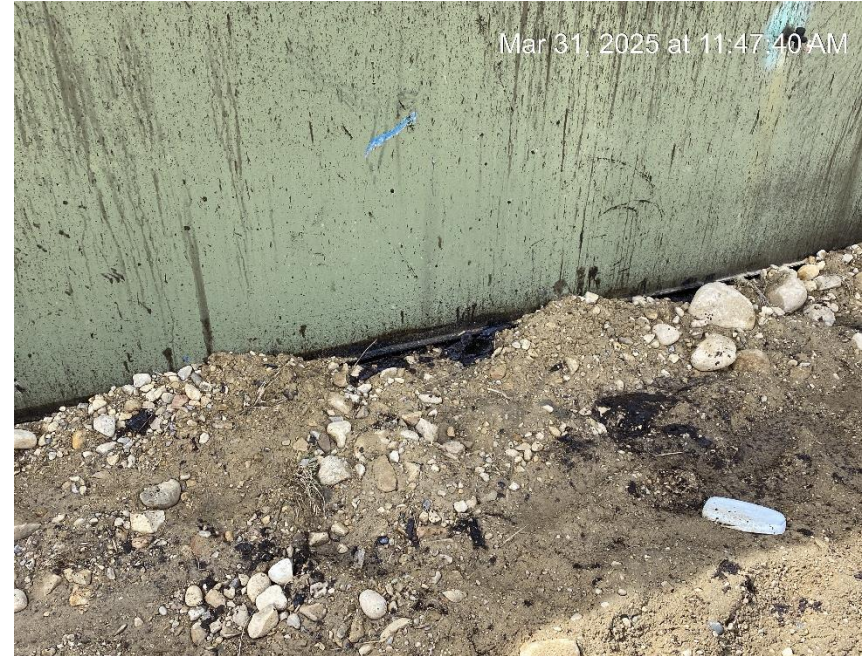
Oily waste and stained soil