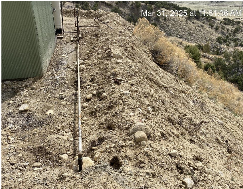
Rebuilt tank berm