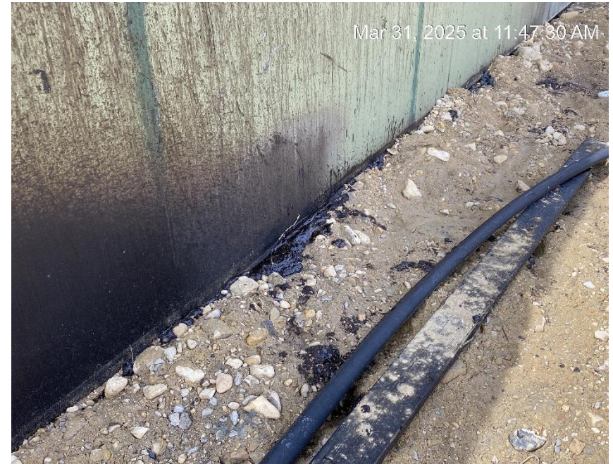
Oily waste and stained soil