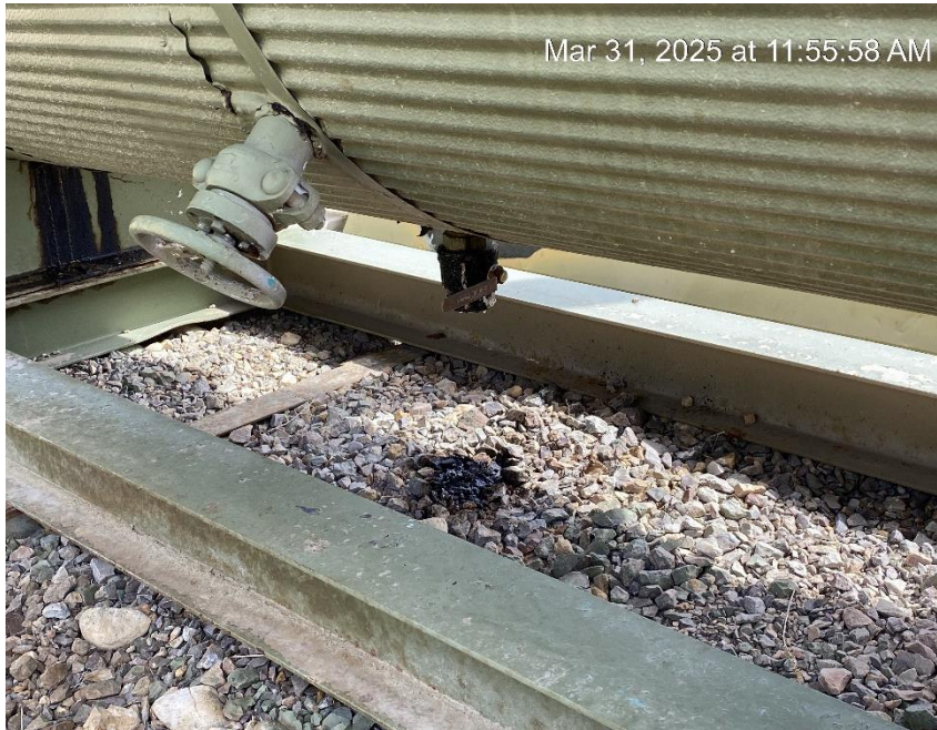
Leaking valve. No secondary plug.