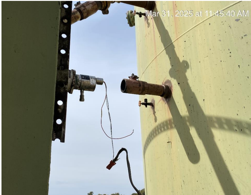
Open end tank valve