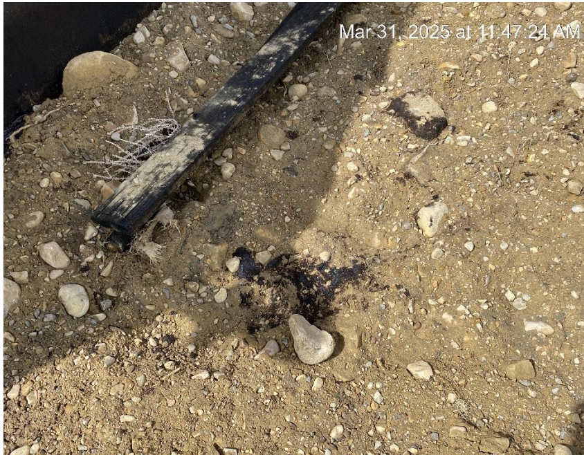
Oily waste and stained soil