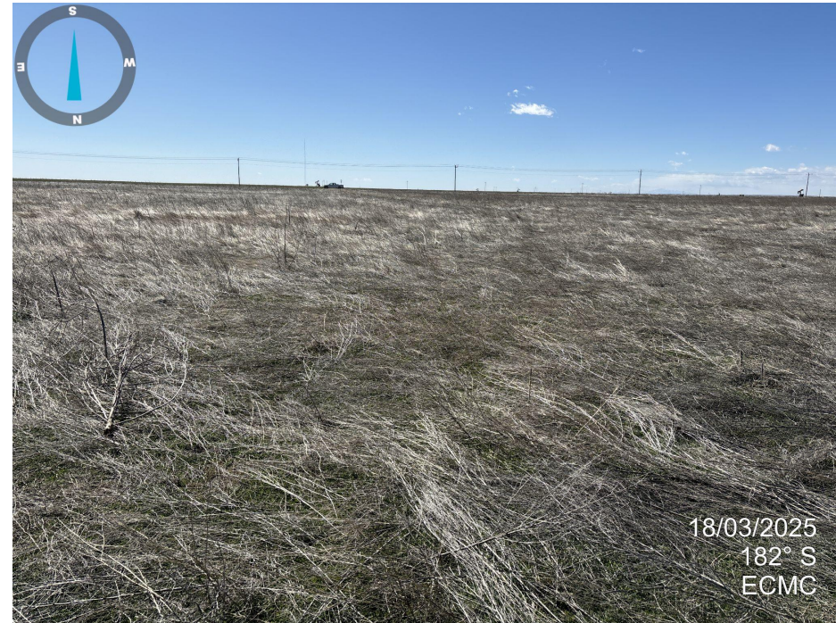
Photo 6. Looking south from wellbore. See photo 2 comments.