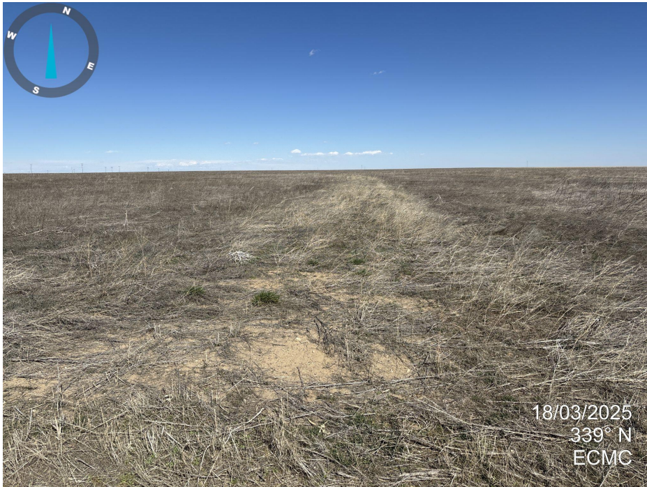
Photo 1. Looking north down former access road. A small area of lower vegetation coverage is present the majority of access road appears to be progressing towards 80% coverage of reference areas.