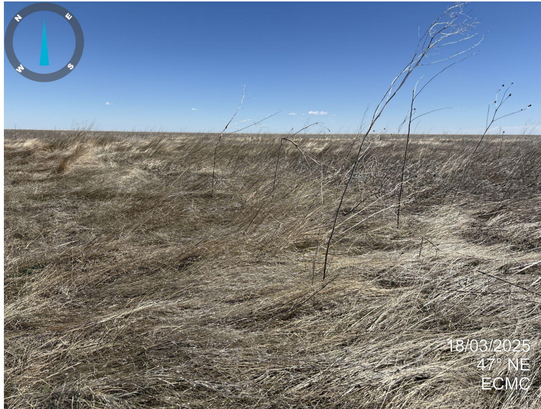
Photo 7. Reference vegetation to the north of well location.