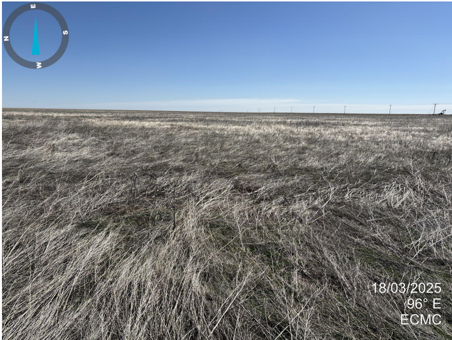
Photo 5. Looking east from wellbore. See photo 2 comments.