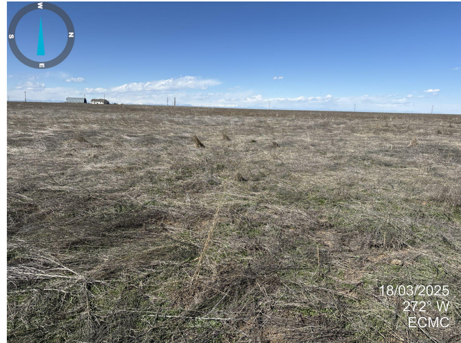
Photo 4. Looking west from wellbore. See photo 2 comments.