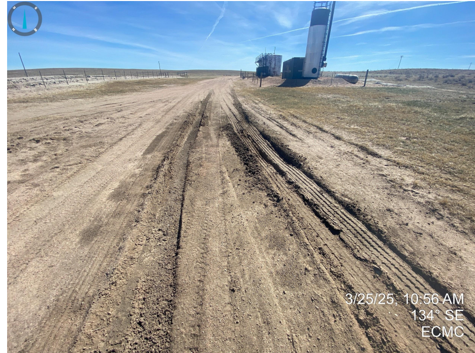
Photos 2 & 3. Rutting and site degradation observed along portions of the access road.