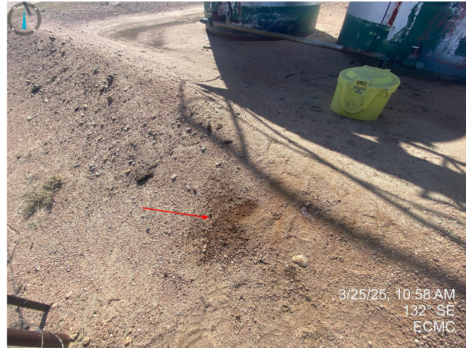
Photos 6 & 7. Stained soil observed near the tank battery.