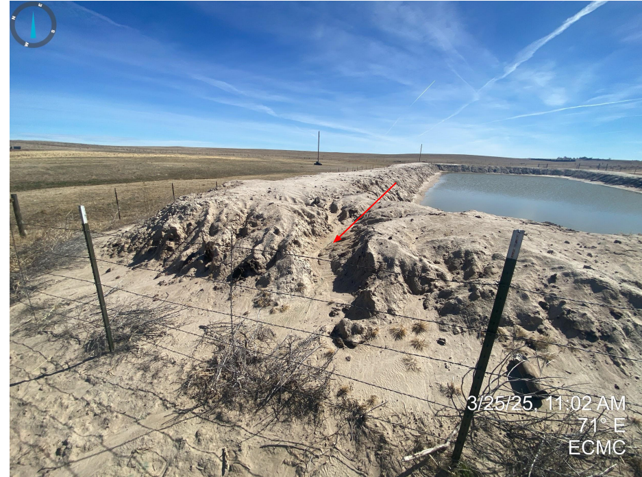
Photos 12 & 13. Erosion degradation and sediment transport observed on the western portion of the produced water pit.