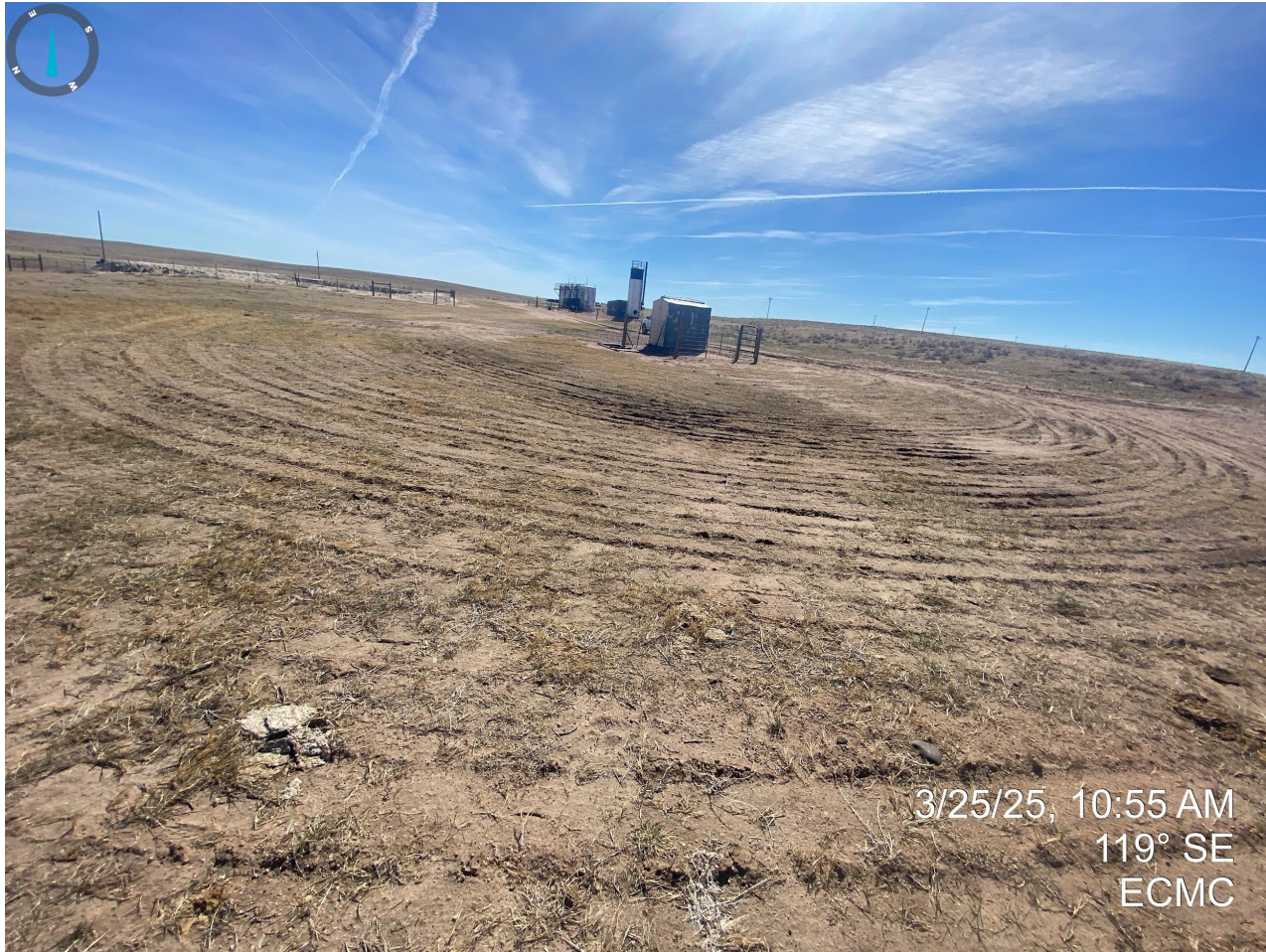
Photo 1. Vehicle traffic appears to be occurring outside of the established access roads/production areas with rutting and site degradation evident.