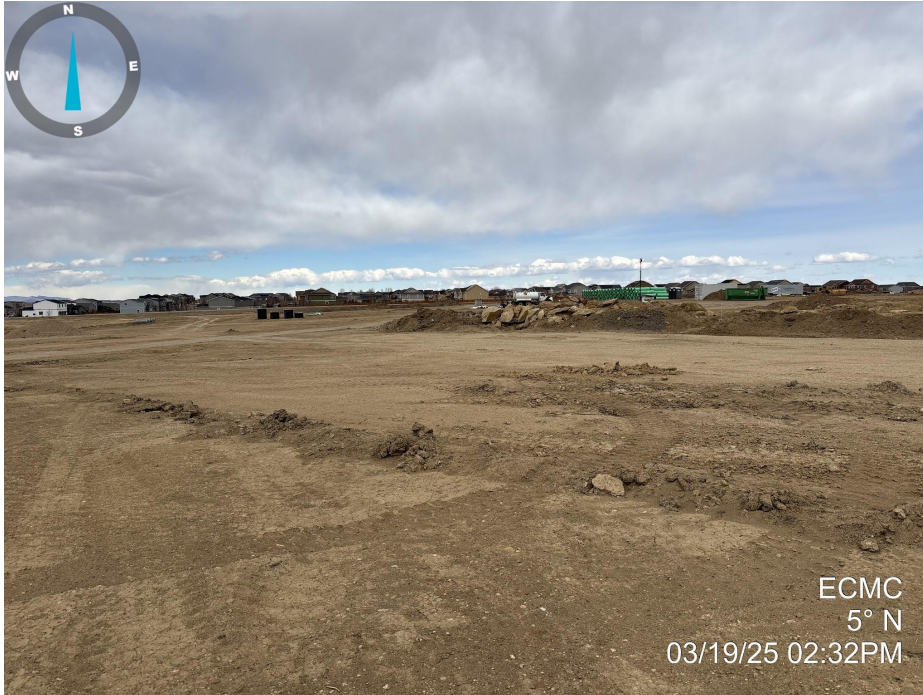
Photo 3. Photo taken from the well location, facing North. Photo illustrates that the well location is contained within a land use change from cropland to a residential development.