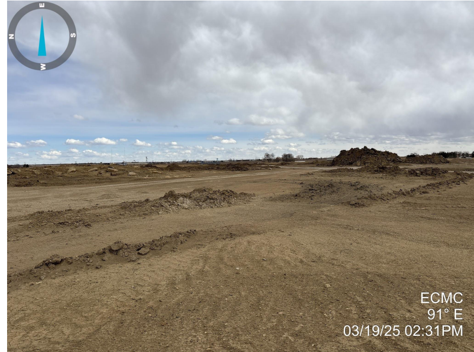
Photo 4. Photo taken from the well location, facing East. See comments under Photo 3.