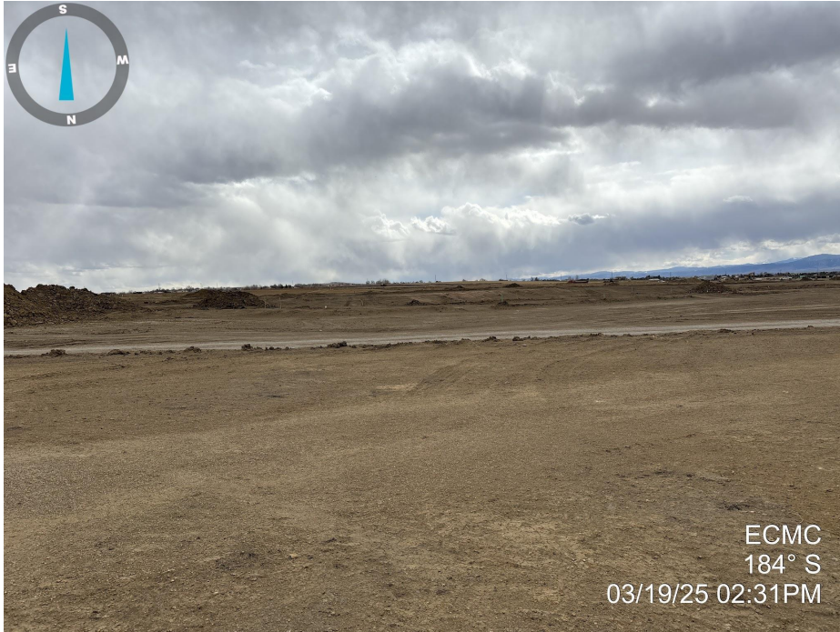
Photo 5. Photo taken from the well location, facing South. See comments under Photo 3.