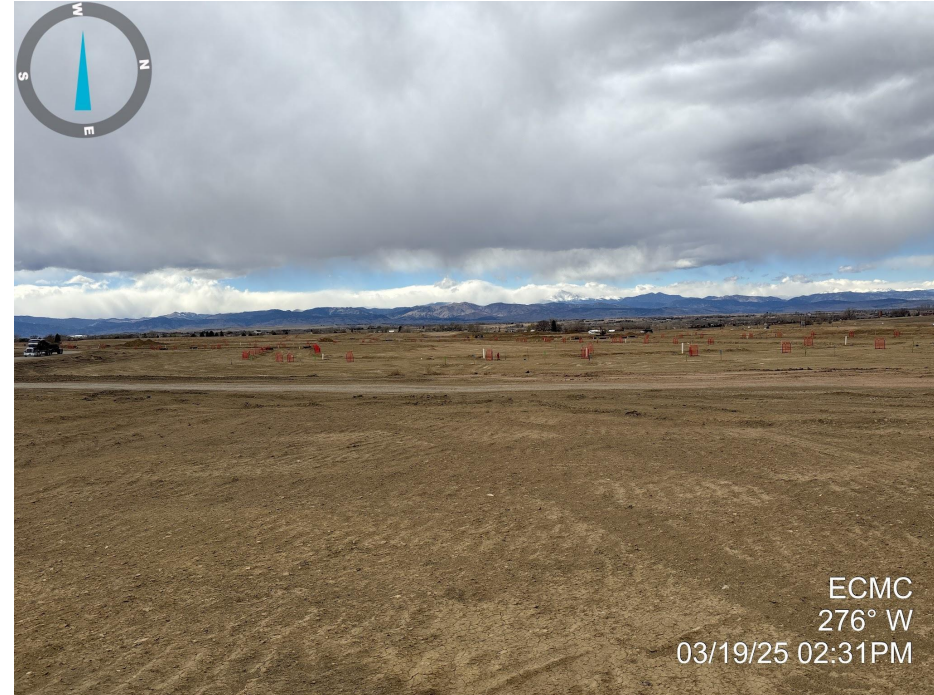
Photo 6. Photo taken from the well location, facing West. See comments under Photo 3.