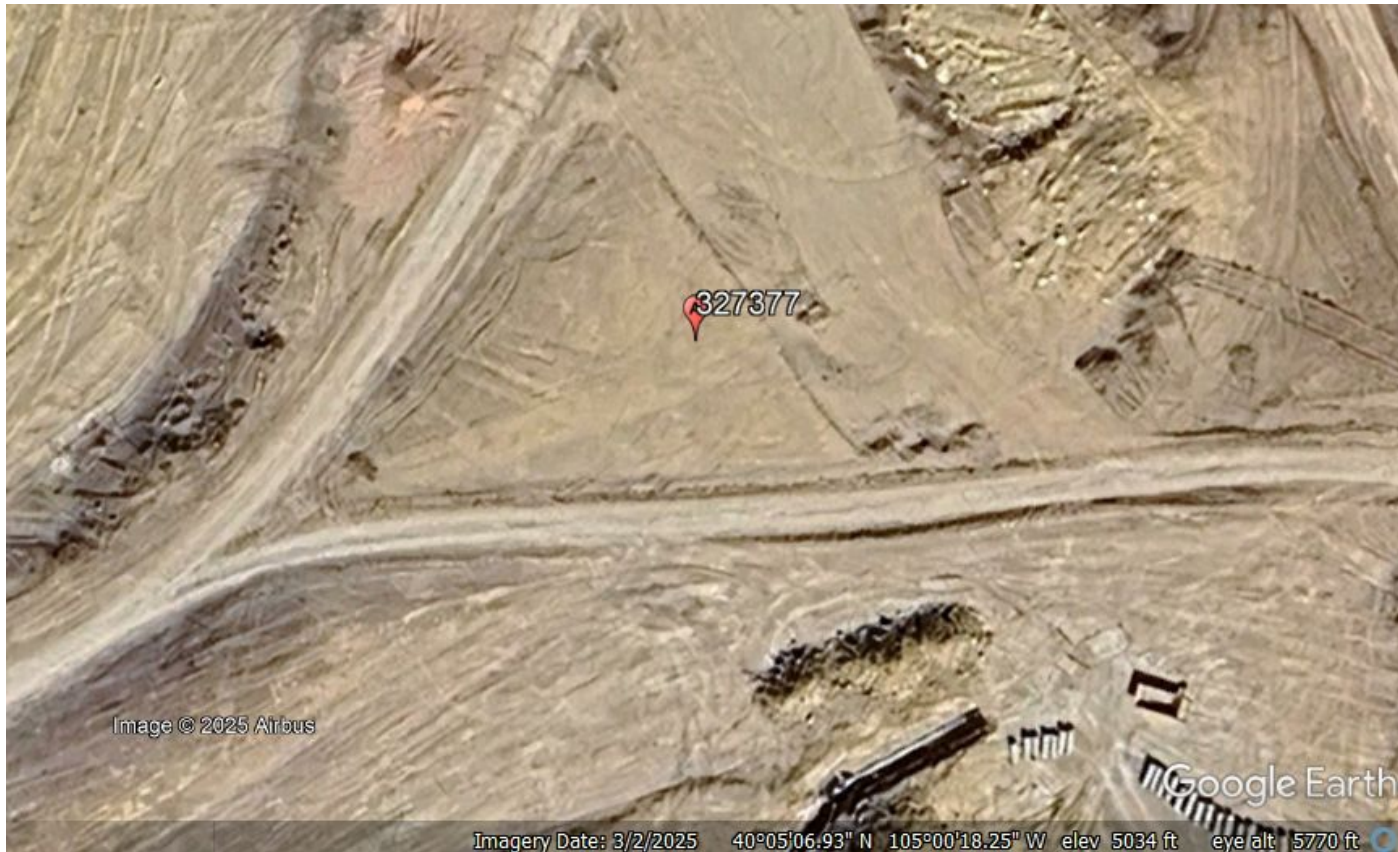
Photo 2. Google Earth aerial imagery from March 2, 2025. Photo illustrates the well location, access road, and associated tank battery after plugging operations. This imagery illustrates that the location is contained within a land use change.