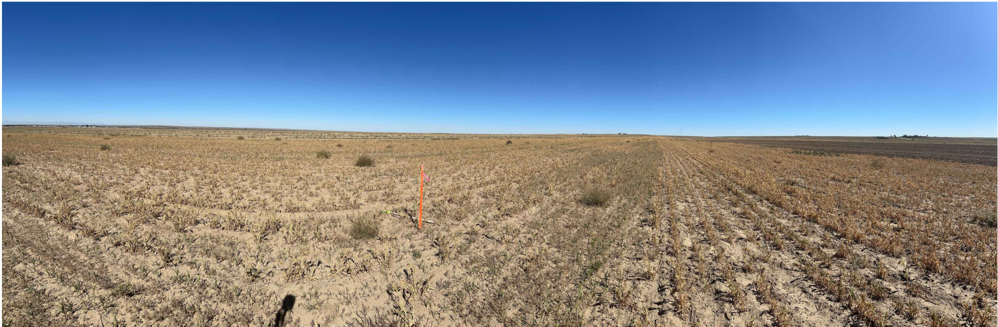
PANORAMIC VIEW NORTH

\\ags\projects\BOI_C_B240005\PRODIGDP-WOGLA\Cloudbreak_Pad_LocationPhotos.dwg