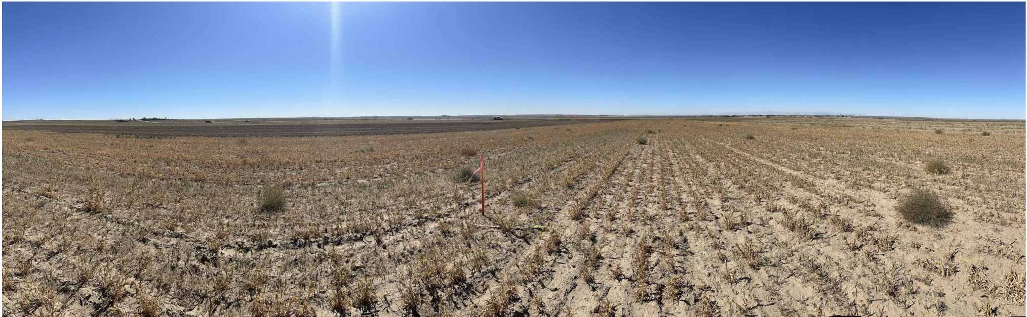
PANORAMIC VIEW SOUTH