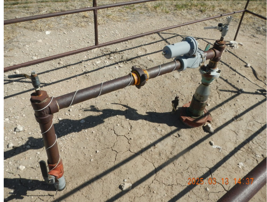
2. View of wellhead.