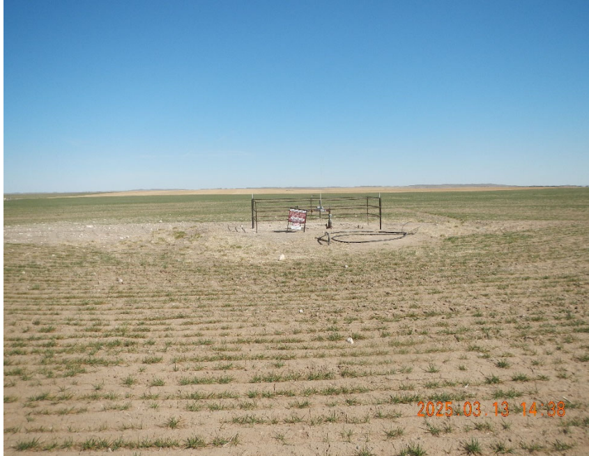
3. Well location overview.