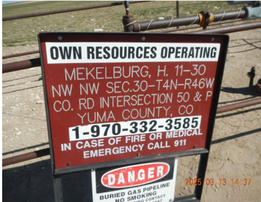
1. Lease sign at well location.