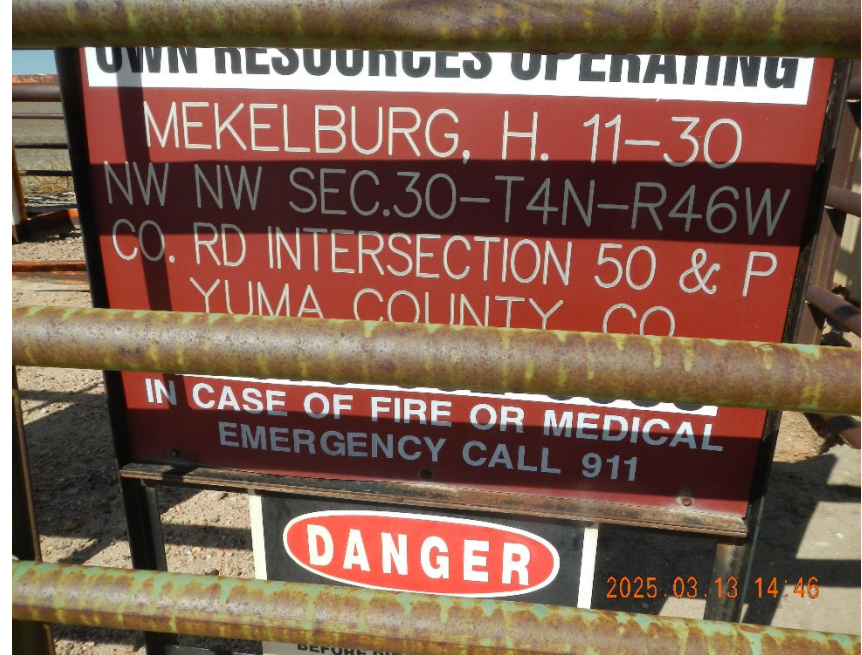
4. Lease sign at gathering location.