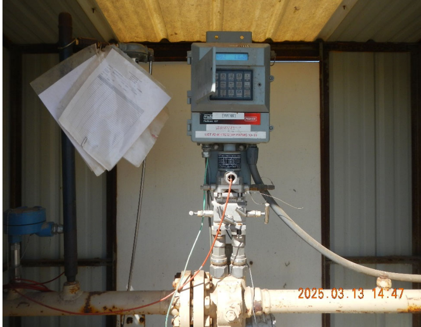
5. Gas meter inside meter shed.