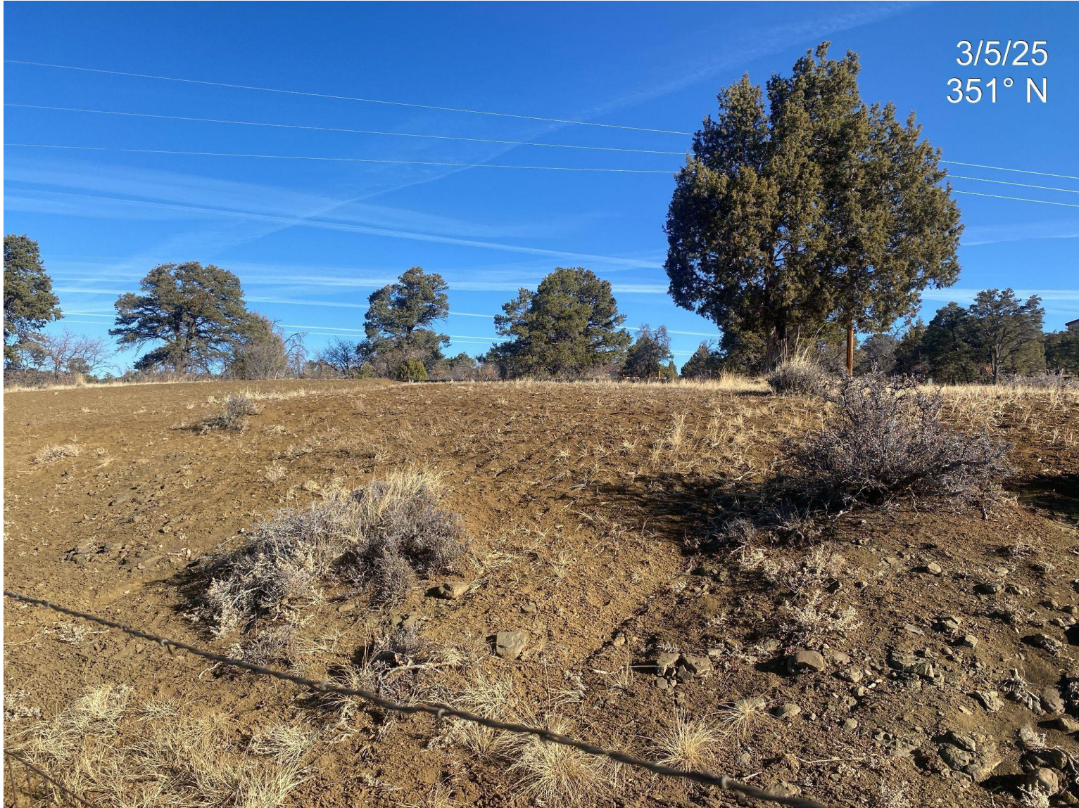
Photo 4. Vegetation is progressing in northern cut/interim reclamation area.

Inspection Photos Location Name: Hurt 1-4 Location ID: 325522