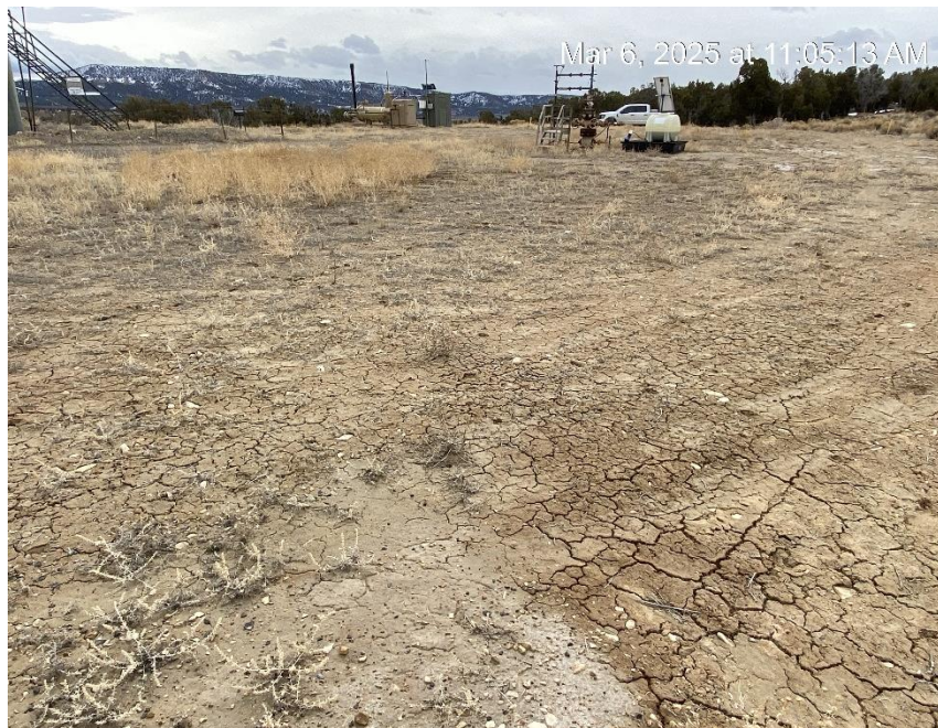
Location from West corner