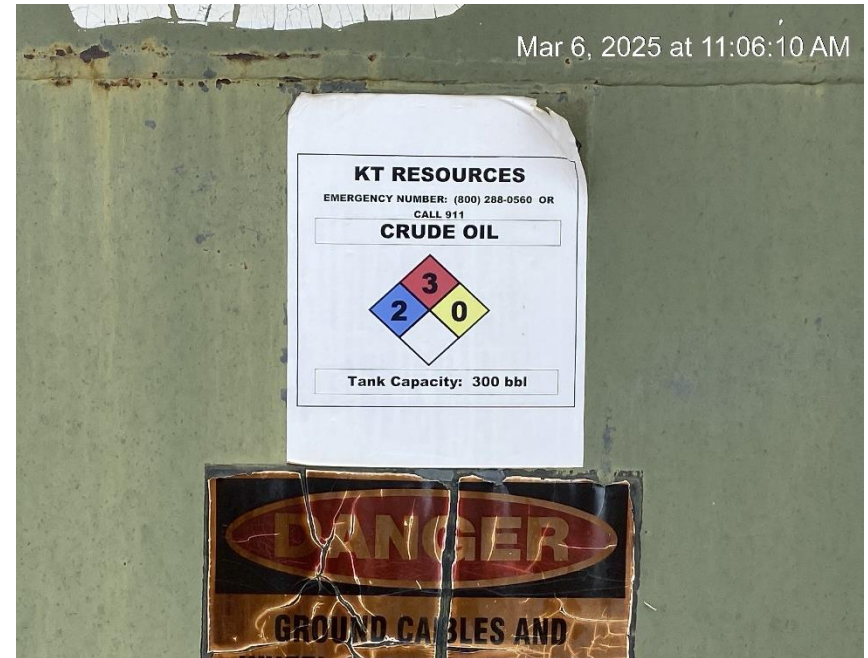
Peeling tank label