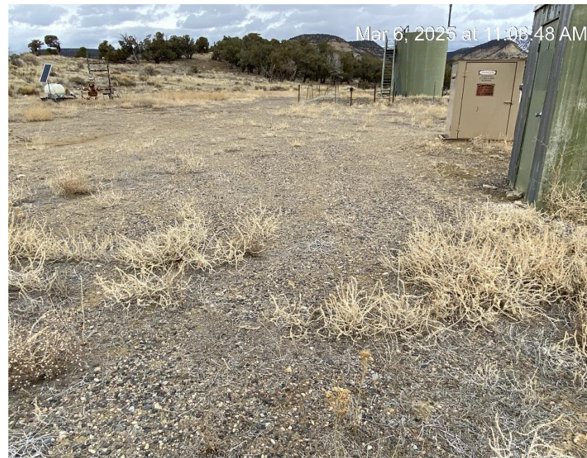
Location from East corner