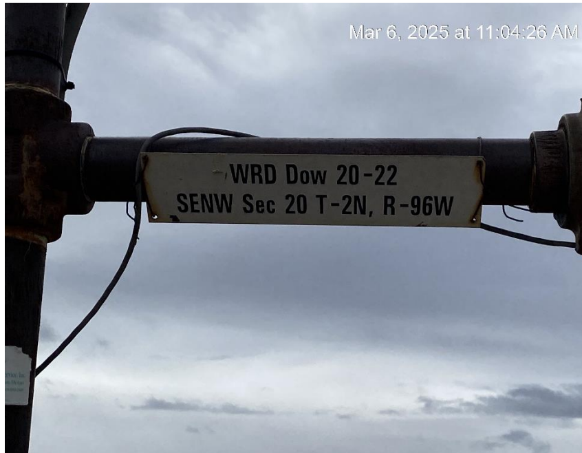
Missing required information