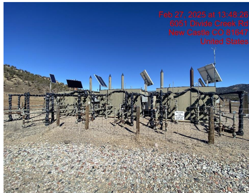
Location – Photo #06944