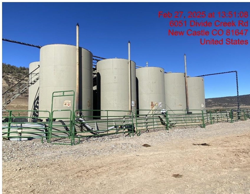
Location – Photo #06949