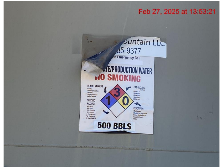
Tank Label Peeling Off – Photo #06956