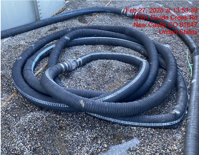
Stored Supplies – Photo #06959