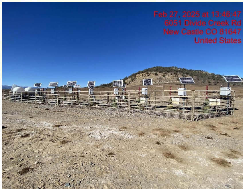
Location – Photo #06942