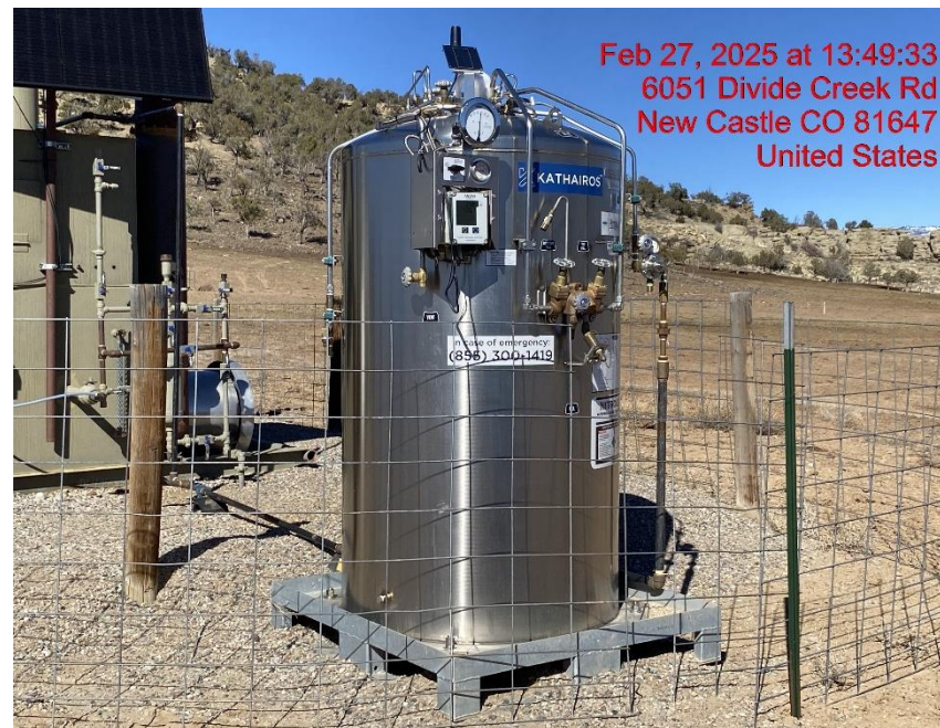
Location – Photo #06946