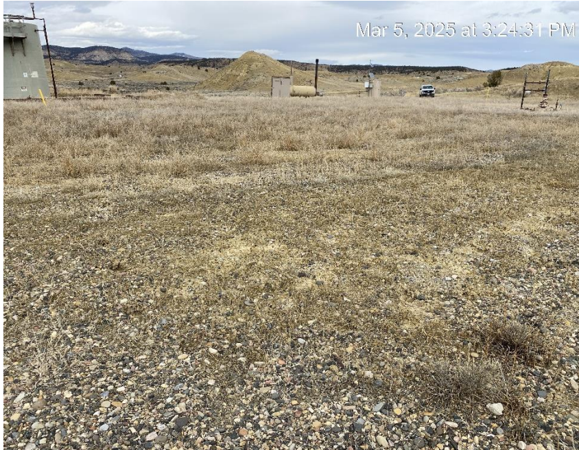
Location from the Southwest corner