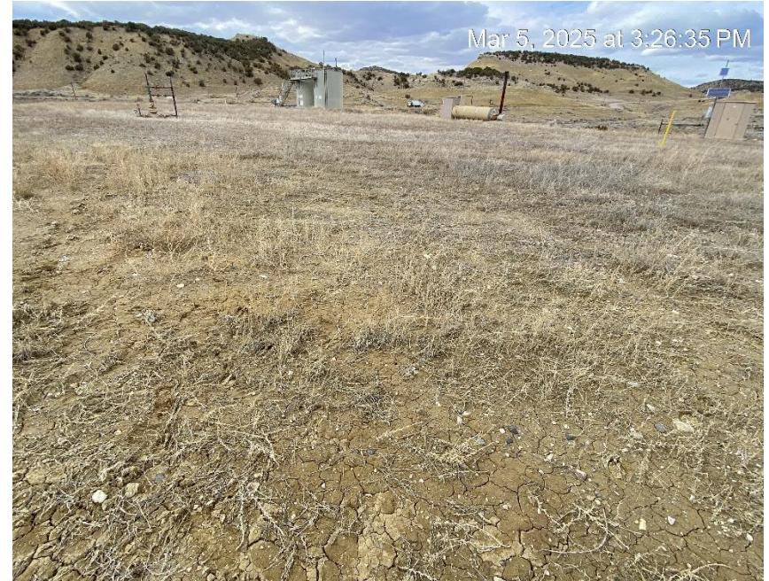
Location from the Southeast corner