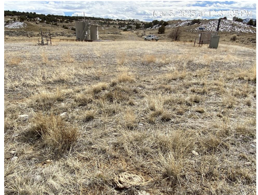
Location from West corner