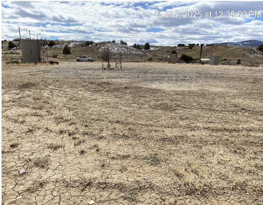
Location from North corner