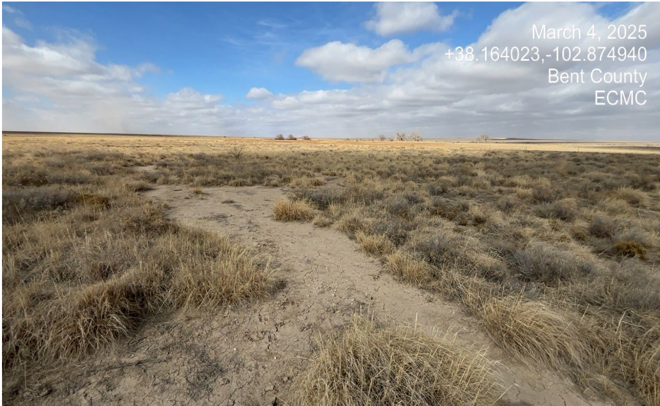
Photo 1. Facing north at the location. There is a small area approximately 40 ft with no vegetation..