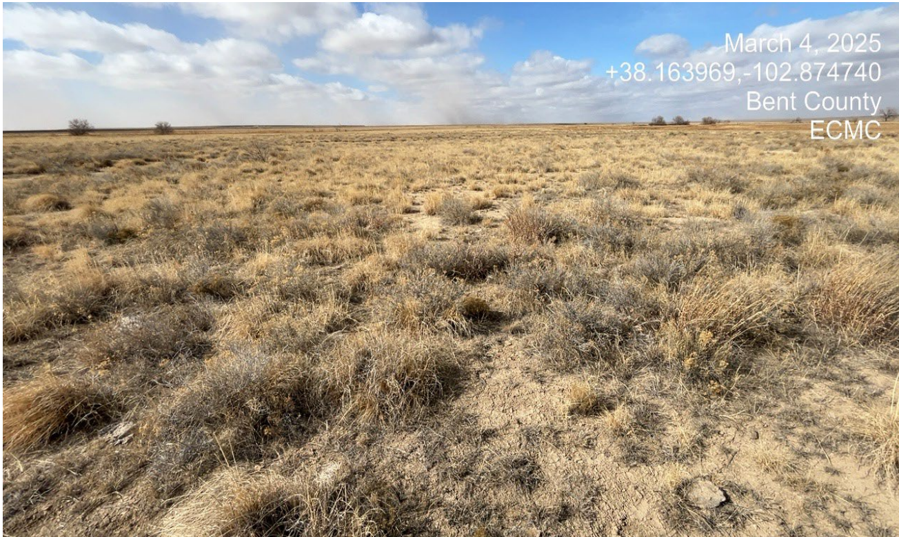
Photo 2. Facing northwest towards the west half of the location. Perennial vegetation is well established on the western half of the location.