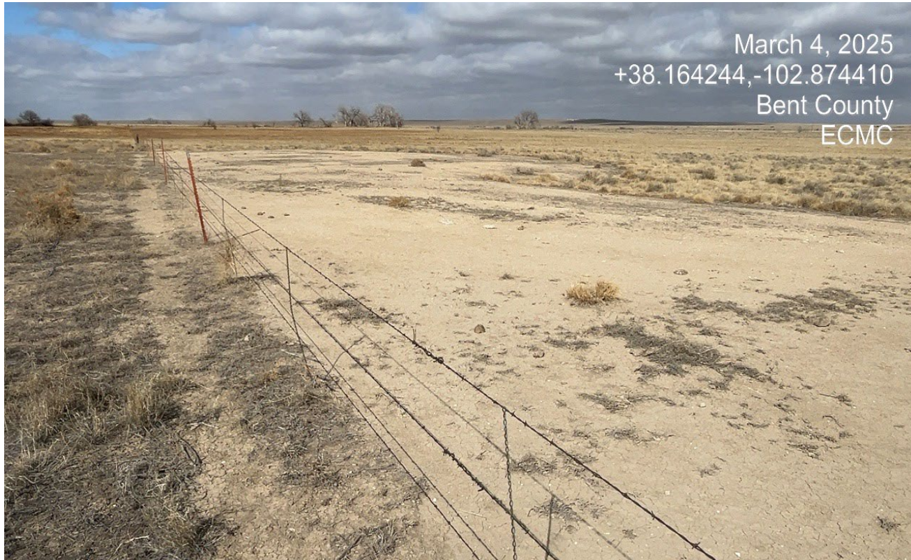
Photo 3. Facing northeast toward the east side of the location. This area is mostly bare of vegetation and has not been reclaimed.