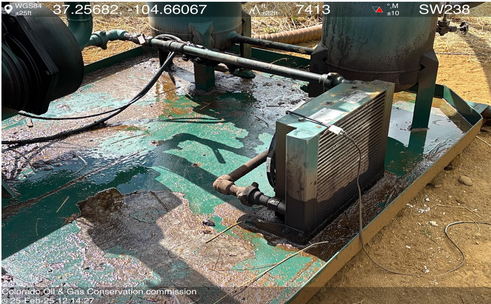
PHOTO 5: OILY WASTE IN COMPRESSOR SKID. DRAIN OILY WASTE REPAIR ALL LEAKS AND REMOVE OR TREAT IMPACTED SOIL PER RULE 1002..(2).D & 1002.f.(2)B, Comply with general provisions of the oil and gas act for wildlife protection AND SB-181. CA DATE 2-26-2025