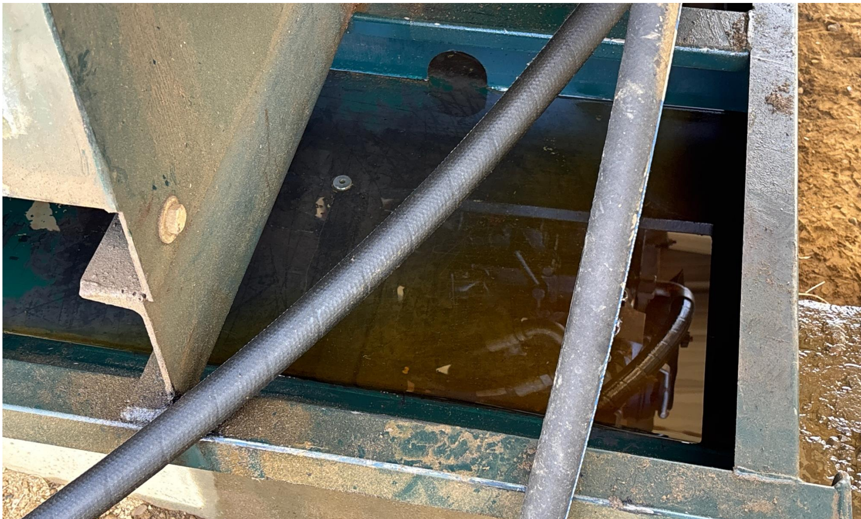
PHOTO 4: OILY WASTE IN PRIME MOVER ENGINE SKID. DRAIN OILY WASTE REPAIR ALL LEAKS AND REMOVE OR TREAT IMPACTED SOIL PER RULE 1002..(2).D & 1002.f.(2)B, Comply with general provisions of the oil and gas act for wildlife protection AND SB-181. CA DATE 2-26-2025