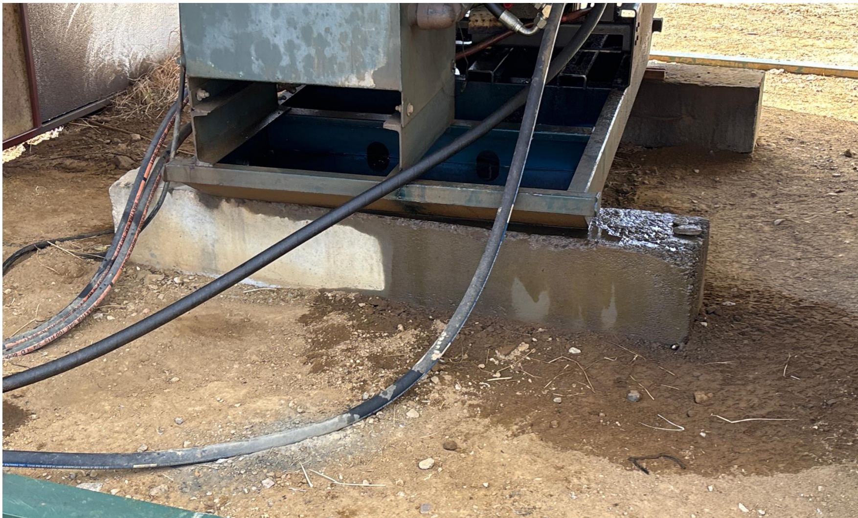
PHOTO 6: AREA OF IMPACTED SOIL AROUND PRIME MOVER ENGINE SKID. Conduct maintenance on equipment, cleanup stained material and review self inspection processes. COMPLY WITH RULE 1002,.(2).D. CA DATE 3-2-2025.