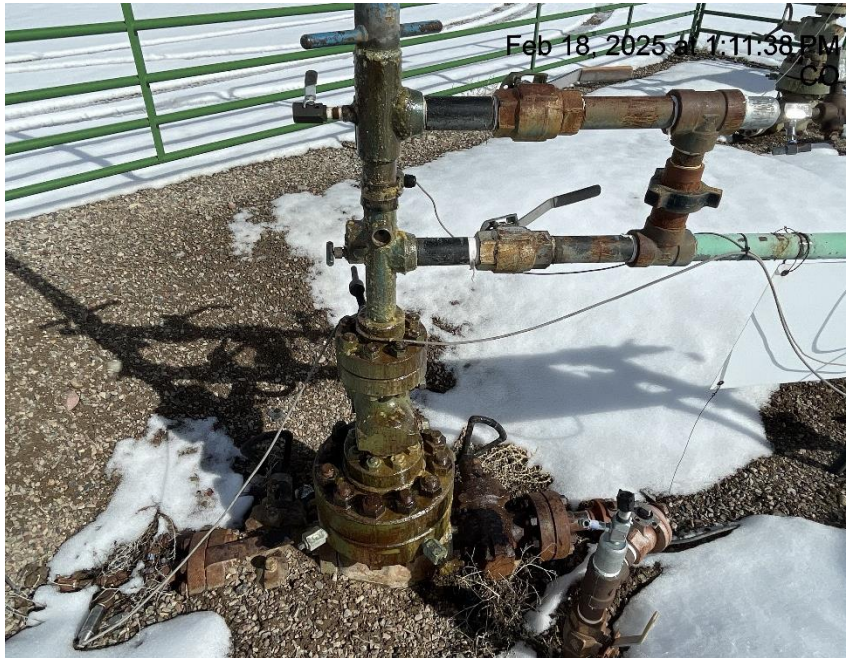
Photo # 6365 Mechanical condition – possible wellhead leak on the LOUTHAN 31B-34 wellhead