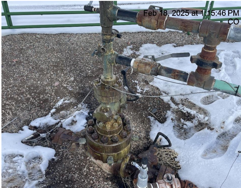
Photo # 6371 Mechanical condition – possible wellhead leak on the LOUTHAN 31B-34 wellhead