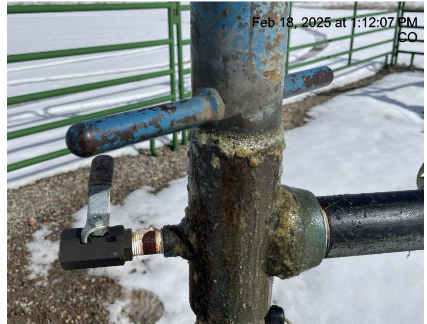
Photo # 6366 Mechanical condition – possible wellhead leak on the LOUTHAN 31B-34 wellhead