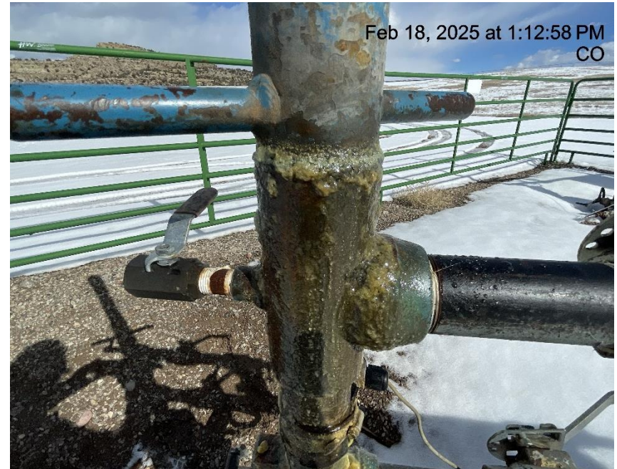
Photo # 6368 Mechanical condition – possible wellhead leak on the LOUTHAN 31B-34 wellhead