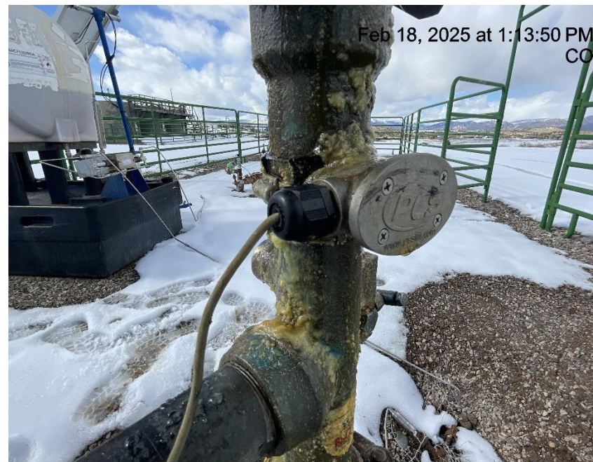
Photo # 6370 Mechanical condition – possible wellhead leak on the LOUTHAN 31B-34 wellhead