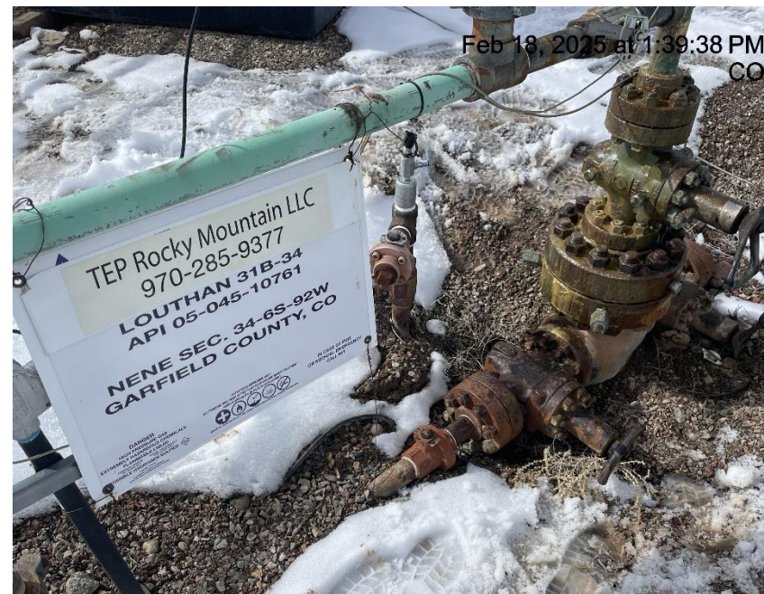
Photo # 6364 Mechanical condition – possible wellhead leak on the LOUTHAN 31B-34 wellhead