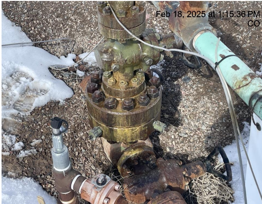
Photo # 6373 Mechanical condition – possible wellhead leak on the LOUTHAN 31B-34 wellhead