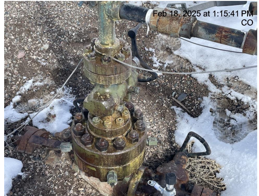
Photo # 6372 Mechanical condition – possible wellhead leak on the LOUTHAN 31B-34 wellhead