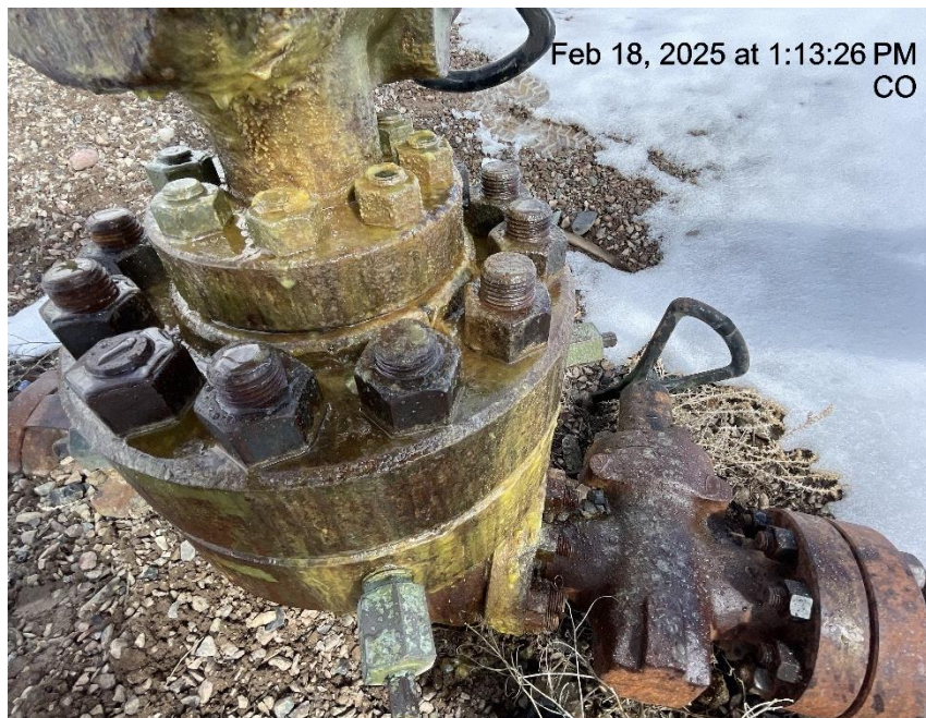
Photo # 6375 Mechanical condition – possible wellhead leak on the LOUTHAN 31B-34 wellhead