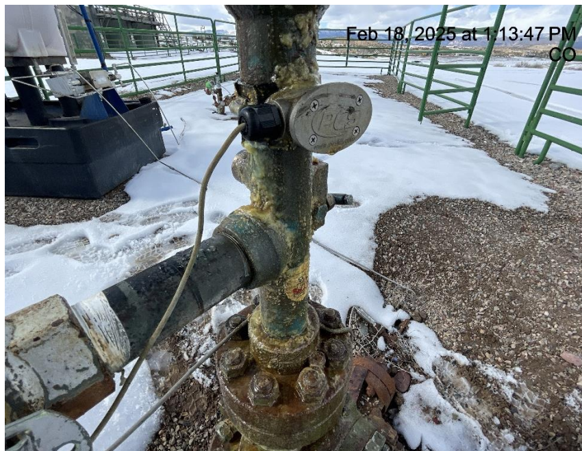
Photo # 6369 Mechanical condition – possible wellhead leak on the LOUTHAN 31B-34 wellhead