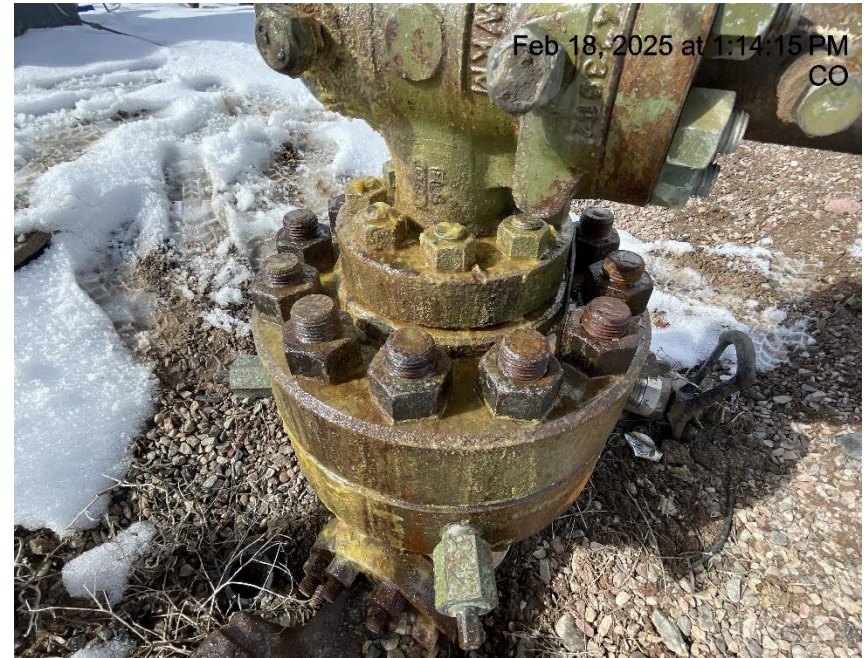
Photo # 6374 Mechanical condition – possible wellhead leak on the LOUTHAN 31B-34 wellhead