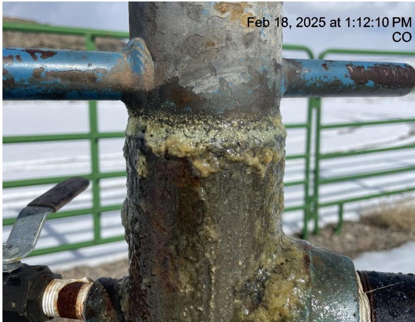
Photo # 6367 Mechanical condition – possible wellhead leak on the LOUTHAN 31B-34 wellhead