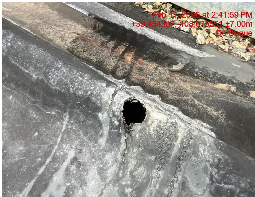
Photo # 4867 Hole in secondary containment liner/liner needs maintenance