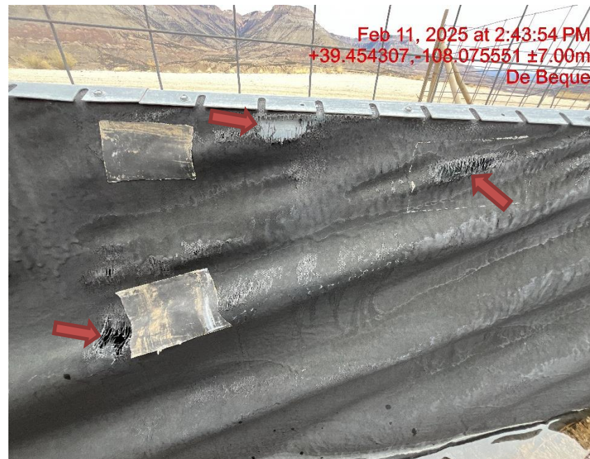
Photo # 4870 Holes in secondary containment liner/liner needs maintenance