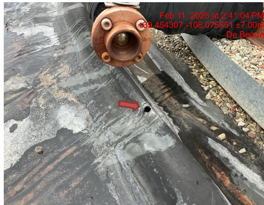
Photo # 4865 Hole in secondary containment liner/liner needs maintenance