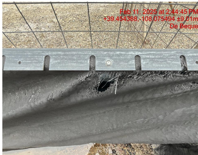
Photo # 4873 Hole in secondary containment liner/liner needs maintenance