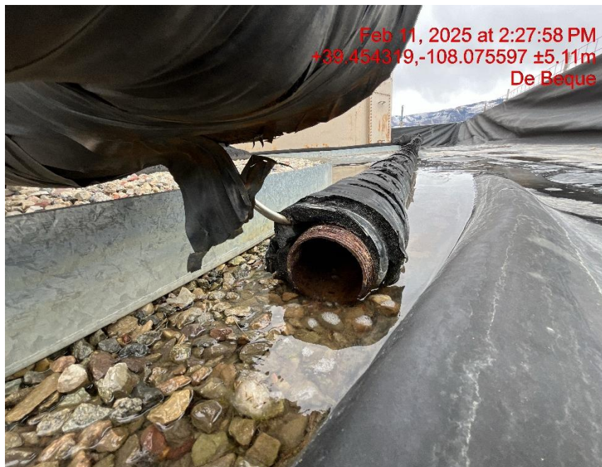
Photo # 4853 Open ended piping/wildlife hazard/available for entry by wildlife