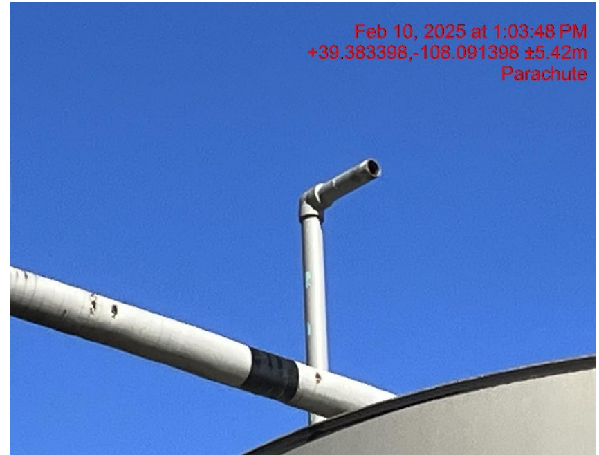
Photo # 4549 Open ended piping/wildlife hazard/available for entry by wildlife