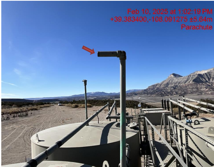
Photo # 4547 Open ended piping/wildlife hazard/available for entry by wildlife