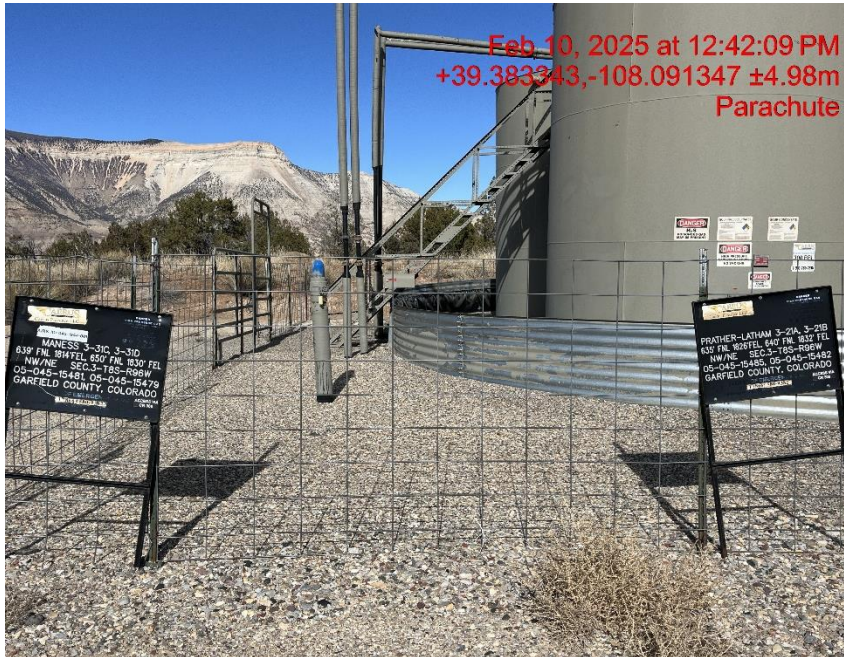
Photo # 4520 Signs at tank battery lack required information/do not comply with CECMC