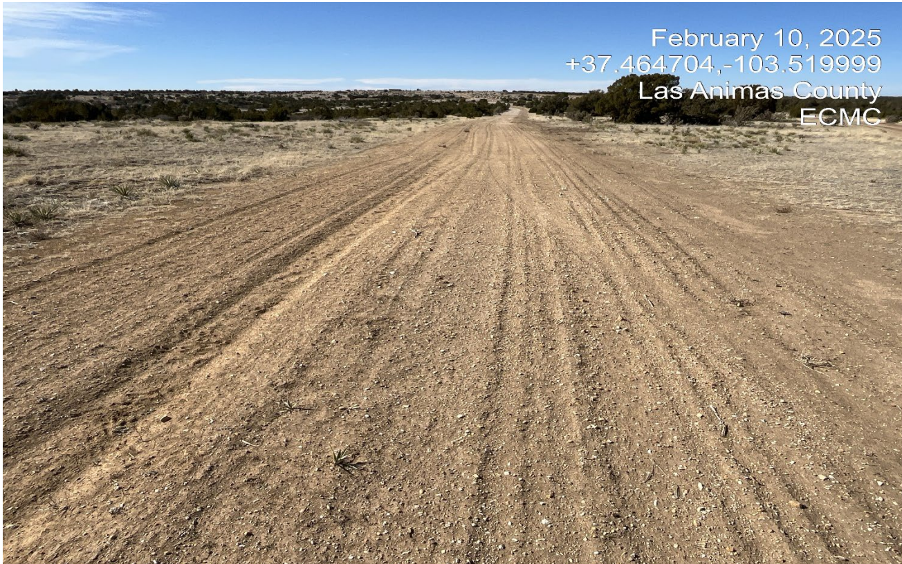
Photo 6. Facing west toward the flowline disturbance.