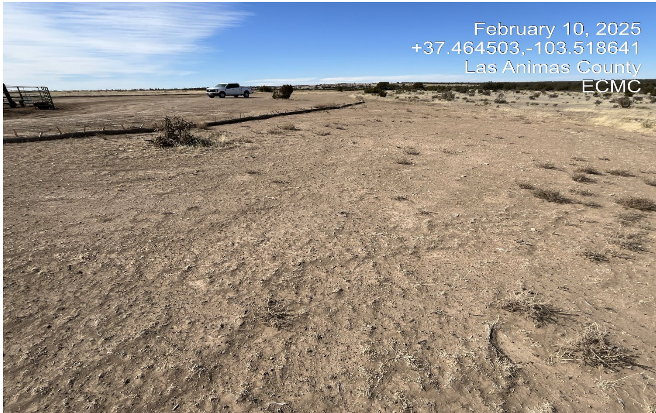
Photo 5. Northeast corner facing west. Perimeter wattles have been reinstalled. Disturbed area have not establish perennial vegetation.