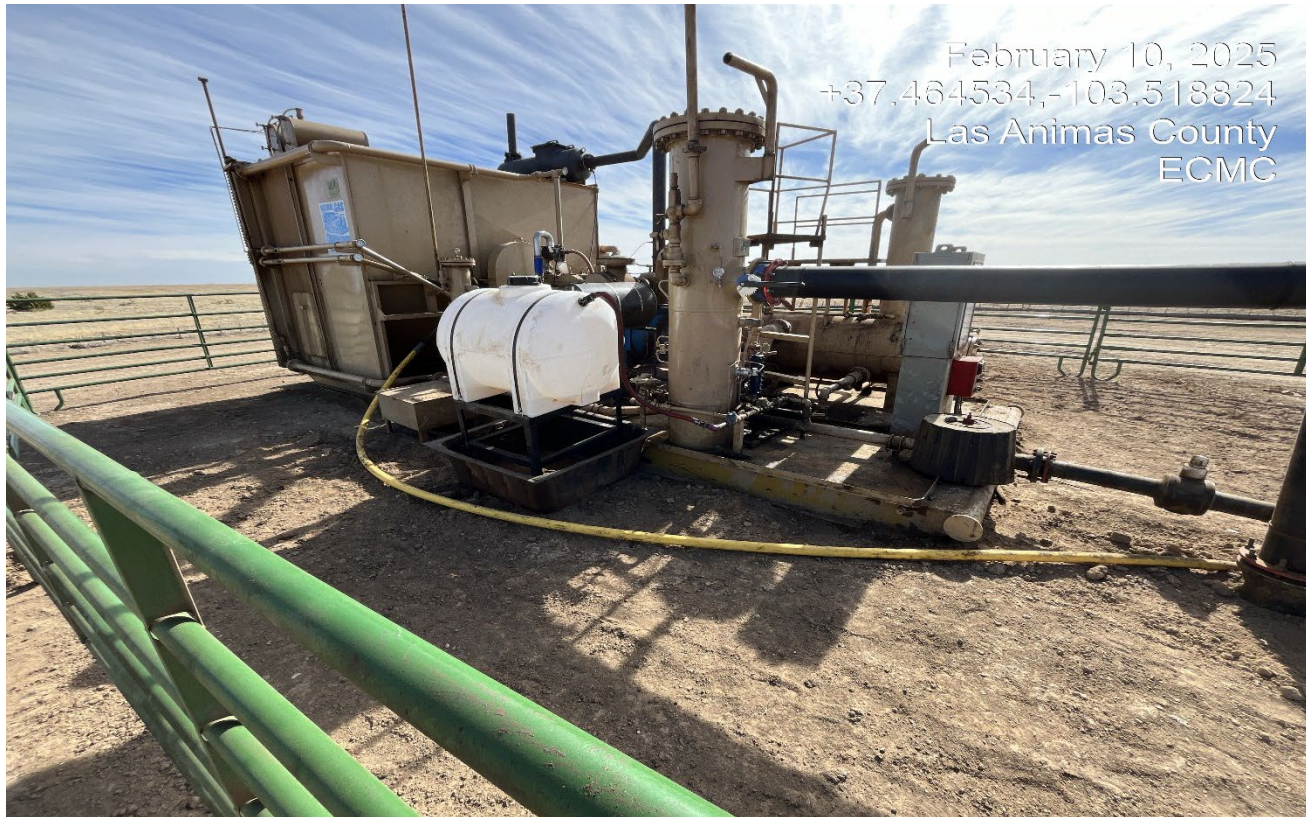
Photo 4. Facing toward the engine compressor.