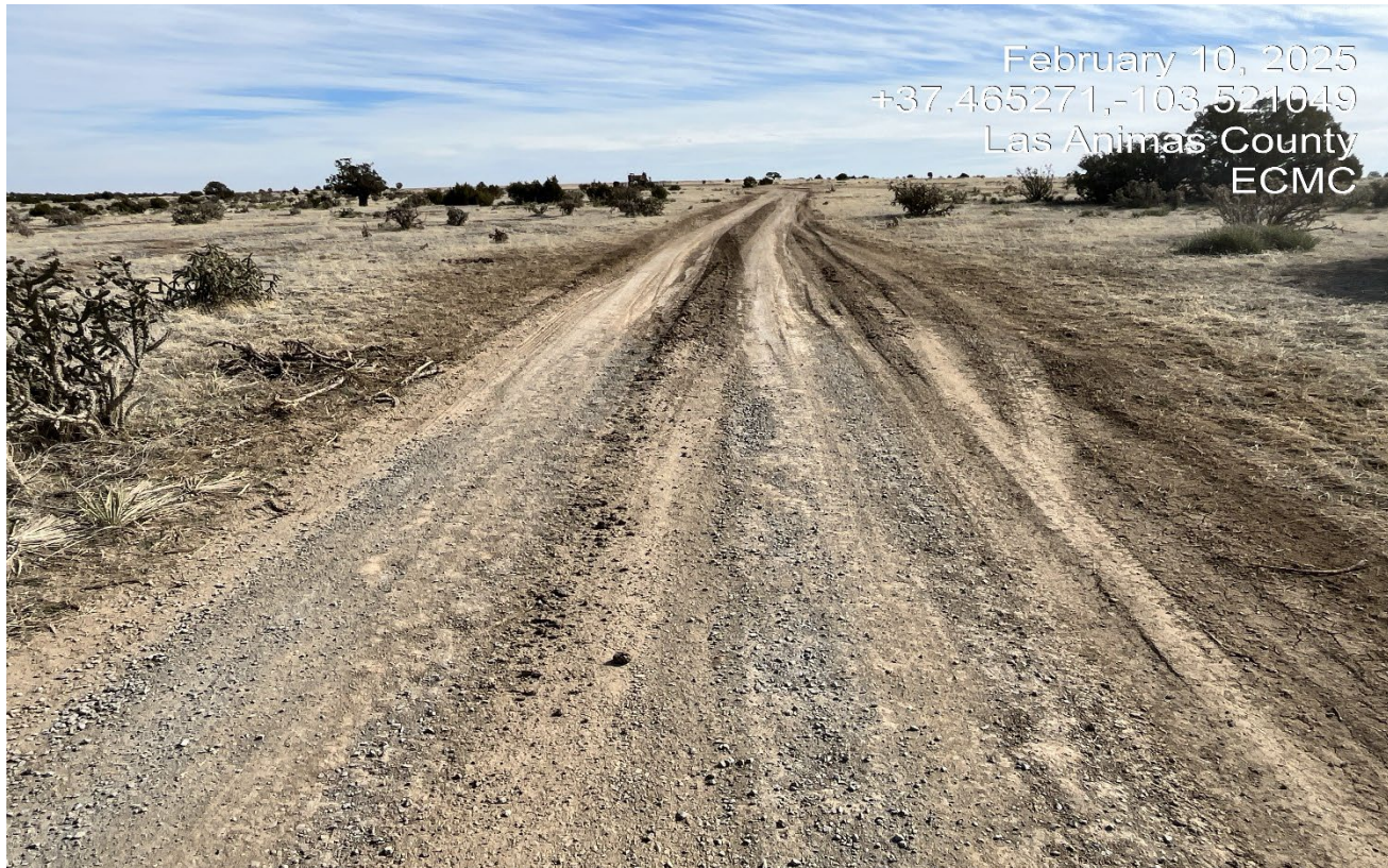
Photo 1. Facing east along the access road. This area of the road is rutted and needs to be repaired with BMP's.