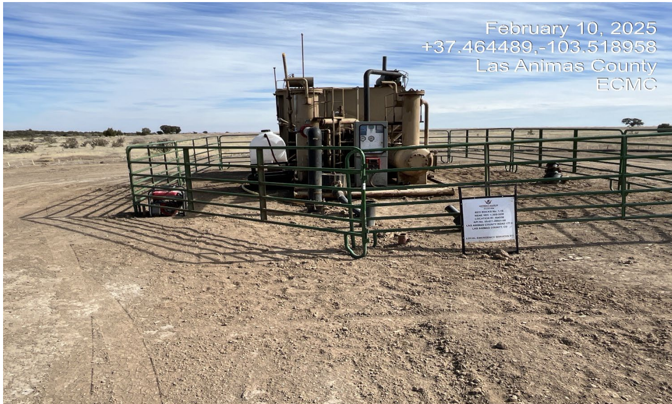
Photo 3. Facing east at the wellsite and engine compressor.