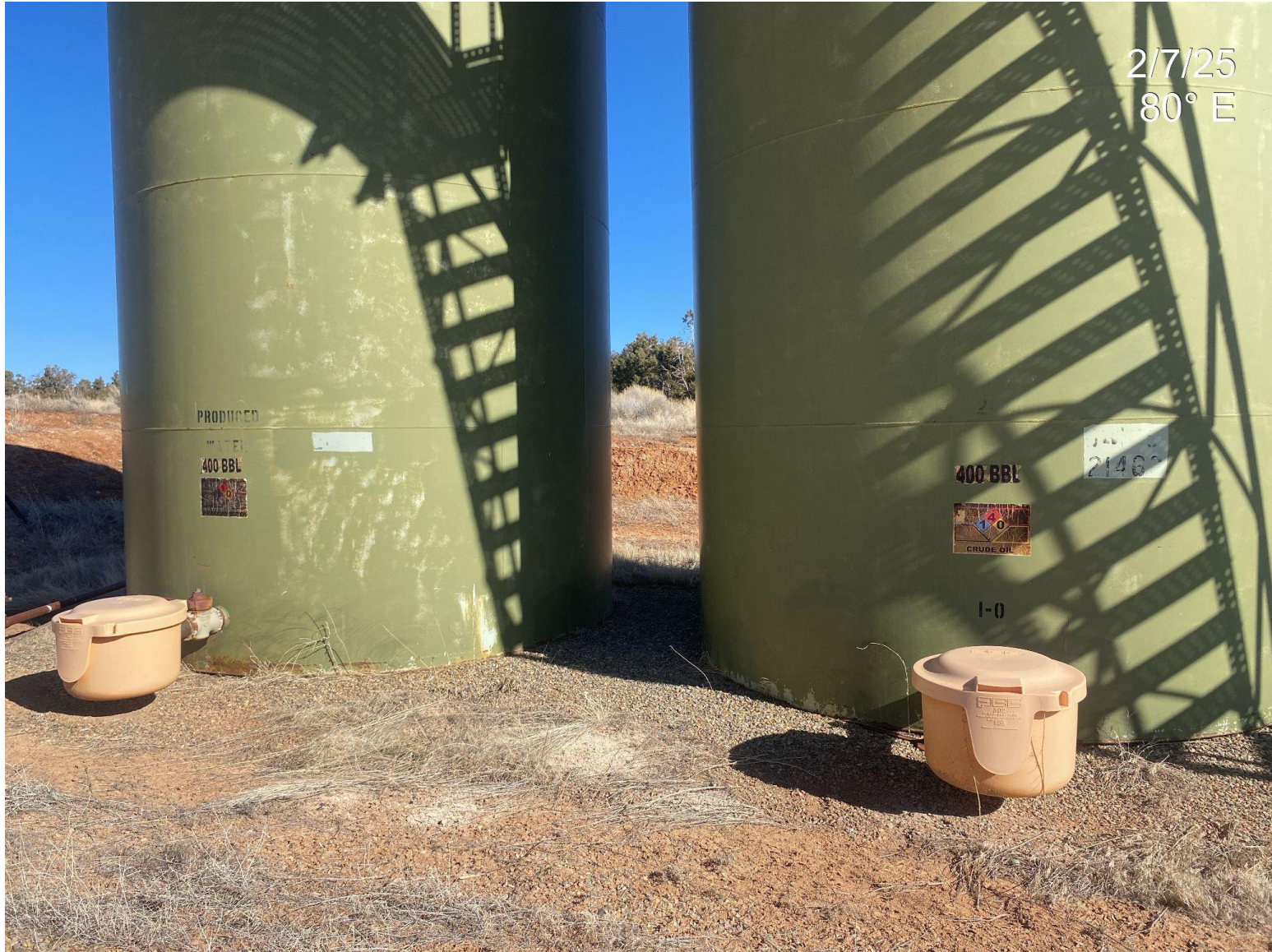
Photo 2: Produced water tank NFPA labels are too dark and not legible.