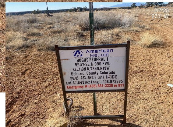
Photo 1. View of the well pad from the access point facing center.