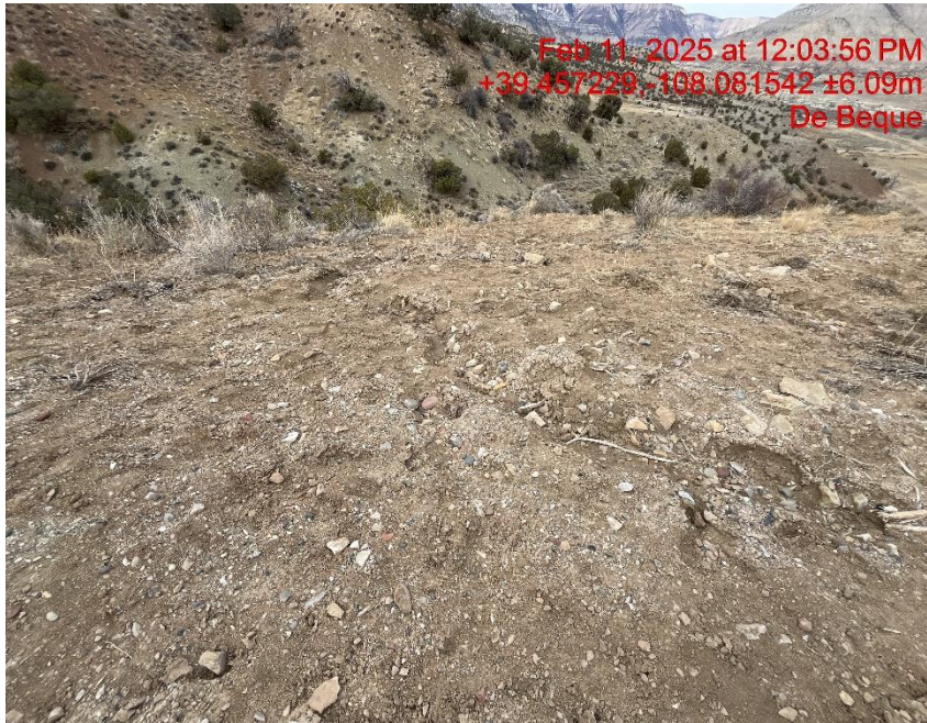
Photo # 4708 Erosion & transport of sediment off location/insufficient BMP's