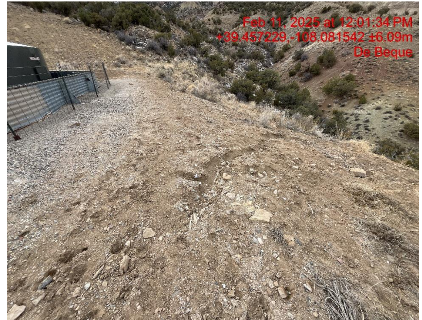
Photo # 4703 Erosion & transport of sediment off location/insufficient BMP's