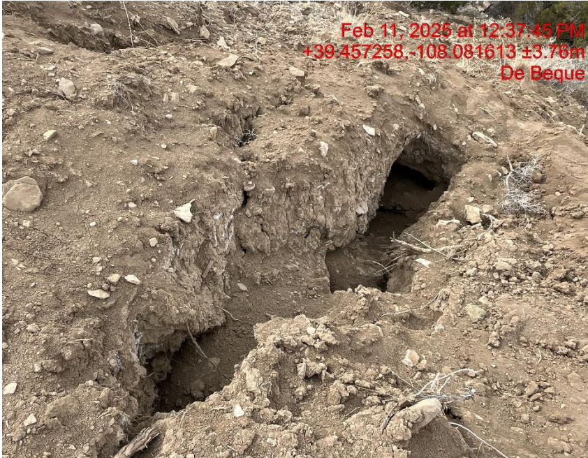
Photo # 4759 Subsidence on slope, additionally is a wildlife hazard