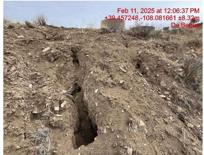
Photo # 4713 Subsidence on slope, additionally is a wildlife hazard