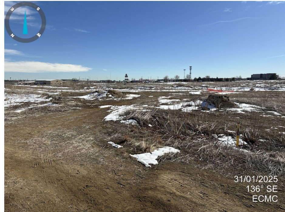
Photo 2. Looking southeast towards well location.