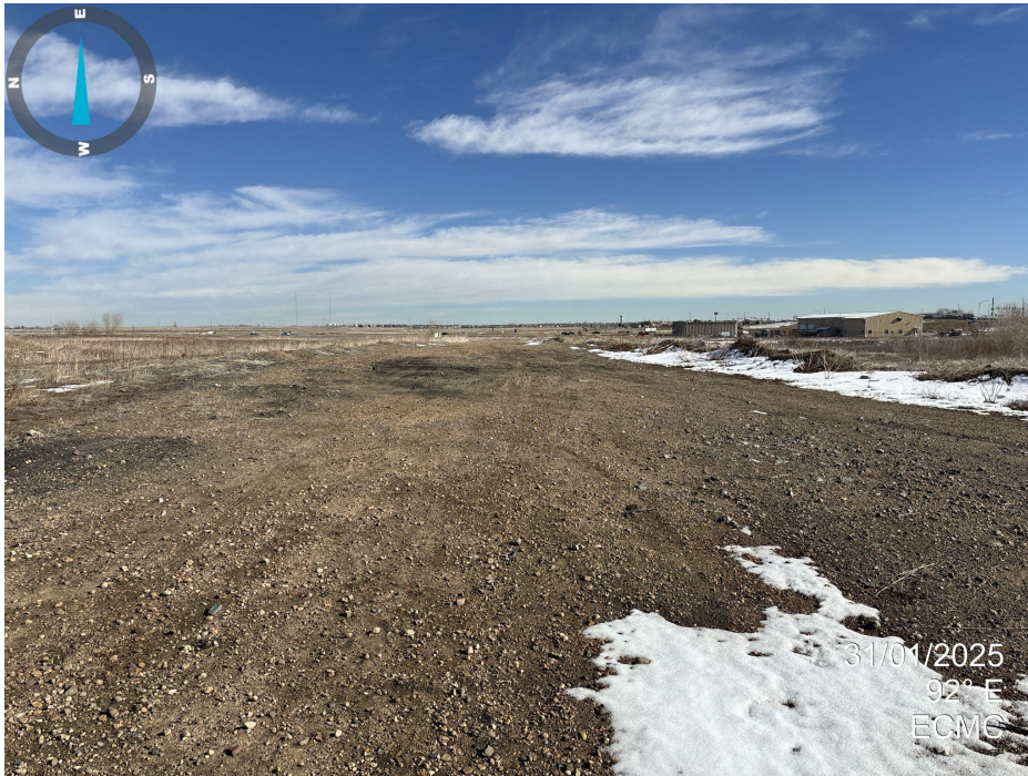
Photo 7. Looking east from well location down main access road. It appears this road is being used for construction purposes.