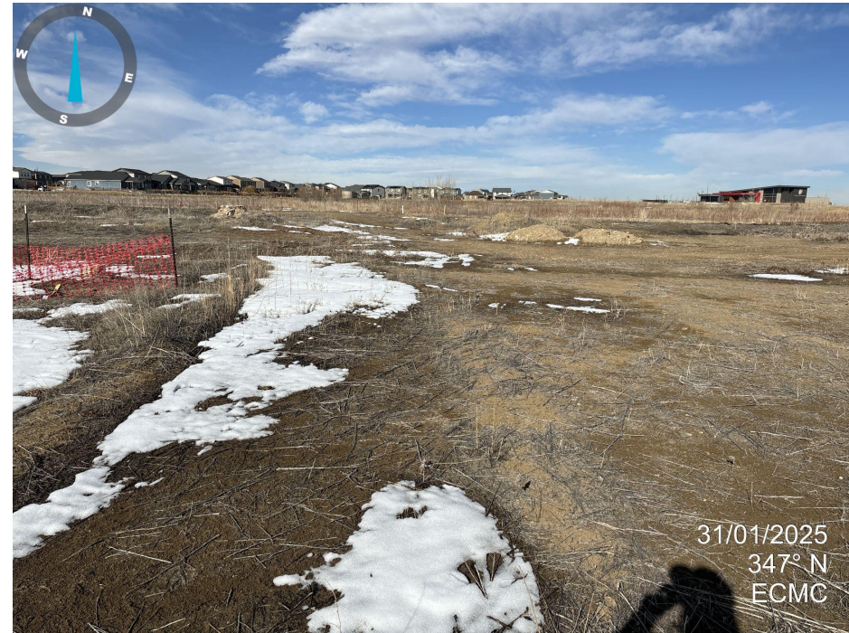
Photo 6. Looking north from well site. Piles of rubble and debris are present on location.