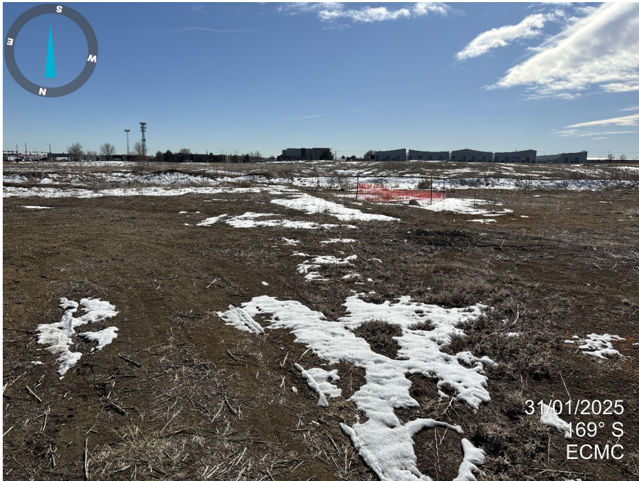
Photo 3. Looking south across the well location. Orange construction fencing is present around wellbore.