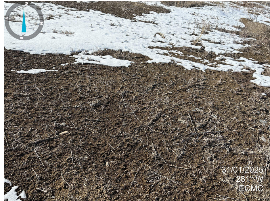
Photo 8. Reference vegetation west of the well location.