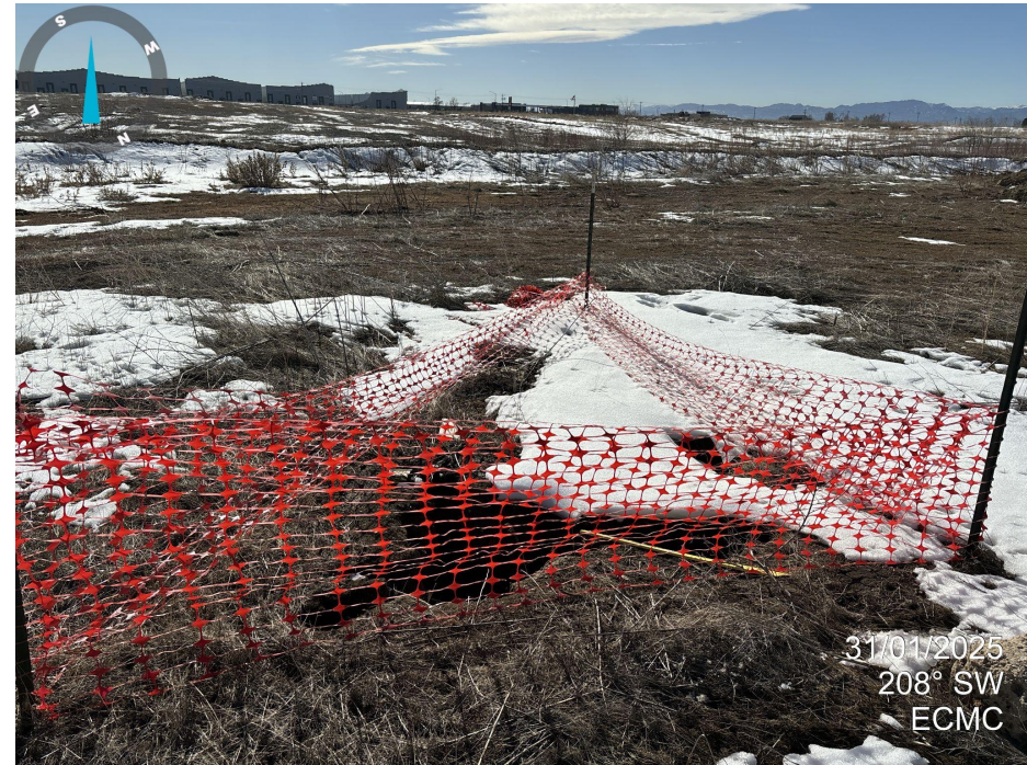
Photo 4. An open excavation is present over the wellbore. A flag marked Civitas is present.