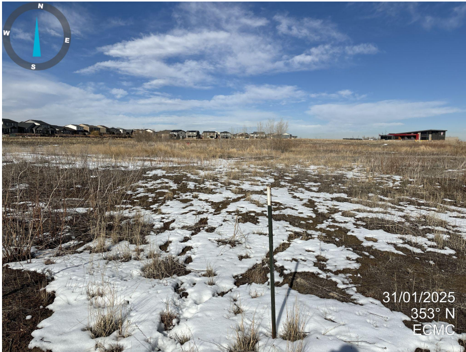
Photo 1. Looking north down former northern access road. This area appears to have had reclamation work conducted and perennial vegetation has established.