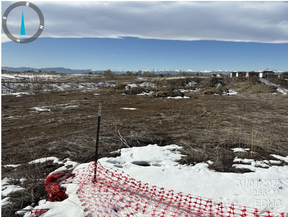
Photo 5. Looking west from the wellbore. Fresh piles of soil are present on well location. It appears that perennial vegetation has established on some portions of the location.