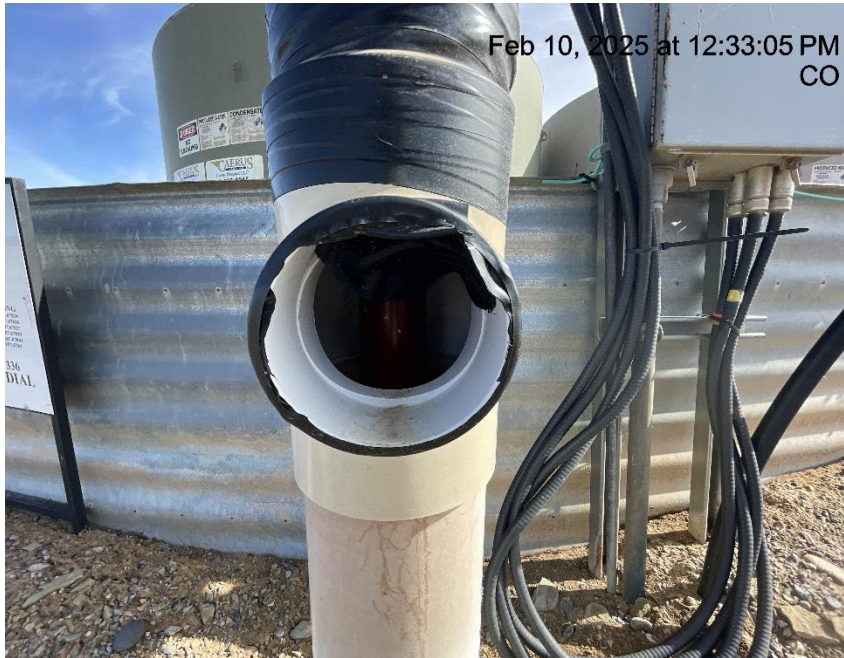
Photo # 4640 Flowline heating insulation open ended/wildlife hazard/available for entry by wildlife