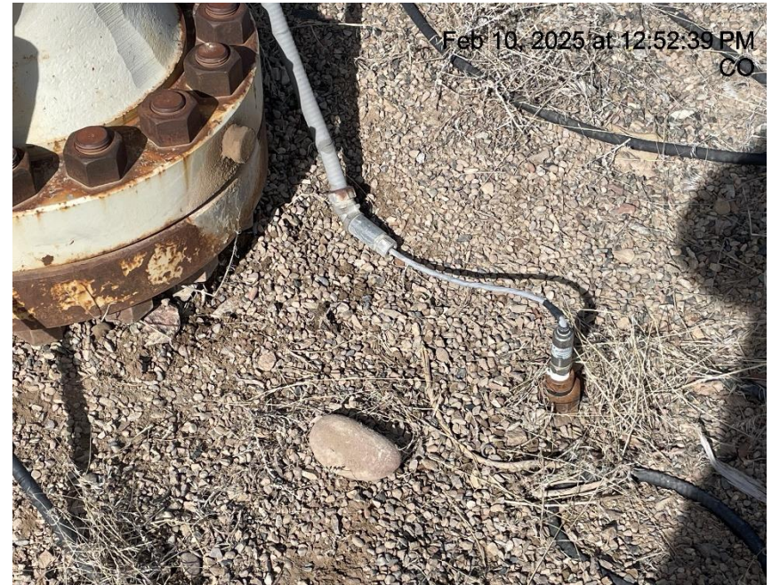
Photo # 4641 Valves used for annular pressure monitoring buried & not exposed/not in compliance with CECMC rules (HILL 16-4A1 well)