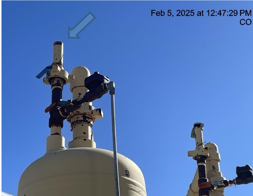
Photo # 3685 Rupture disc vent line does not comply with CECMC pressure safety device rules