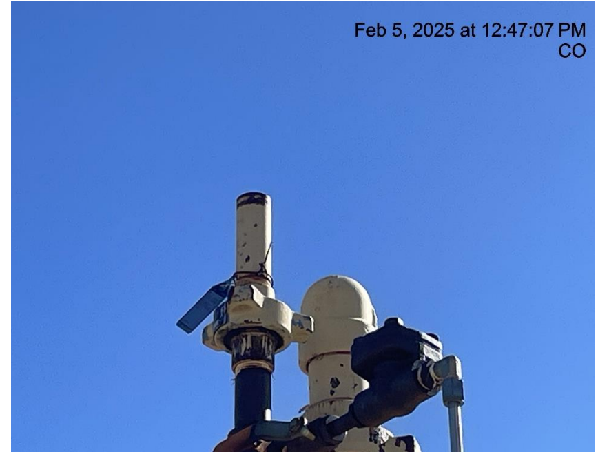
Photo # 3686 Rupture disc vent line does not comply with CECMC pressure safety device rules