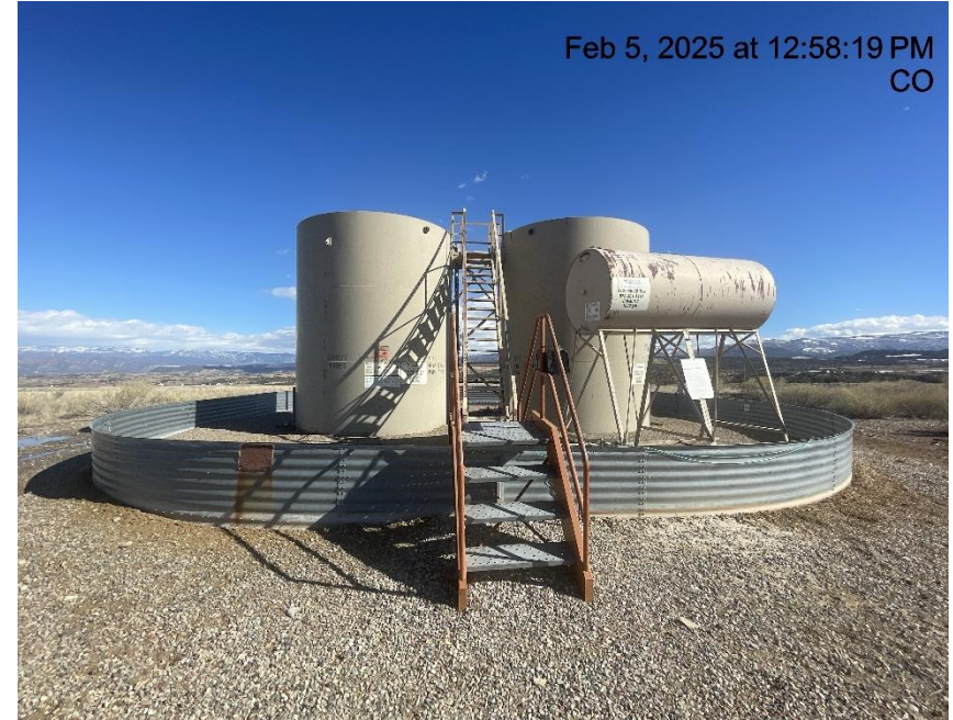
Photo # 3684 Battery lacks required signage/not in compliance with CECMC rules