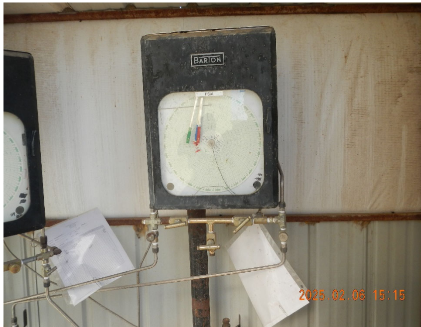
5. Gas meter inside meter shed.