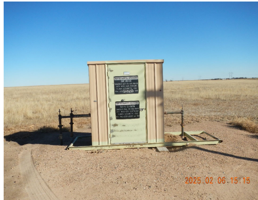
6. Gathering location overview.