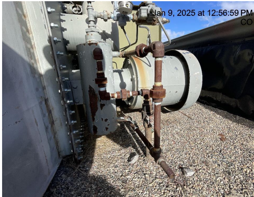
Photo # 7693 From inspection 708905468 conducted on 01/09/2025 PRV vent line does not comply with CECMC pressure safety device rules