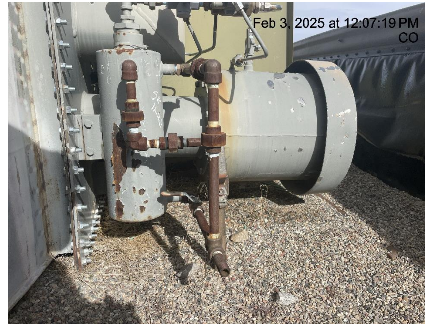
Photo # 3094 PRV vent line does not comply with CECMC pressure safety device rules