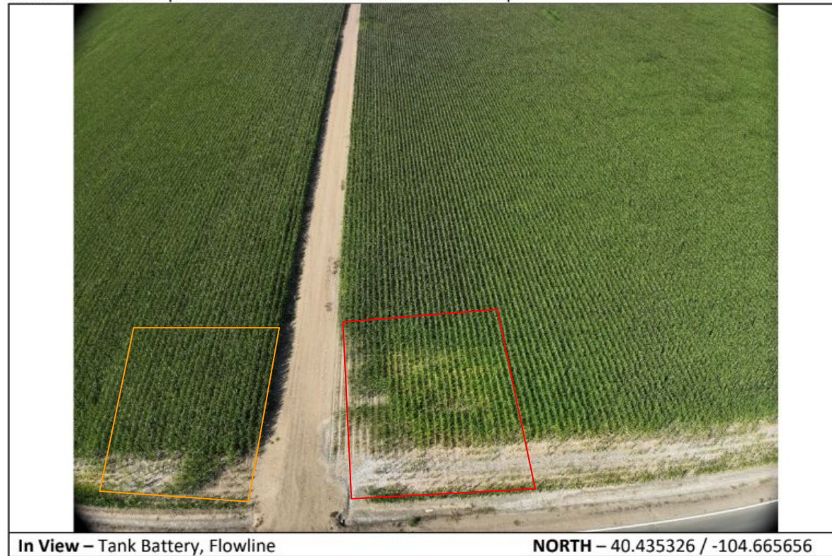
Photo 2. Drone aerial imagery of the former tank battery (Page 13). The former tank battery location (outlined in red by ECMC) does not appear to be reflective of the adjacent reference areas (outlined in orange by ECMC).

Cardinal directional photos of the site. Reference overview map.