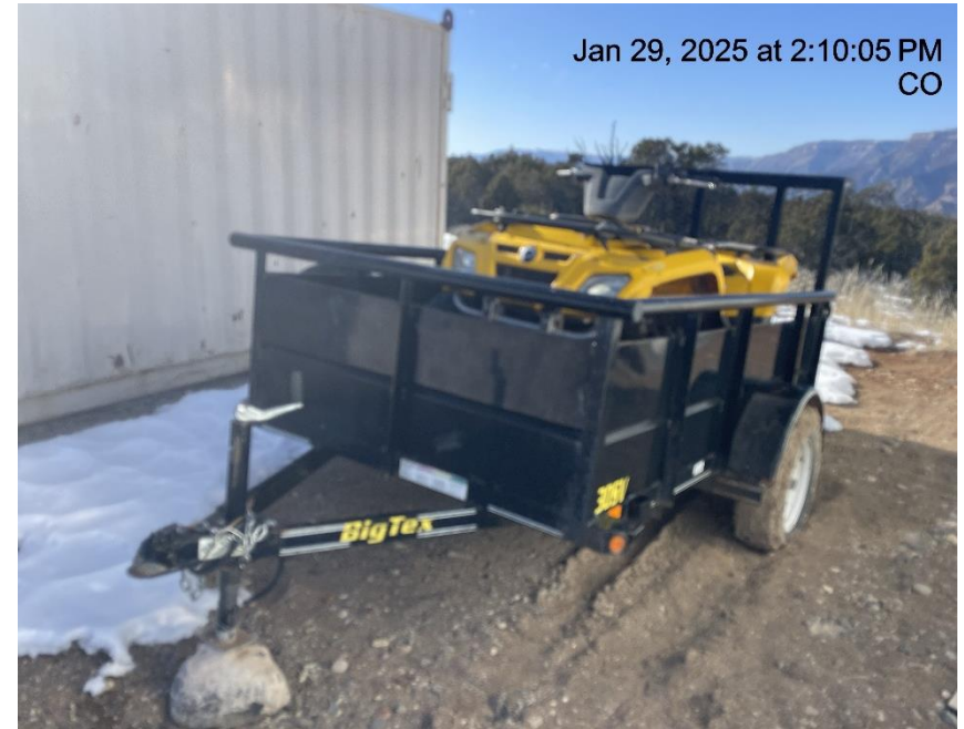
Photo # 2445 Stored trailer on location (Stored ATV added to trailer since last inspection)