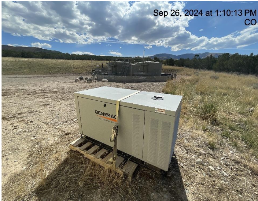
Photo # 2353 From inspection 708904676 conducted on 09/26/2024 Stored generator on location