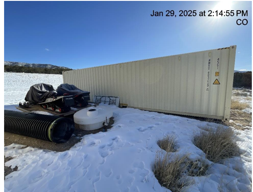
Photo # 2447 Stored shipping container, snowmobiles & misc on location