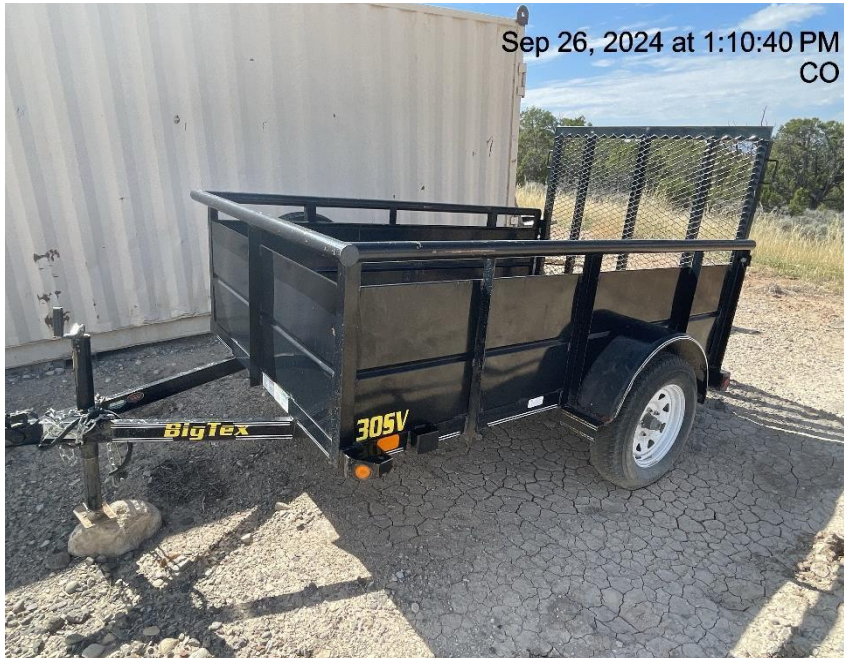
Photo # 2352 From inspection 708904676 conducted on 09/26/2024 Stored trailer on location