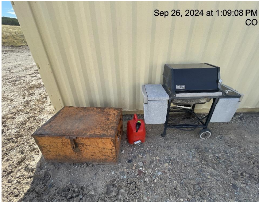
Photo # 2356 From inspection 708904676 conducted on 09/26/2024 Stored misc & Improperly stored fuel container on location