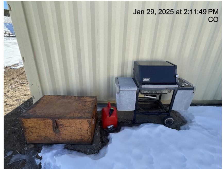
Photo # 2449 Stored misc & Improperly stored fuel container on location