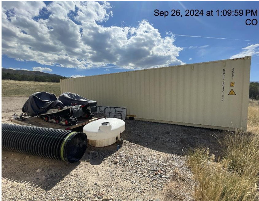
Photo # 2354 From inspection 708904676 conducted on 09/26/2024 Stored shipping container, snowmobiles & misc on location