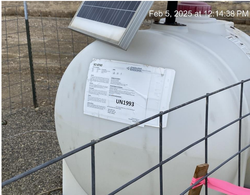
Damaged and faded label