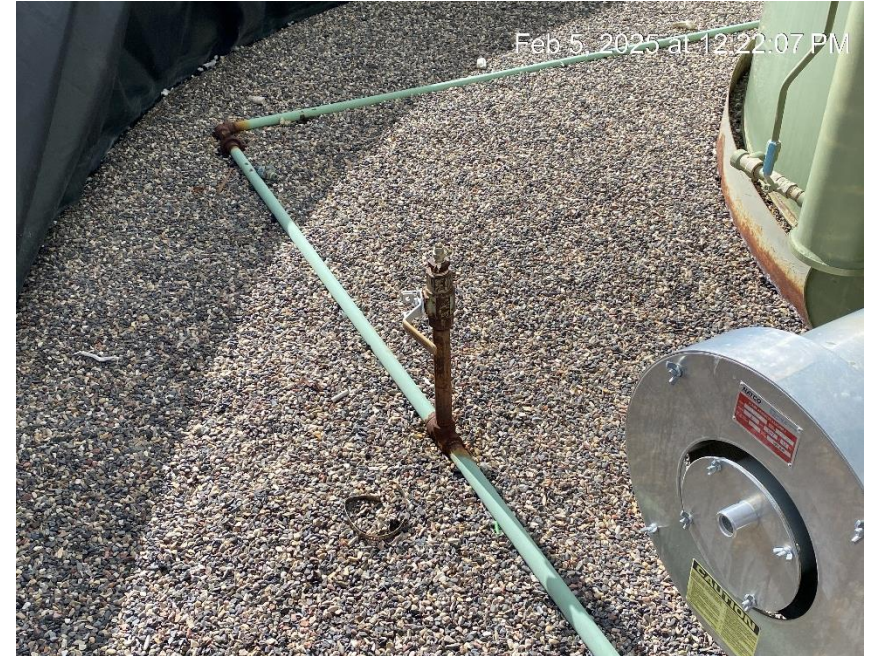
Open end gas valve