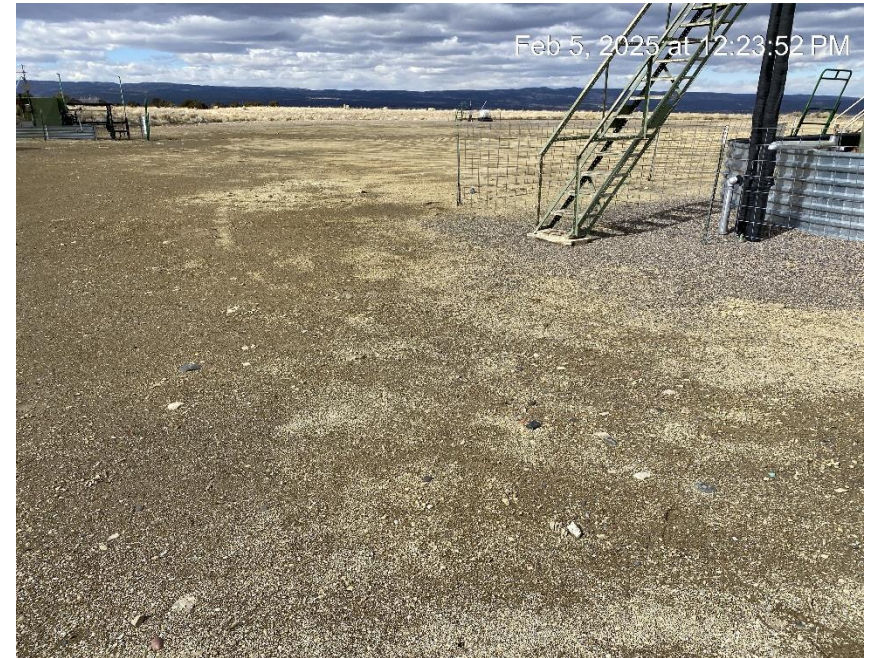
Location from Southeast corner