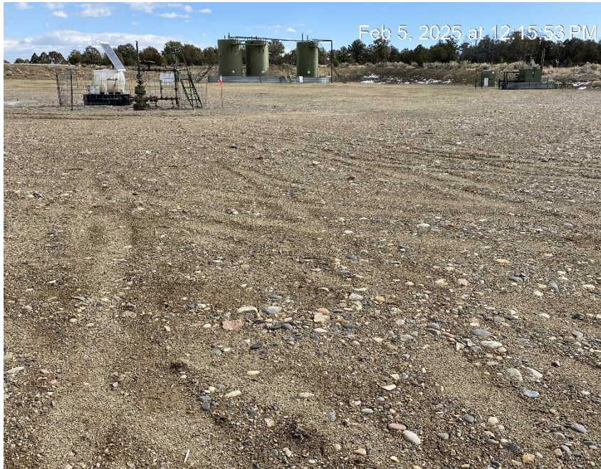
Location from Northwest corner