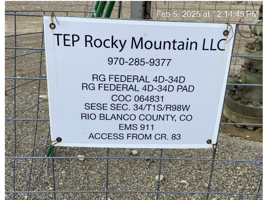
When replaced additional information is required