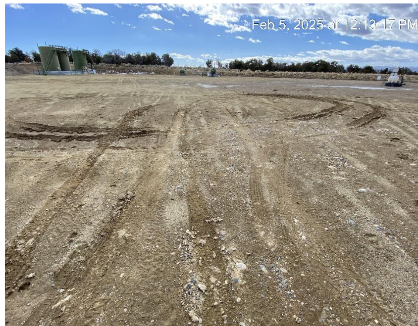
Location from North entrance