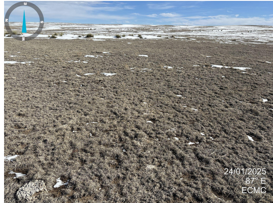
Photo 4. Looking east from well location. See Photo 1 comments.