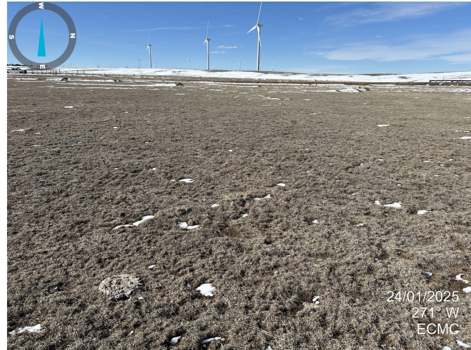
Photo 2. Looking west from well location. See Photo 1 comments.