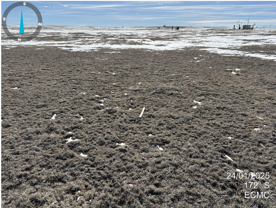
Photo 3. Looking south from well location. See Photo 1 comments.