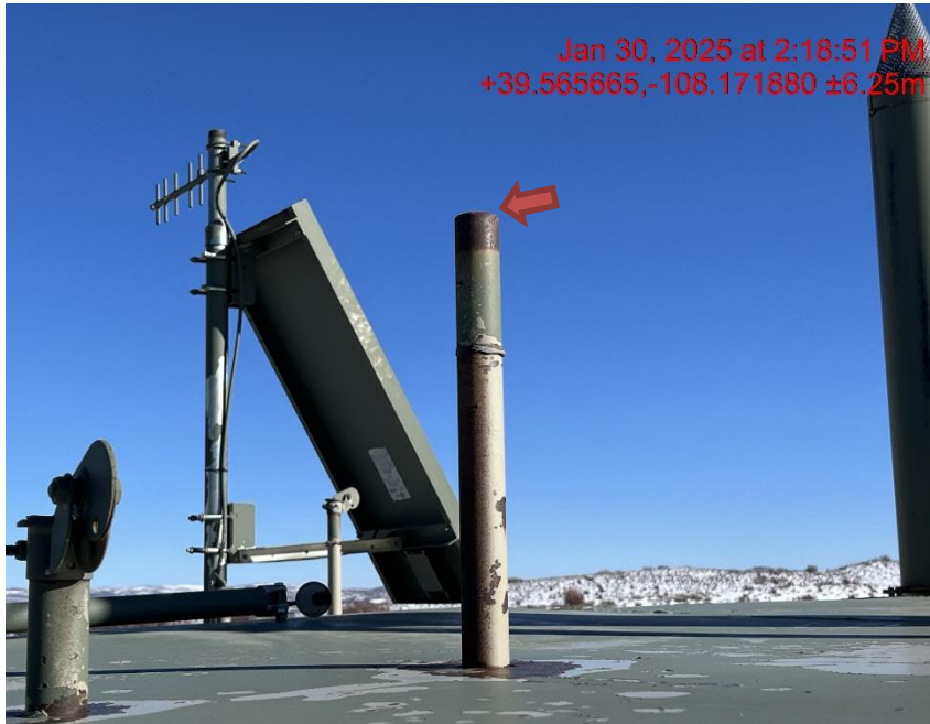
Photo # 3924 PRV vent line does not comply with CECMC pressure safety device rules