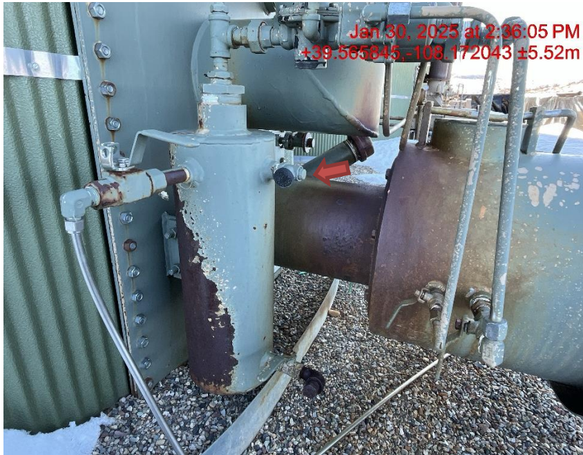
Photo # 3945 PRV vent line does not comply with CECMC pressure safety device rules