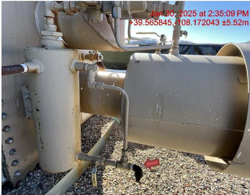
Photo # 3943 PRV vent line does not comply with CECMC pressure safety device rules