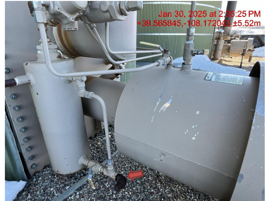
Photo # 3944 PRV vent line does not comply with CECMC pressure safety device rules