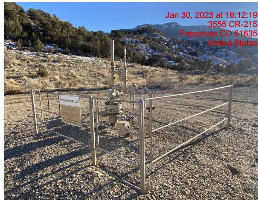
Location Overview – Photo #06403

Jan 30, 2025 at 16:12:19 3555 CR-215 Parachute CO 81635 United States