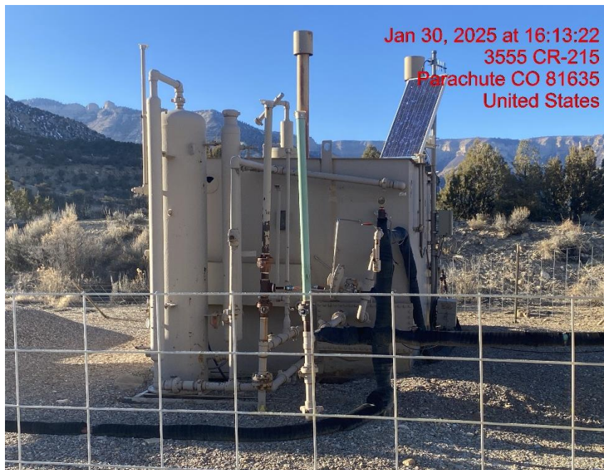
Location – Photo #06407