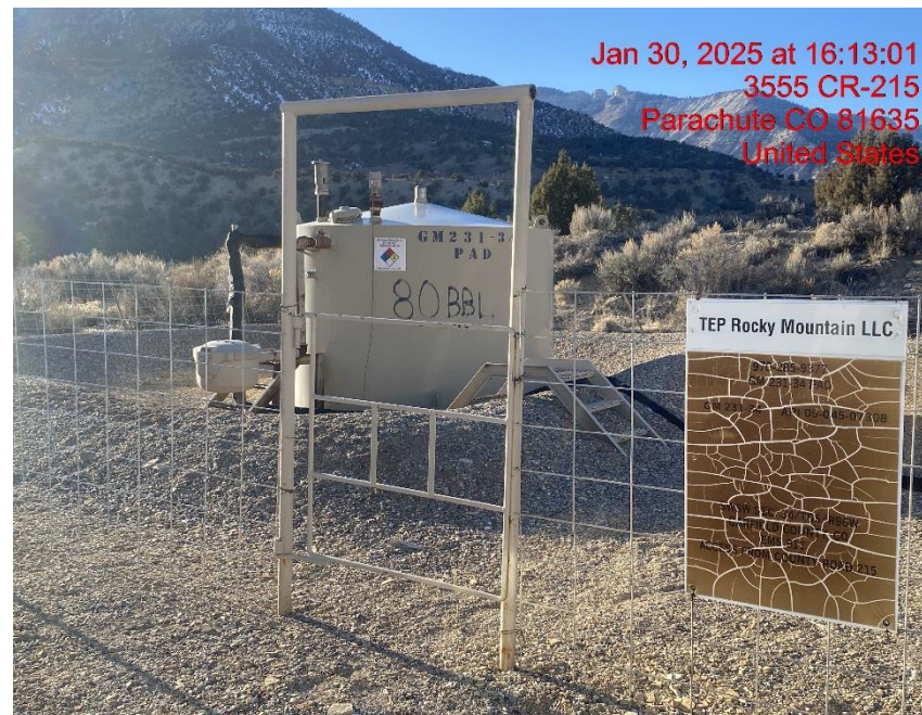
Location – Photo #06405