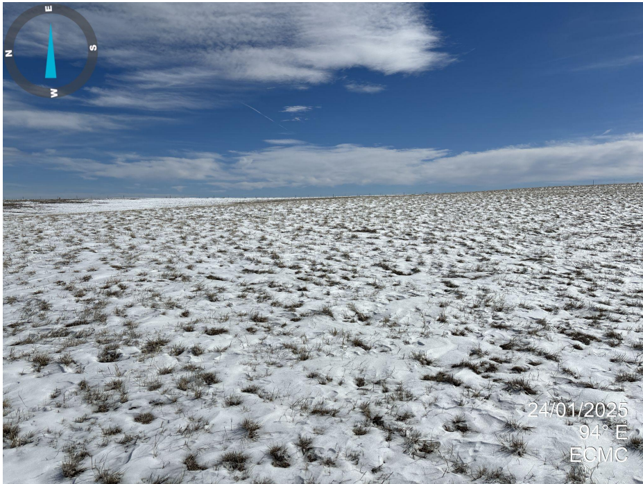
Photo 5. Looking east from wellbore. See Photo 4 comments.