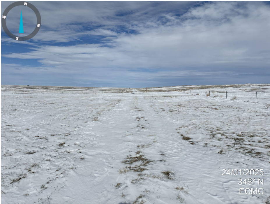
Photo 1. Photo taken looking north down access road toward location.