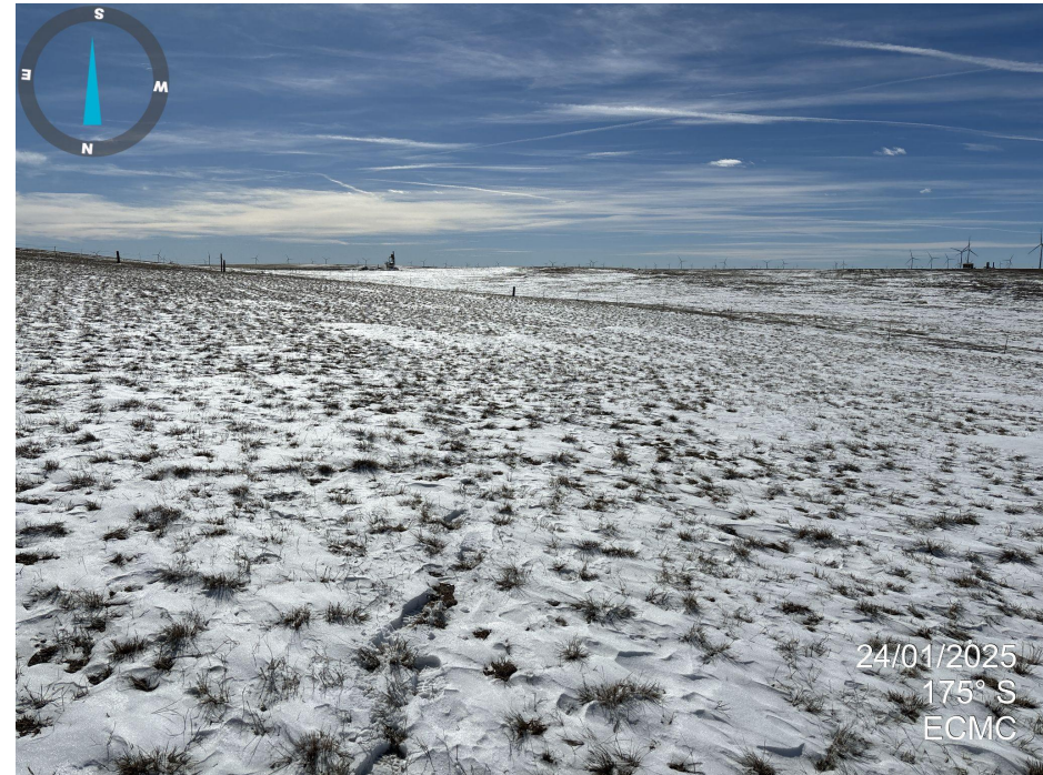
Photo 6. Looking south from wellbore. See Photo 4 comments.