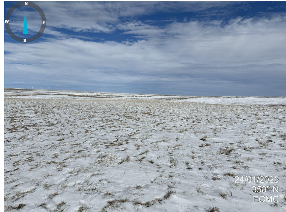
Photo 4. Looking north from wellbore. Snow cover prevented a full vegetative assessment.