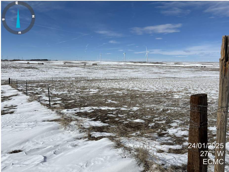
Photo 3. The location is fenced.