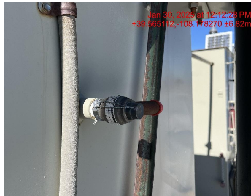
Photo # 3825 PRV vent line does not comply with CECMC pressure safety device rules