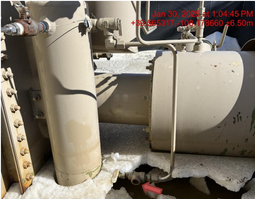
Photo # 3872 PRV vent line does not comply with CECMC pressure safety device rules