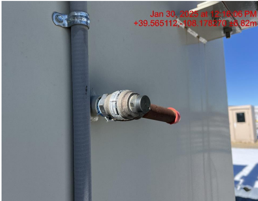
Photo # 3832 PRV vent line does not comply with CECMC pressure safety device rules