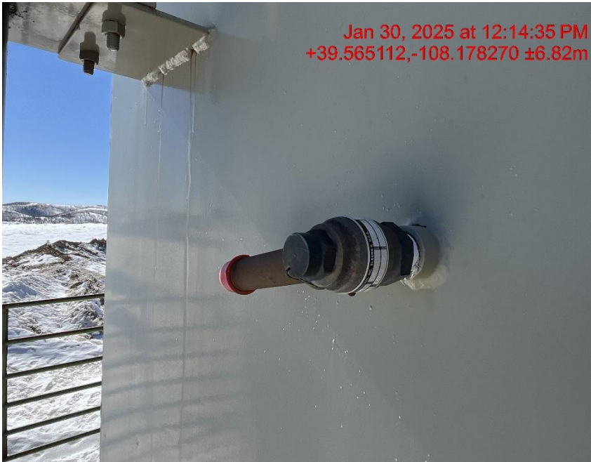
Photo # 3828 PRV vent line does not comply with CECMC pressure safety device rules