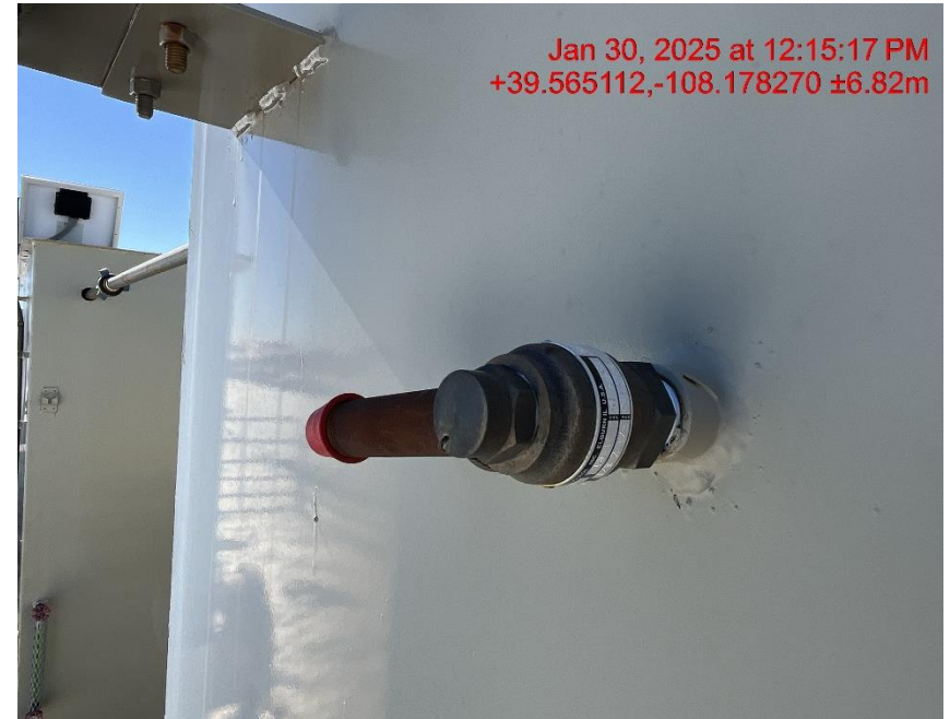
Photo # 3829 PRV vent line does not comply with CECMC pressure safety device rules