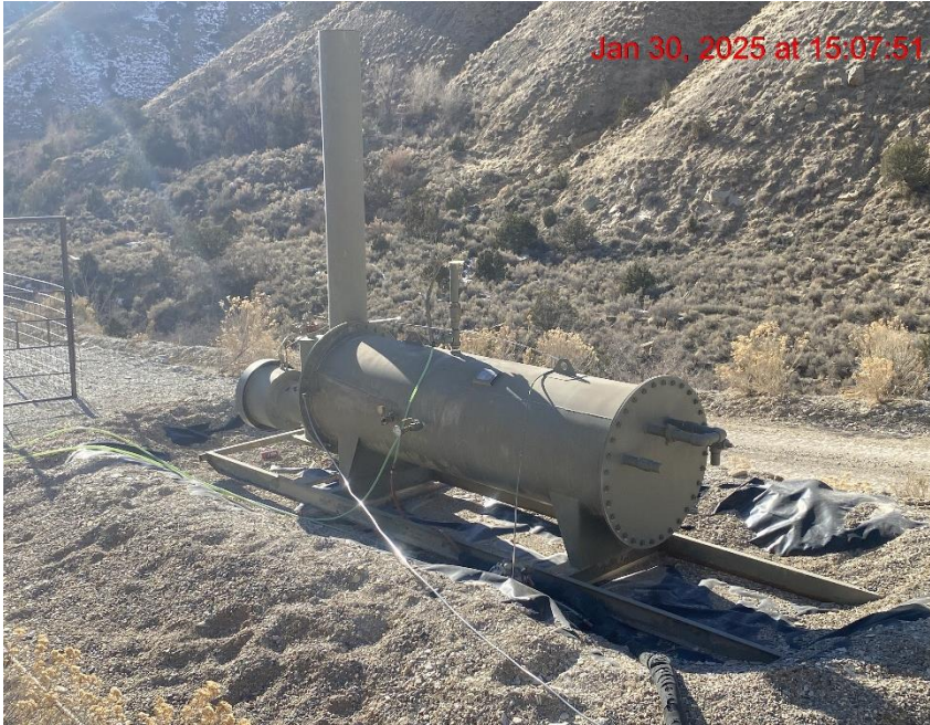
Location – Photo #06351