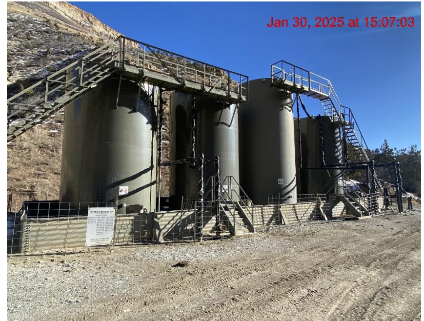
Location – Photo #06350