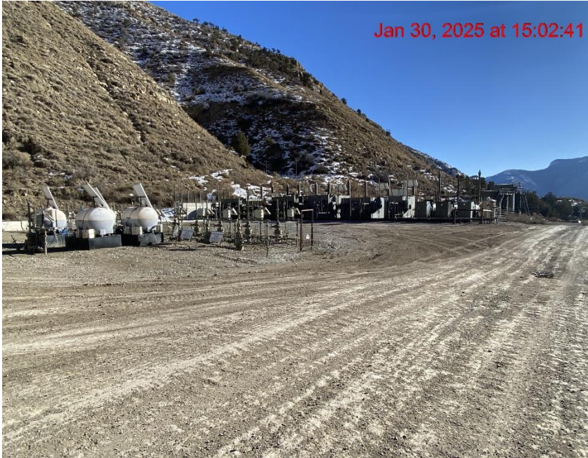
Location Overview – Photo #06343