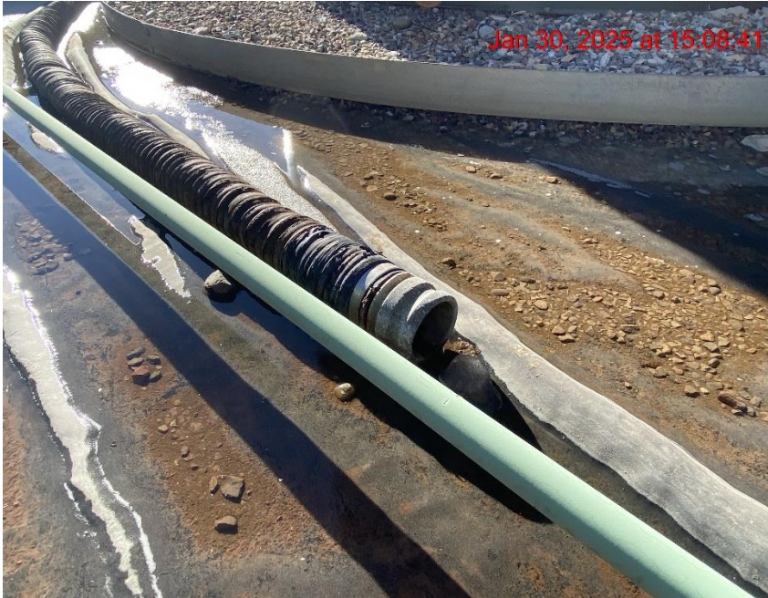
Stored Supplies/Wildlife Entry Hazard – Photo #06354