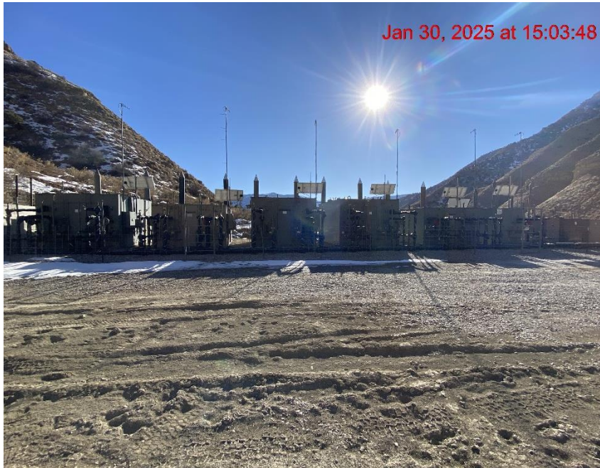
Location – Photo #06347