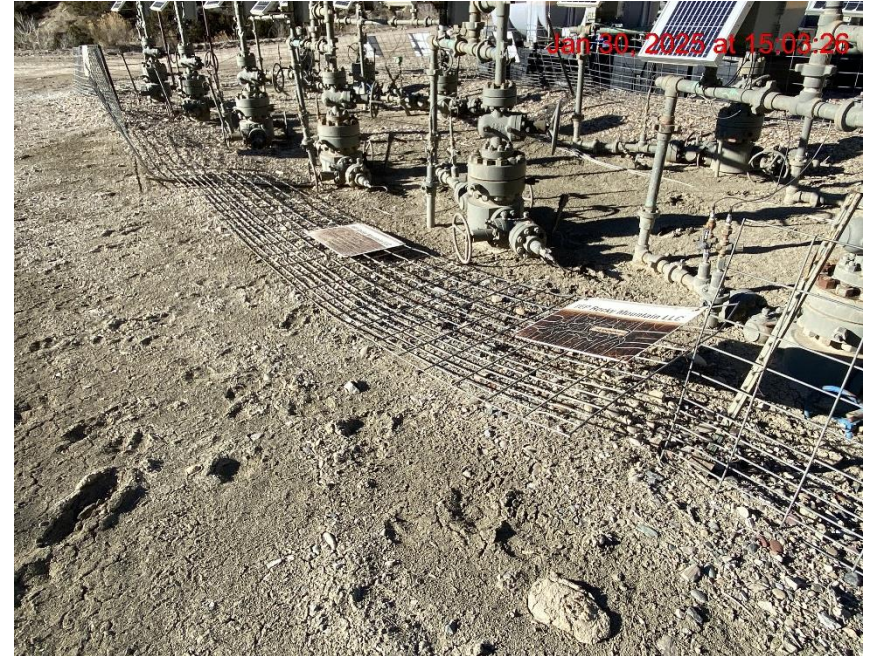
Fallen Wellhead Fencing – Photo #06345