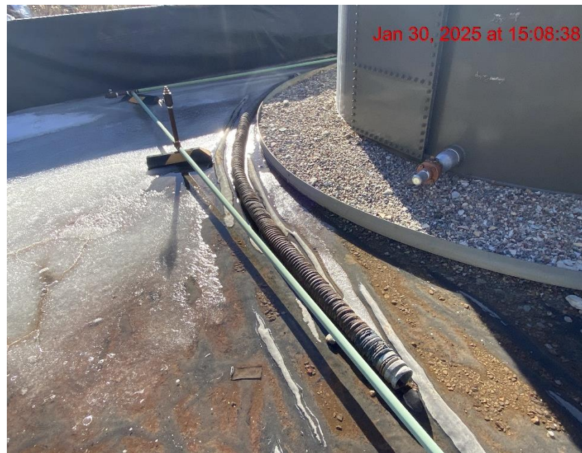
Stored Supplies/Wildlife Entry Hazard – Photo #06353