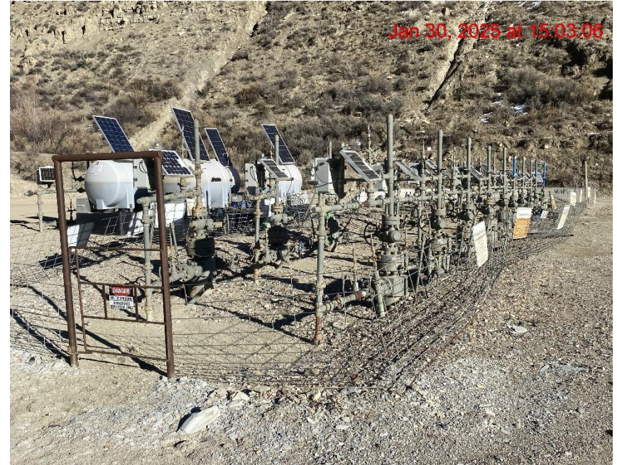
Location – Photo #06344