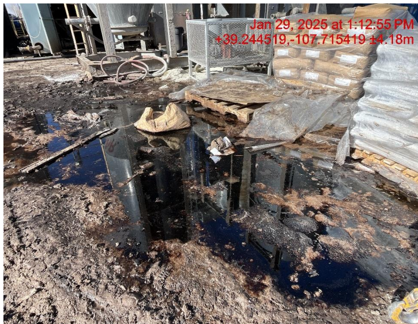
Photo # 3769 Failure to maintain chemical BMP's/Failure to cover materials