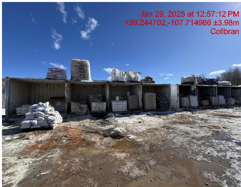
Photo # 3754 Failure to maintain chemical BMP's/Failure to cover materials