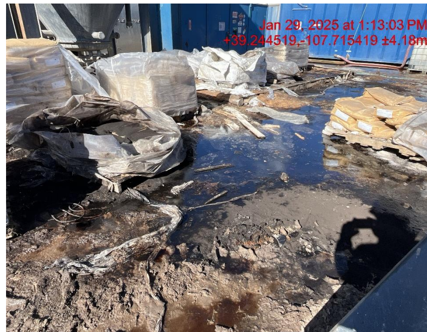
Photo # 3770 Failure to maintain chemical BMP's/Failure to cover materials