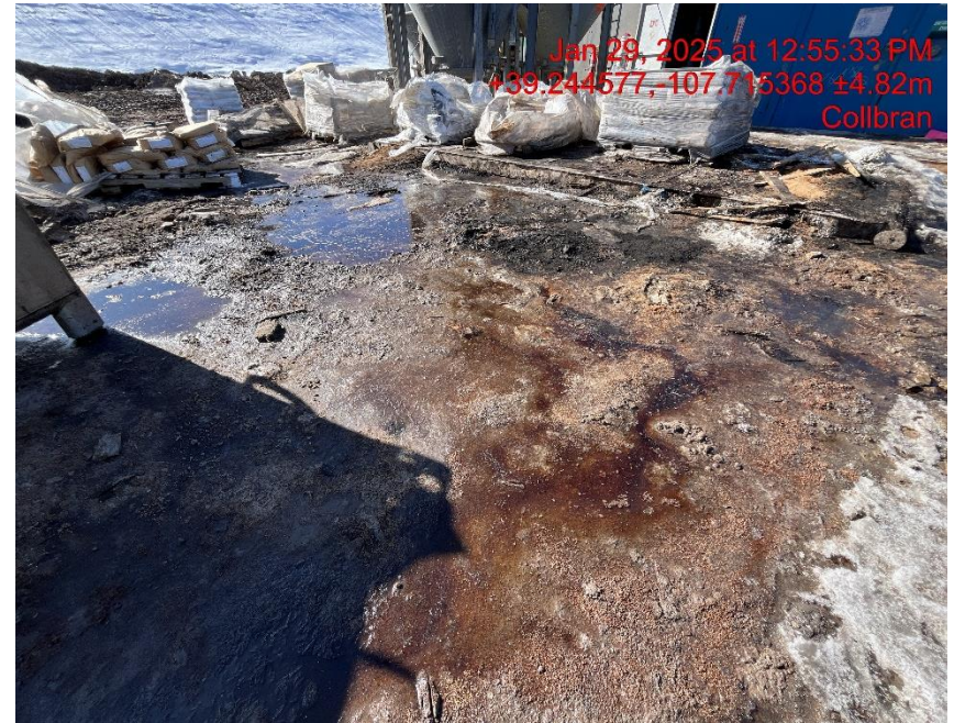
Photo # 3752 Failure to maintain chemical BMP's/Failure to cover materials