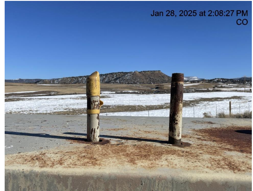
Photo # 1972 PRV vent line does not comply with CECMC pressure safety device rules