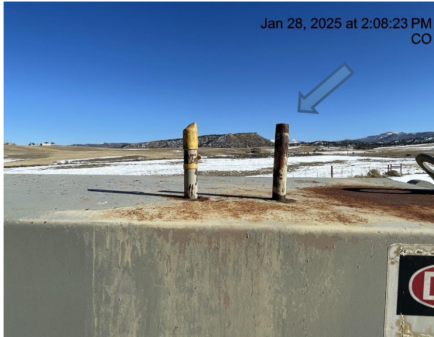
Photo # 1971 PRV vent line does not comply with CECMC pressure safety device rules