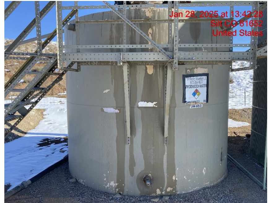
Staining on Tank – Photo #06214