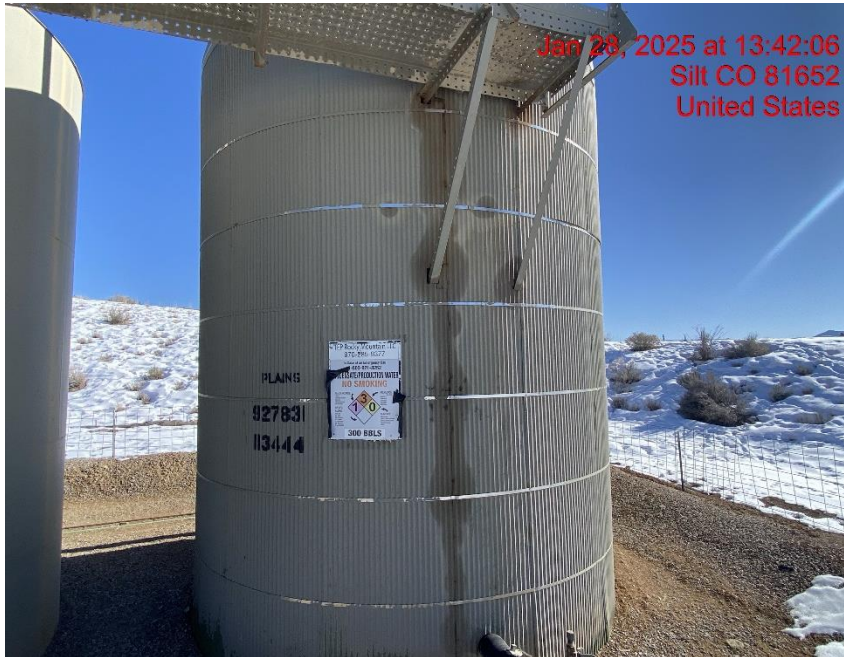
Staining on Tank – Photo #06212