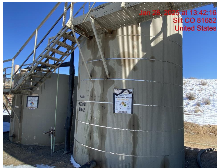
Staining on Tank – Photo #06213