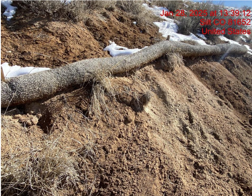
Rill Erosion Undercutting BMP – Photo #06202