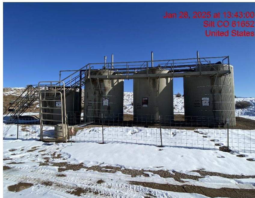
Location – Photo #06215