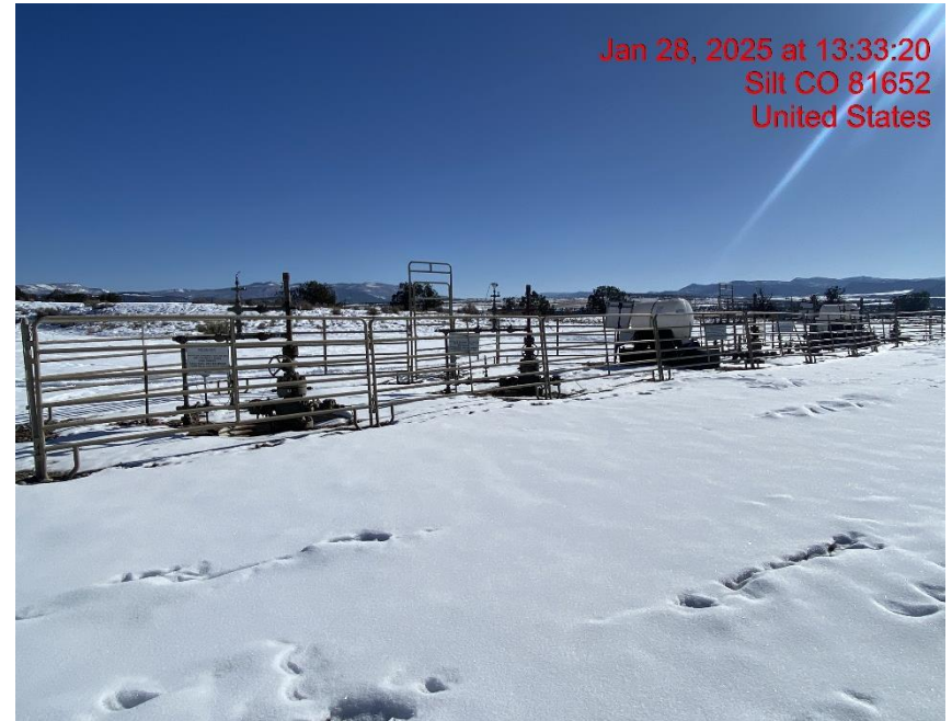
Location Overview – Photo #06195

Jan 28, 2025 at 13:33:20 Silt CO 81652 United States