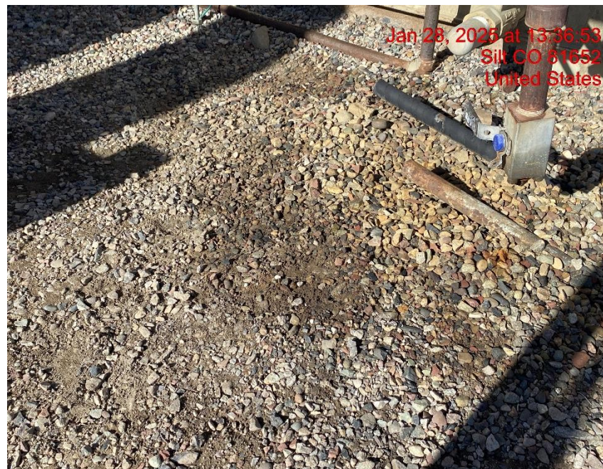
Stained Soil – Photo #06198