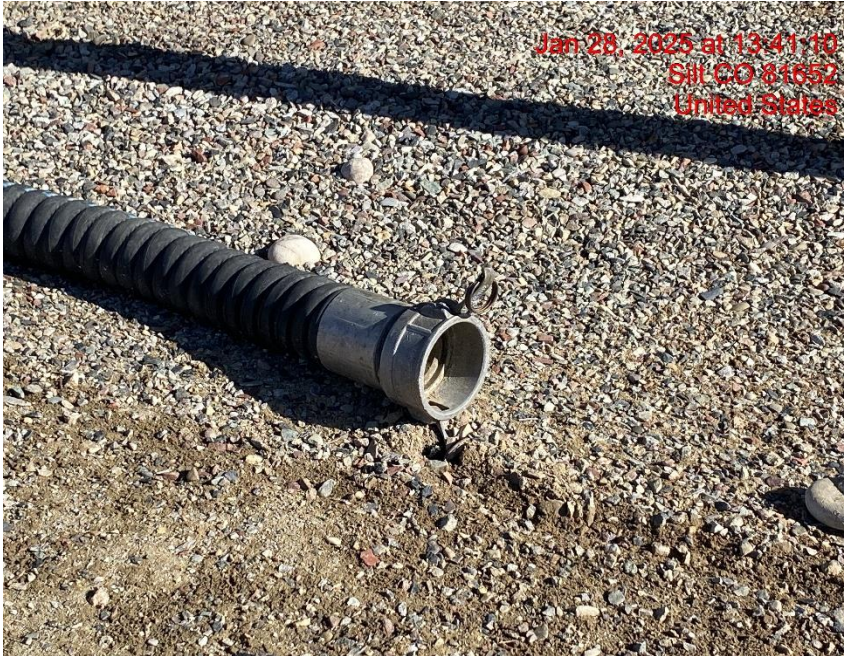
Stored Supplies/Wildlife Entry Hazard – Photo #06210