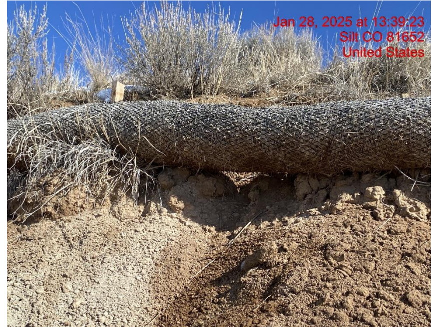
Rill Erosion Undercutting BMP – Photo #06203