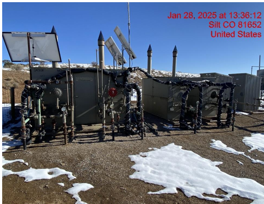
Location – Photo #06197