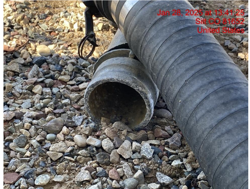
Stored Supplies/Wildlife Entry Hazard – Photo #06211