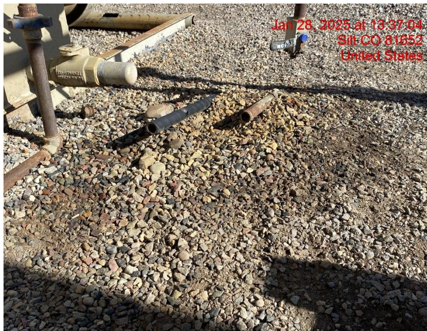
Stained Soil – Photo #06199