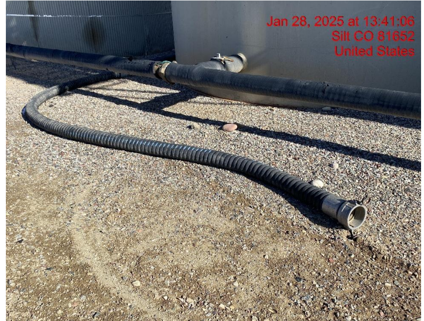
Stored Supplies/Wildlife Entry Hazard – Photo #06209