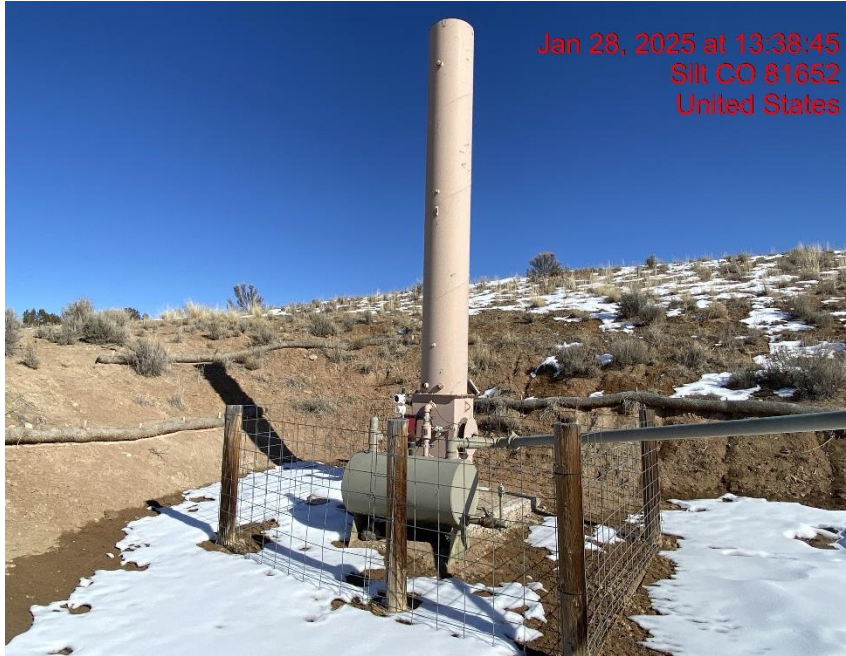
Location – Photo #06201