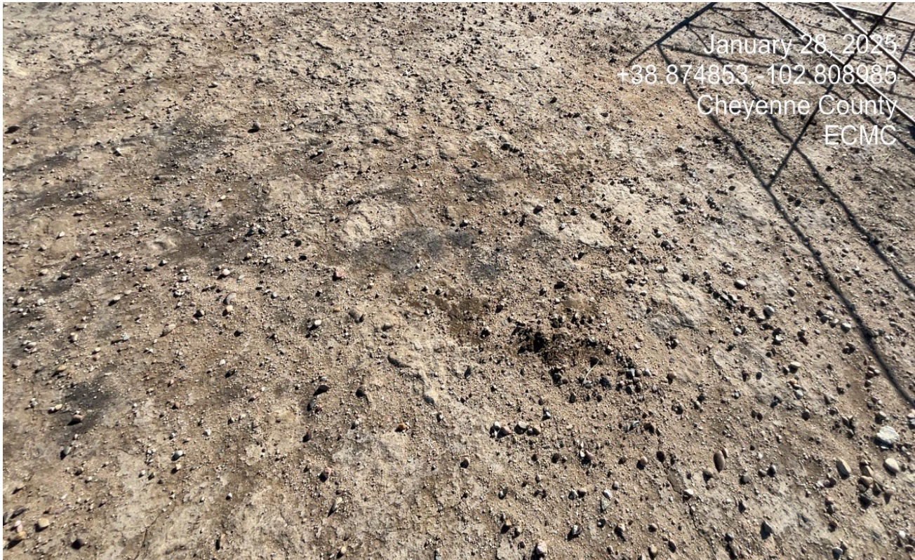
Photo 8. View of blackened hardened soil at the location. Samples will need to be taken to evaluate soil suitability for reclamation.