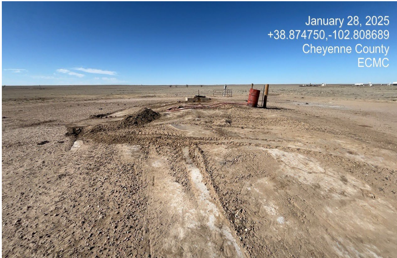
Photo 5. Facing west toward the area where the pumpjack was located. All equipment, risers, and debris must be removed within 3 months of abandonment.