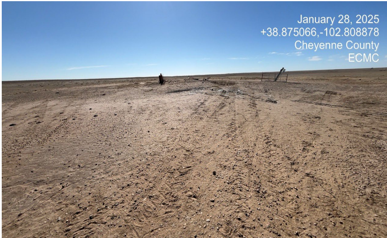
Photo 2. Facing southeast toward the location. It appears the well was recently plugged and abandoned.