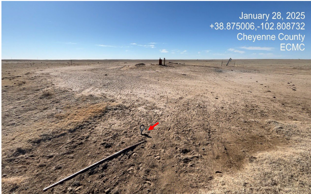
Photo 6 . There are 4 guyline anchors that remain at the location that must be removed within 3 months of abandonment