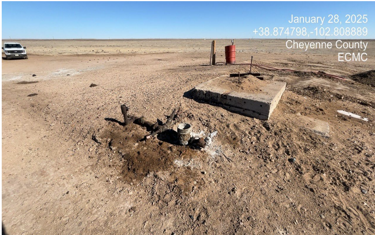
Photo 4. Facing toward the wellhead. There are stained soil at the wellhead. This area will need to be sampled and remediated for decommissioning of the well.