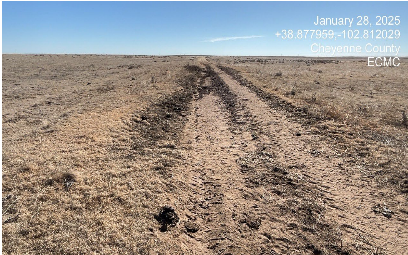
Photo 1. Facing southeast toward the access road. The access road is eroded and will need to be regraded to match the surrounding contours which may require imported topsoil.