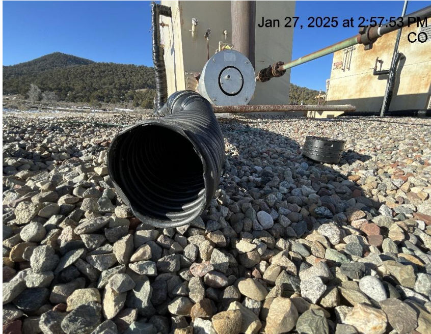
Photo # 1675 Flowline heating insulation open ended /wildlife hazard/available for entry by wildlife