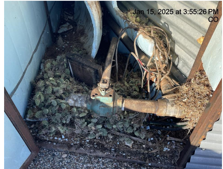
Photo # 9418 Catalytic heater inside secondary containment /fire & safety hazard