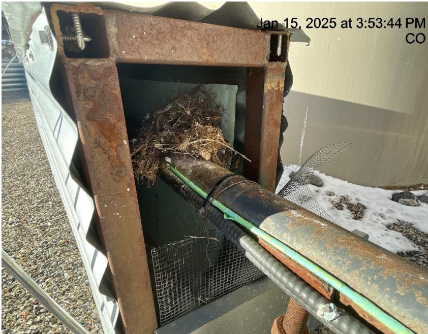
Photo # 9419 Pipe enclosure available for entry by wildlife /wildlife hazard