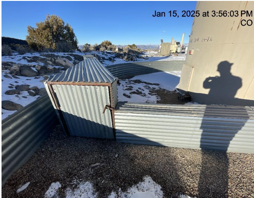
Photo # 9417 Enclosure containing piping & catalytic heater inside secondary containment