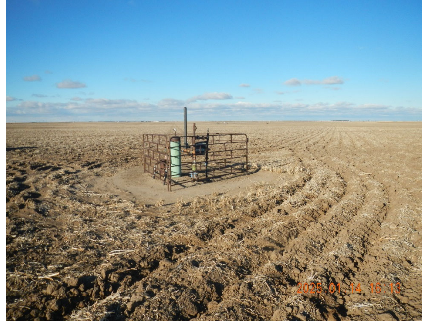
4. Well location overview.