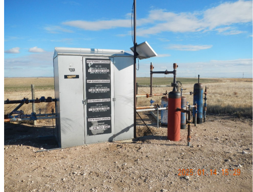
6. View of shared meter shed.