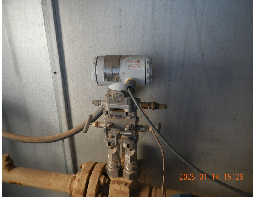
7. Gas meter inside meter shed.