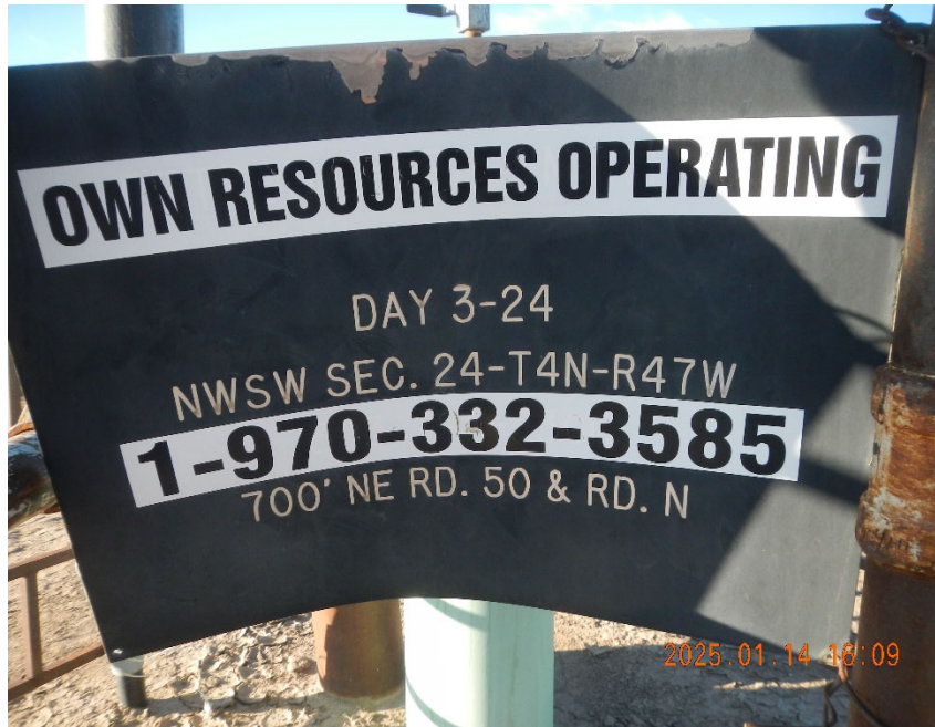
1. Lease sign at well location.