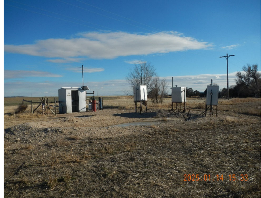
10. Gathering location overview.