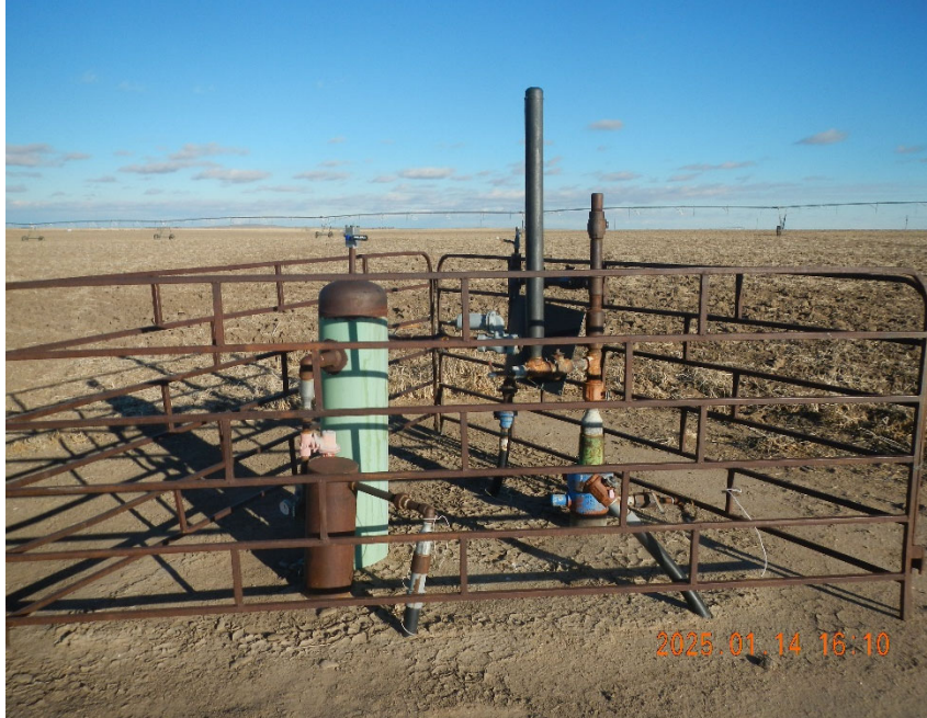
3. View of Domestic Tap Equipment and well.