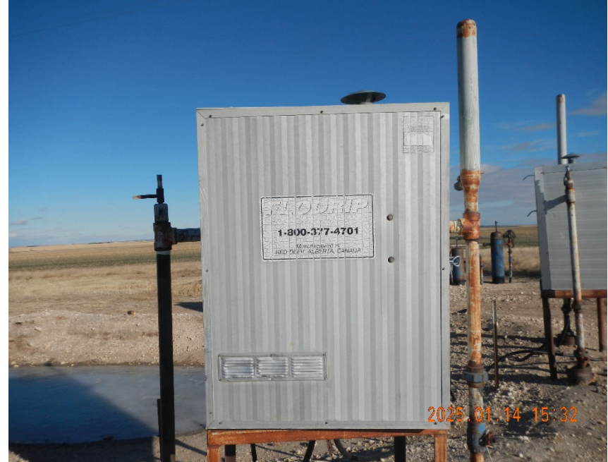
8. Separator on shared location with no signage to indicate well association.