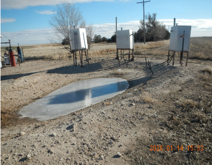
9. View of pit on shared location with multiple separators discharging to pit in the background.