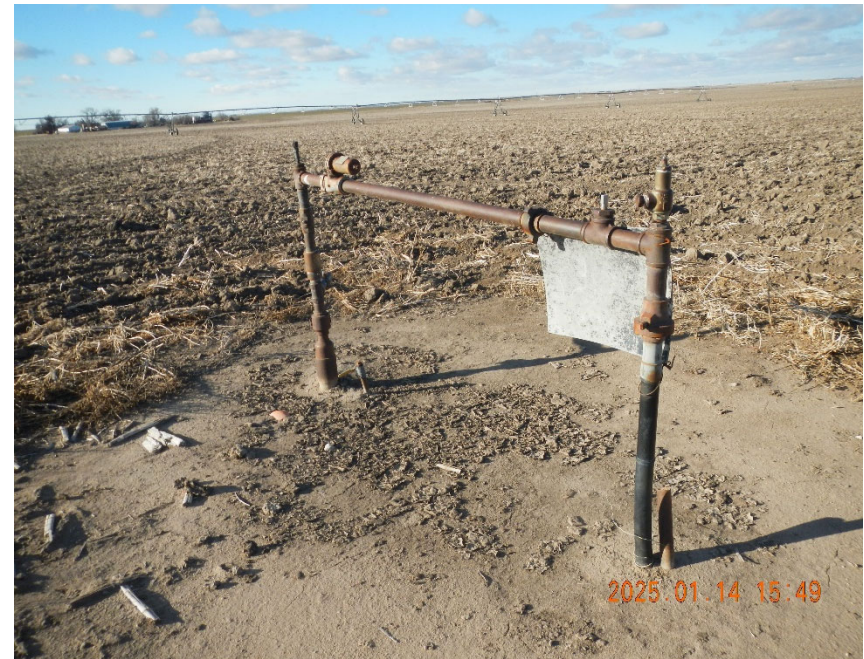
2. View of wellhead and flowline.