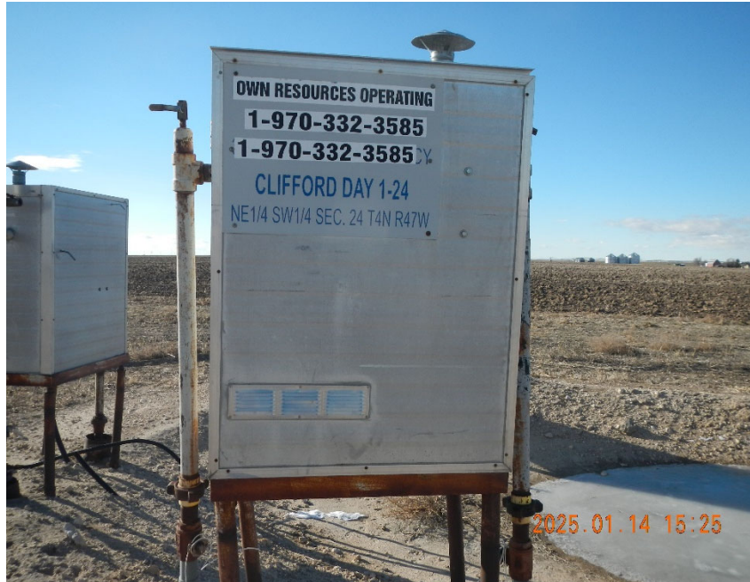
7. Flowline mounted separator box.