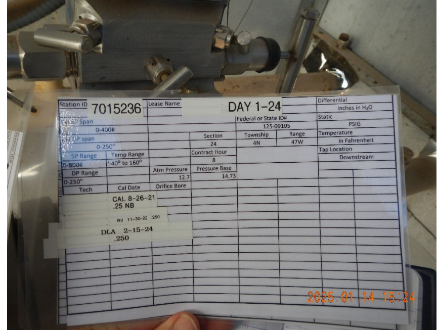
6. Calibration log with incorrect well API number.