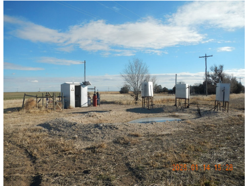
8. Gathering location overview.