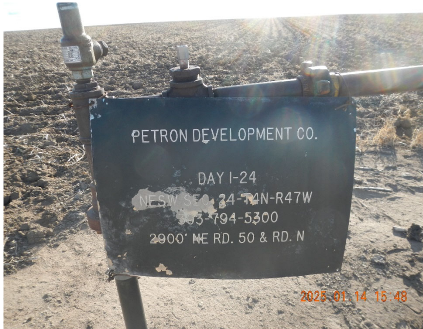
1. Lease sign at well location. Note incorrect operator on sign and no emergency contact information.