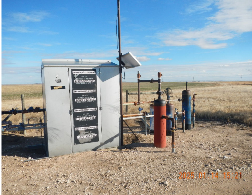
5. View of shared meter shed.