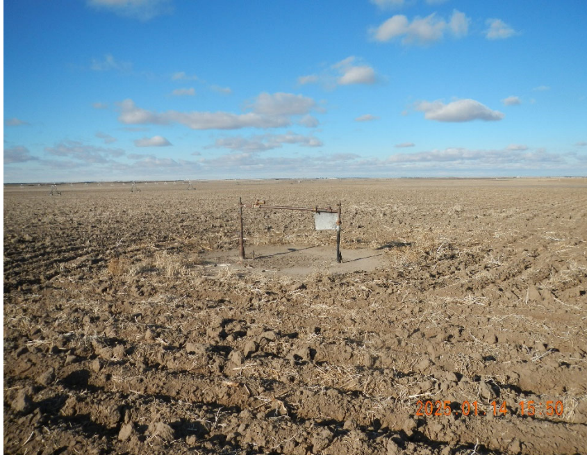
3. Well location overview.