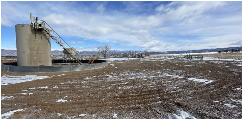
South West corner of location.