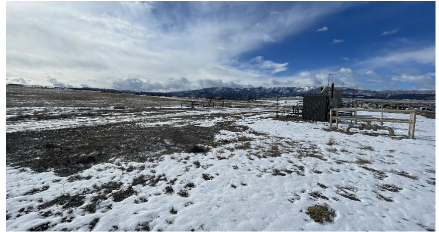
North East corner of location.