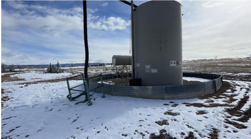
North West corner of location.