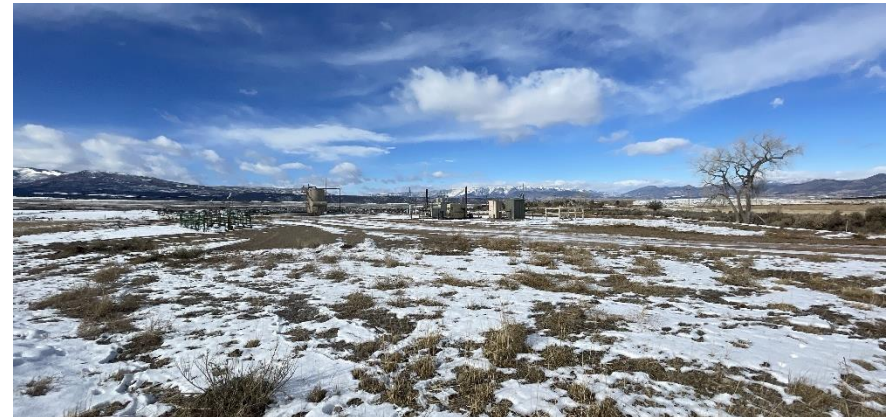
South East corner of location.