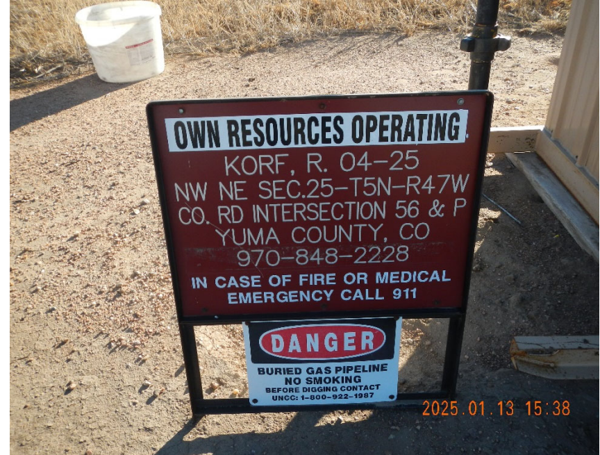
4. Lease sign at gathering location. Note incorrect emergency contact information.