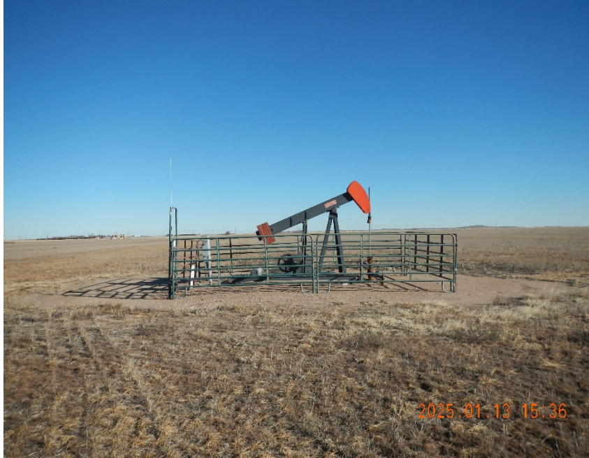
3. Well location overview.