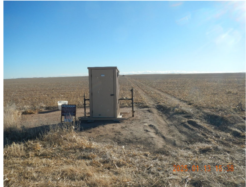
6. Gathering location overview.