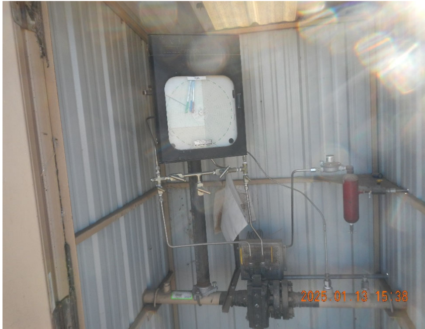
5. Gas meter inside meter shed.