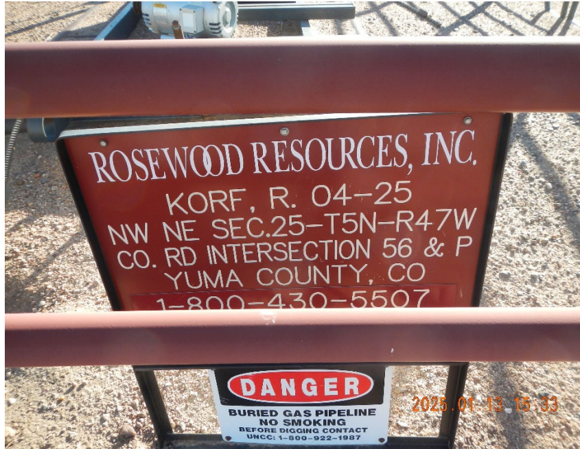
1. Lease sign at well location. Note incorrect operator and incorrect emergency contact information.