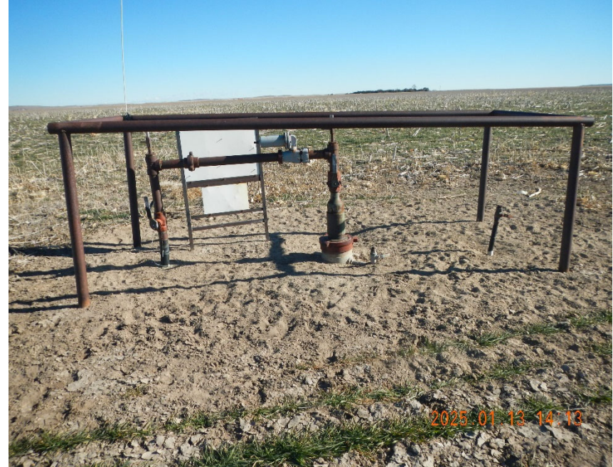
2. View of wellhead.