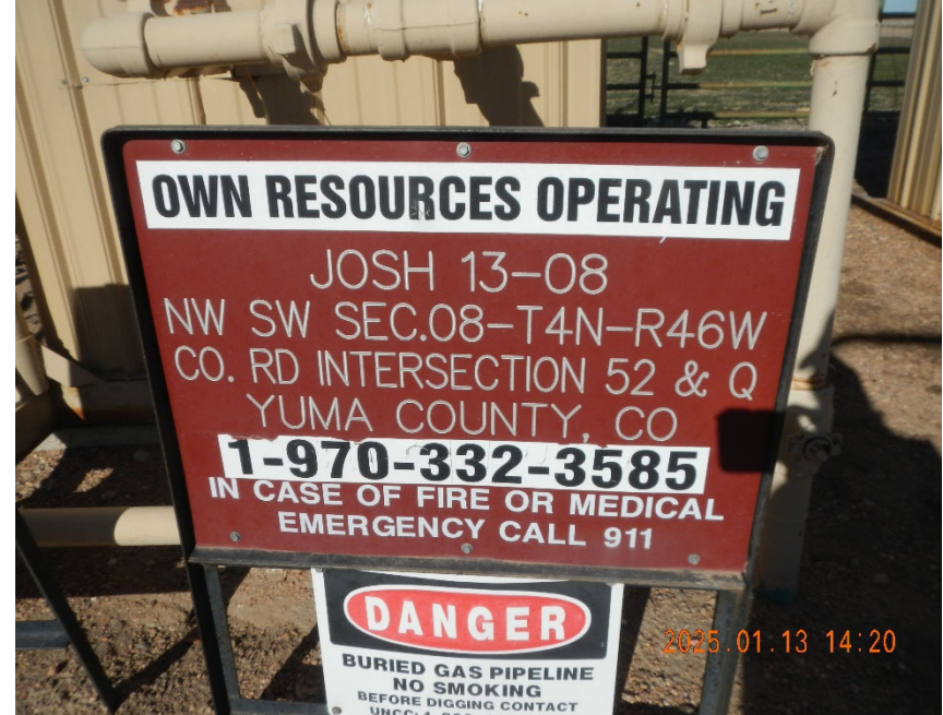
4. Lease sign at gathering location.