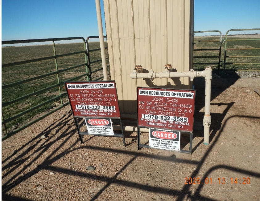
5. Shared meter shed.