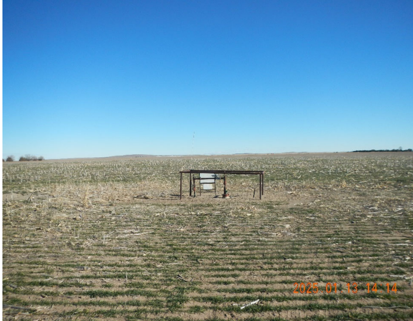
3. Well location overview.