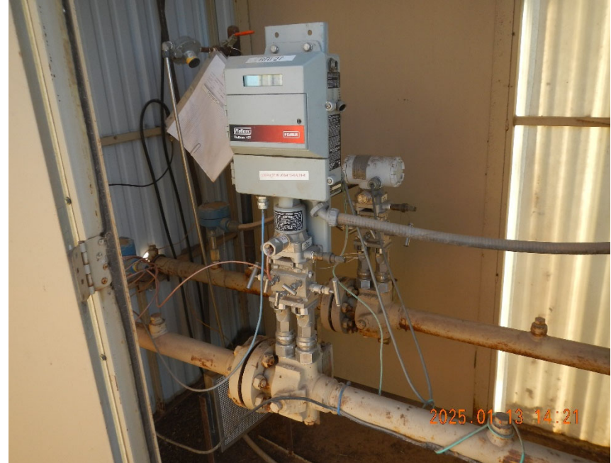
6. Gas meter inside meter shed.