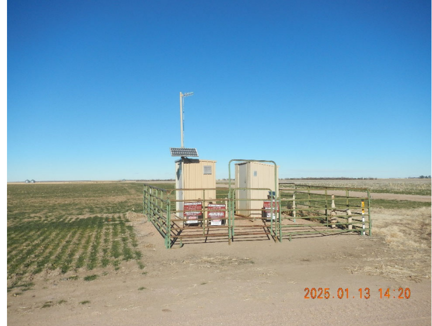
8. Gathering location overview.